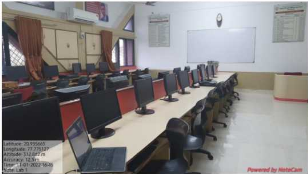
Computer Science Lab 1