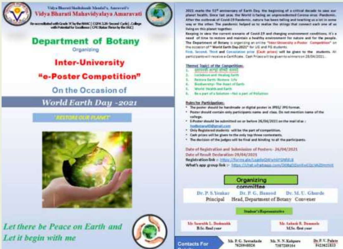
Brochure of the e-Poster Competition