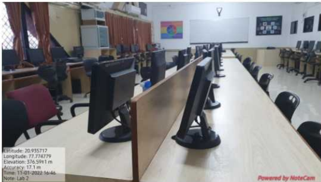
Computer Science Lab 2