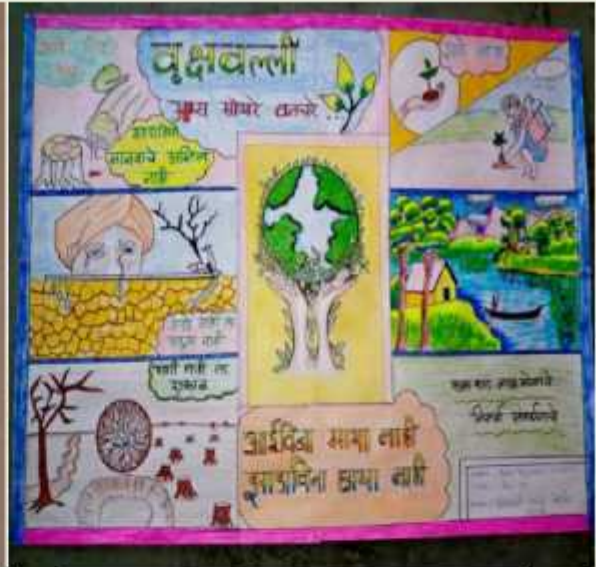
I Consolation Prize