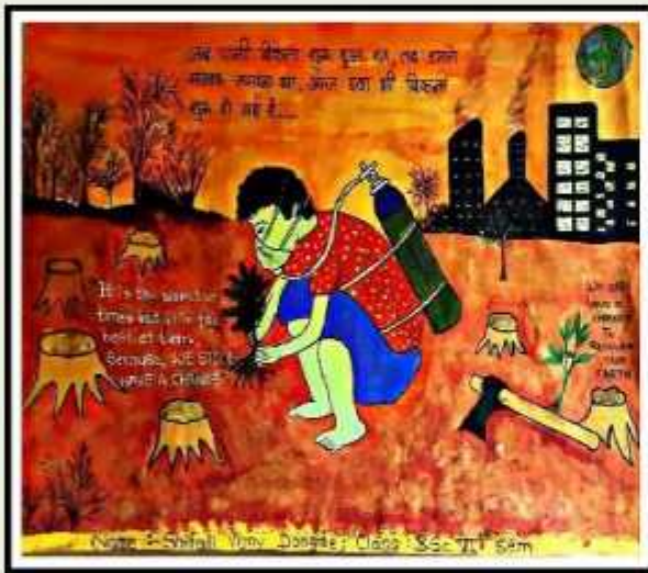
II Consolation Prize