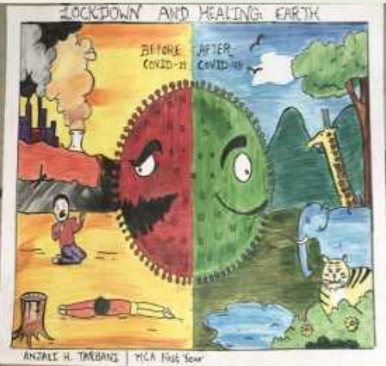
III Consolation Prize