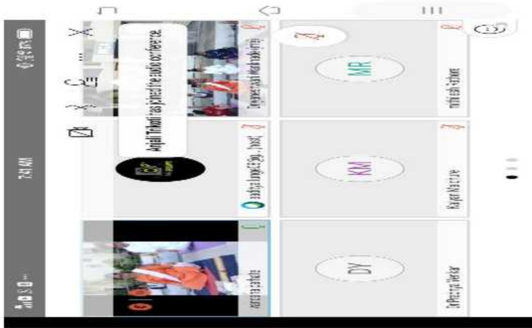
Vidya Bharati Shikshanik Mandal, Amravati International Yoga Day