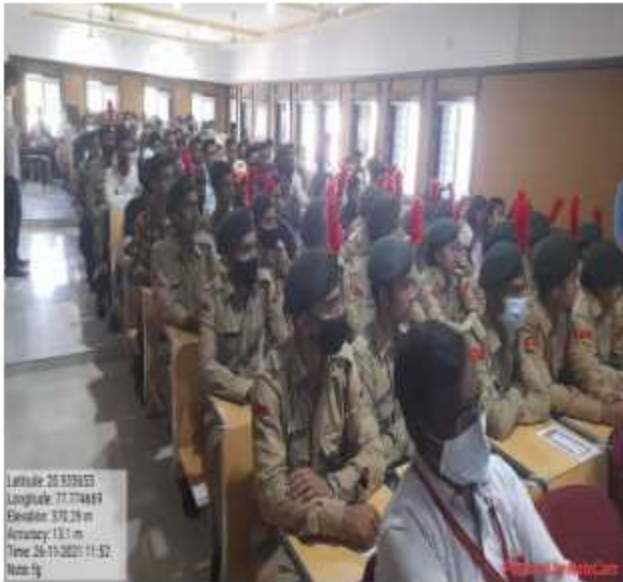
Latitude: 20.537053 Longitude: 77.748697 Elevation: 570.29 m Accuracy: 13.1 m Time: 26-11-2021 11:52 Note: fy