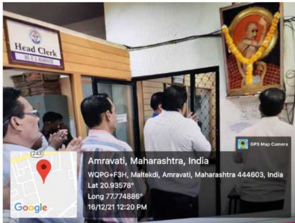
Weekly Gajanan Aarti being performed at college by the office staff