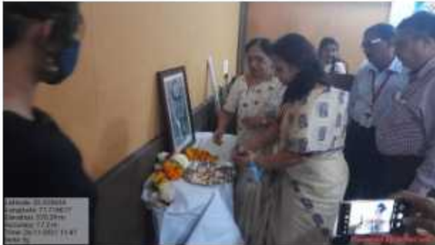
Latitude: 21.330654 Longitude: 77.748697 Elevation: 570.29 m Accuracy: 7.7 m Time: 26-11-2021 11:47 Note: fy