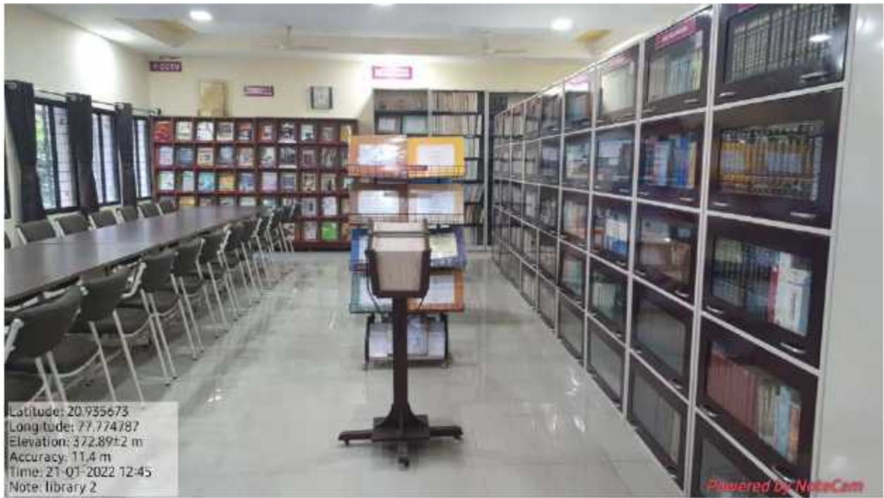
Central Library: Periodical and Reference Section