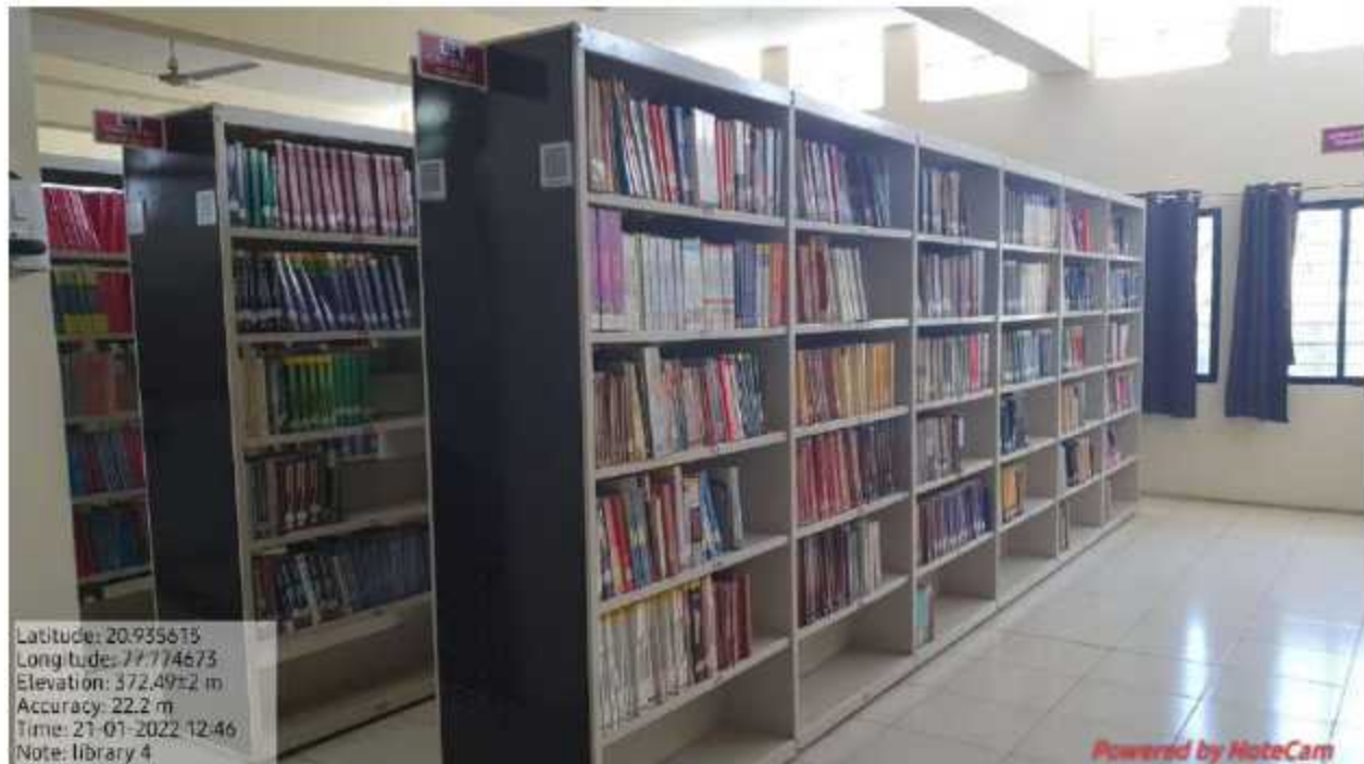
Stack Room: Central Library