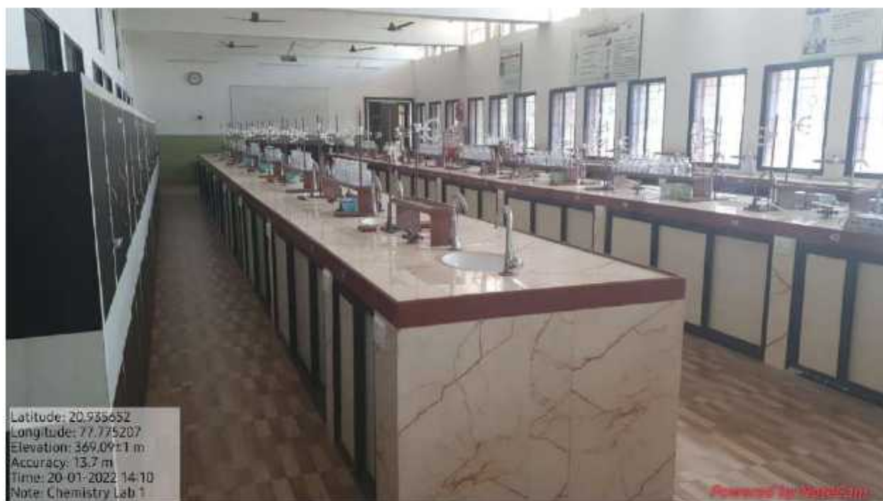
Chemistry Lab 1