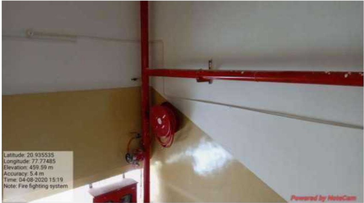
Fire Fighting System