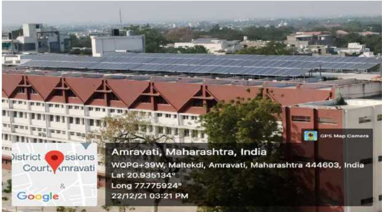
Photovoltaic Panel on the Terrace