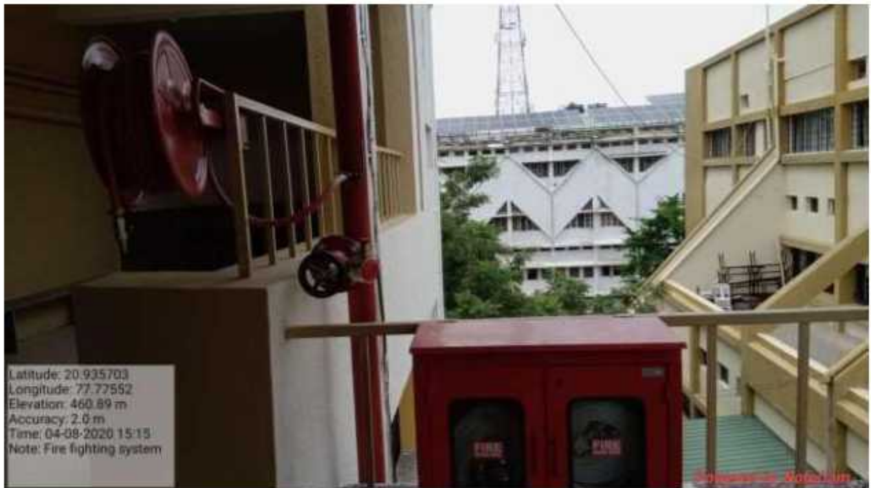
Fire Fighting System