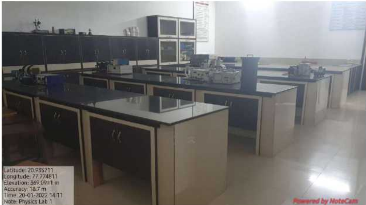
Physics Lab 1