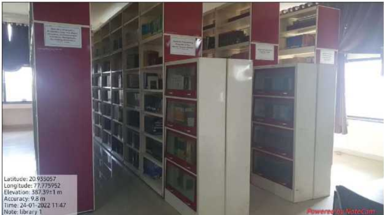
Library: Self Finance Wing Stack Room