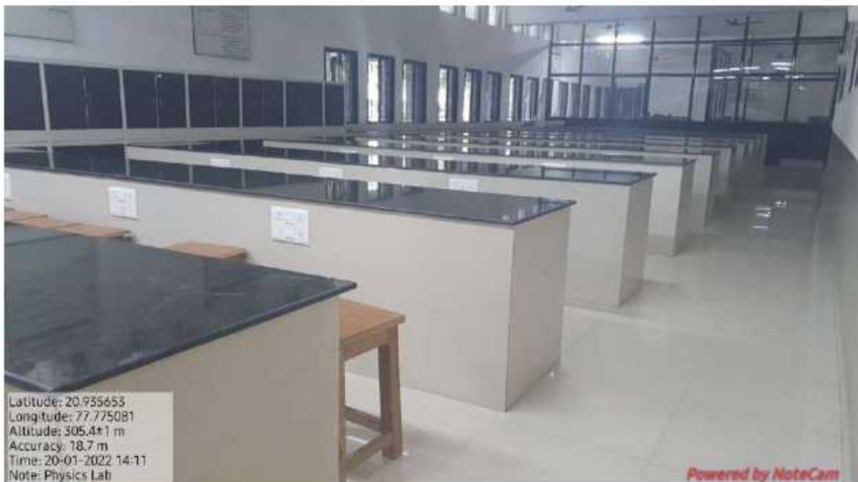
Physics Lab 2