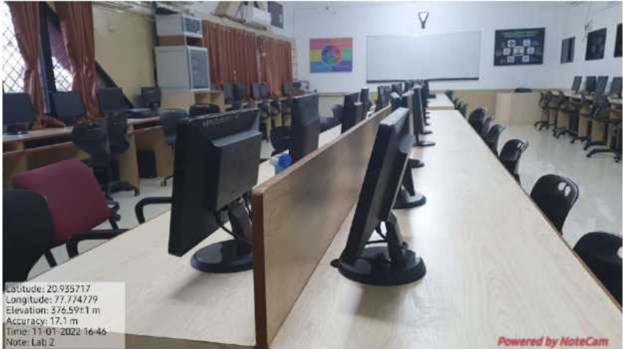
Computer Science Lab 1