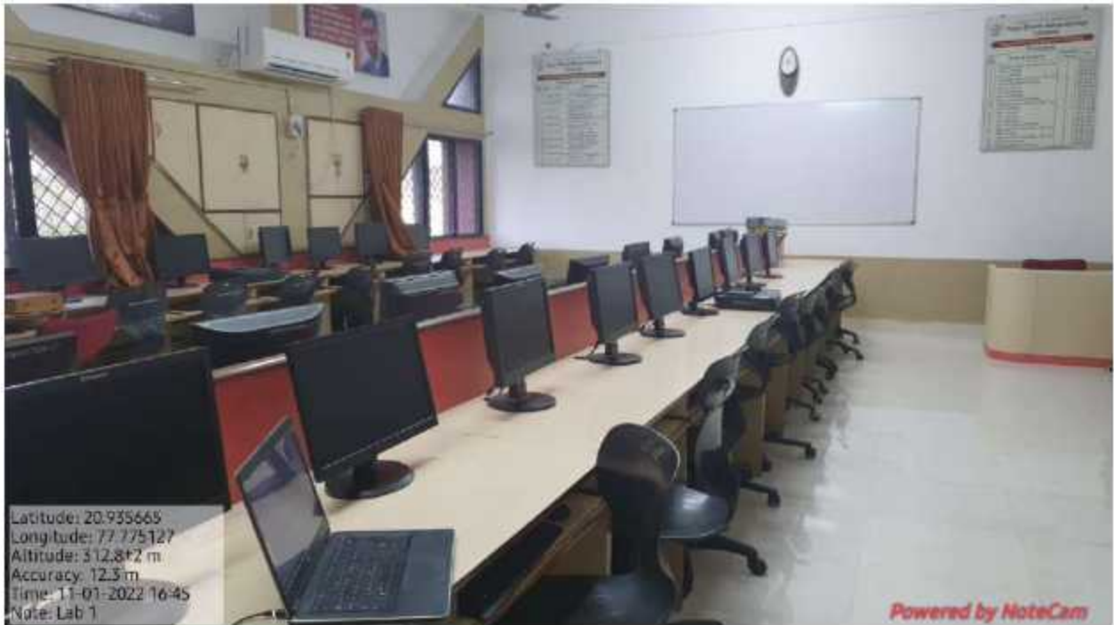
Computer Science Lab 2