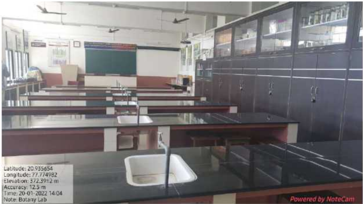
Botany Research Lab