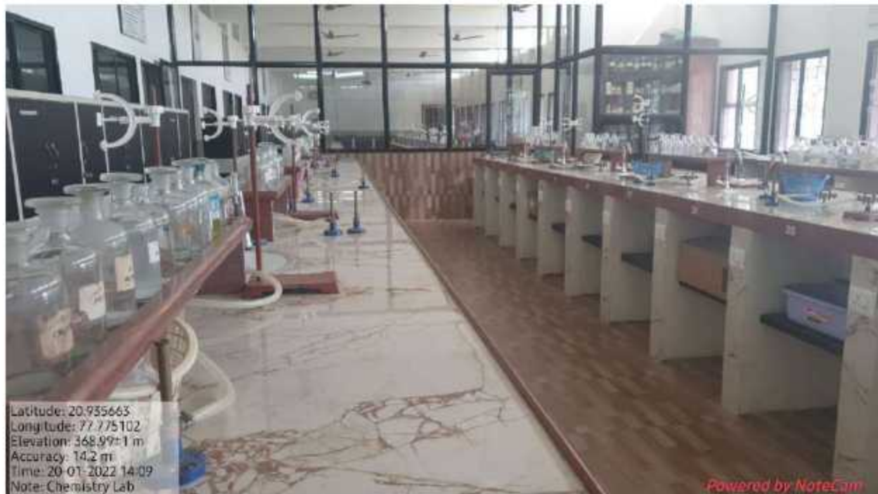
Chemistry Lab 2