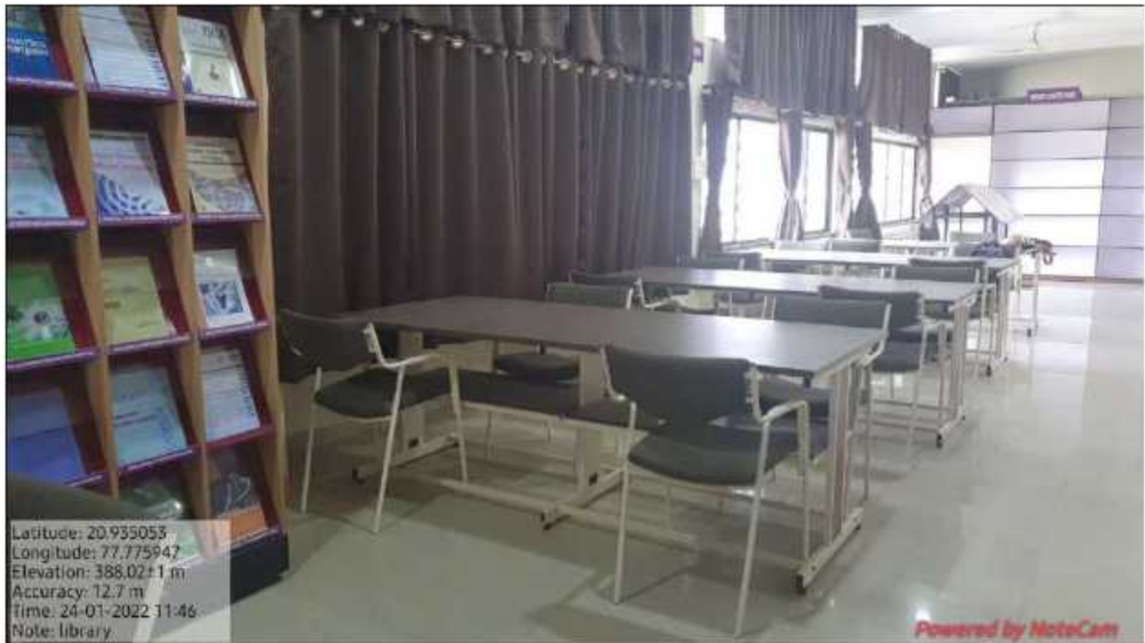
Library: Self Finance Wing