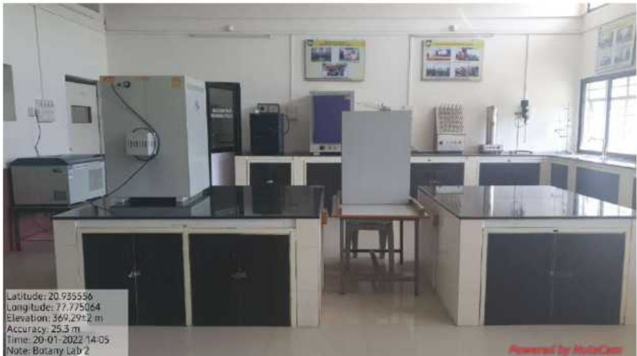
Botany Lab PG