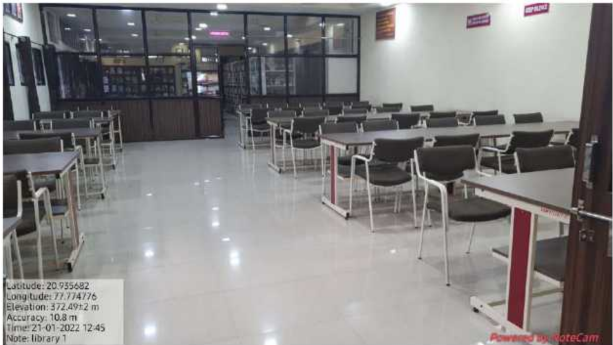
Central Library: Reading Hall