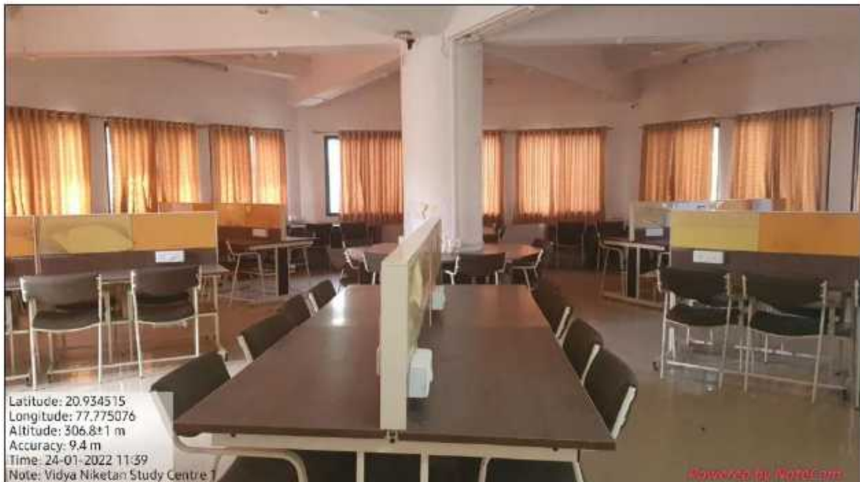
Vidya Niketan Study Centre

Latitude: 20.934515 Longitude: 77.775076 Altitude: 306.8±1 m Accuracy: 9.4 m Time: 24-01-2022 11:39 Note: Vidya Niketan Study Centre