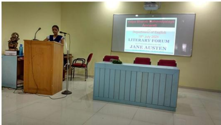
Student of English Literature sharing her views on Jane Austen