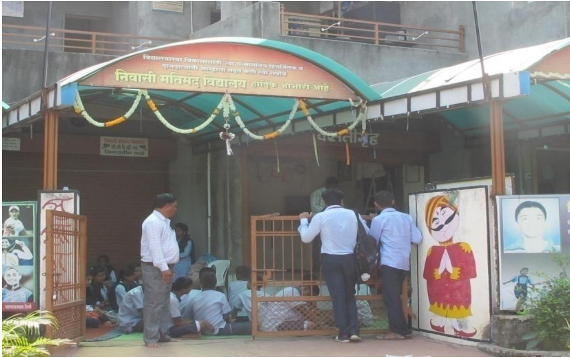
Students sitting in Niwasi Matimand Vidyalaya, Girmkar Layout Amravati in a NGO visit programme