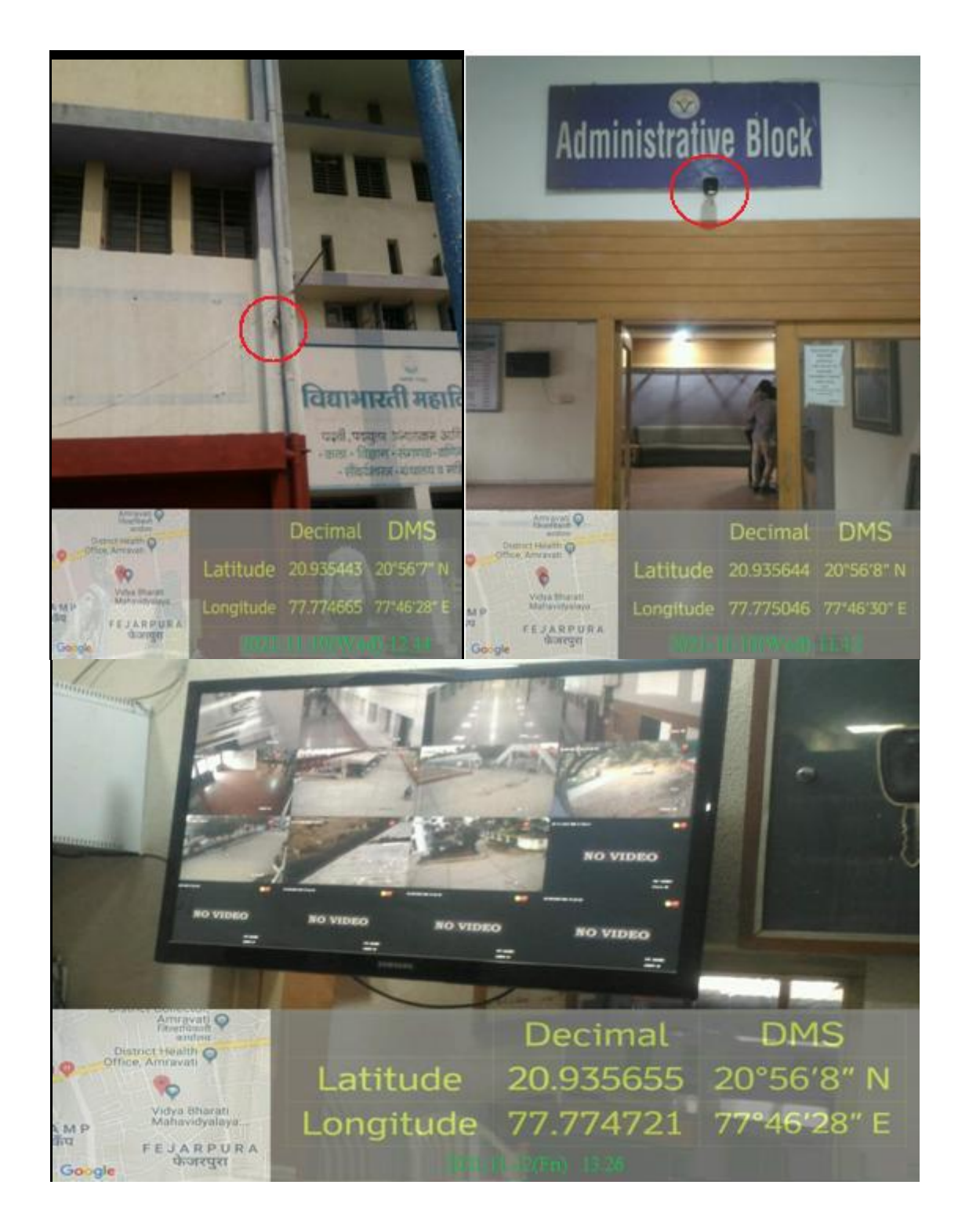
CCTV under the supervision of superintendent