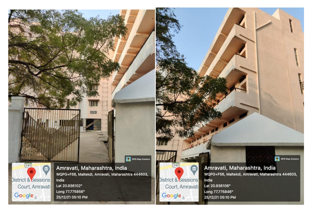
Pratibha Ladies Hostel for the girl students from the rural areas