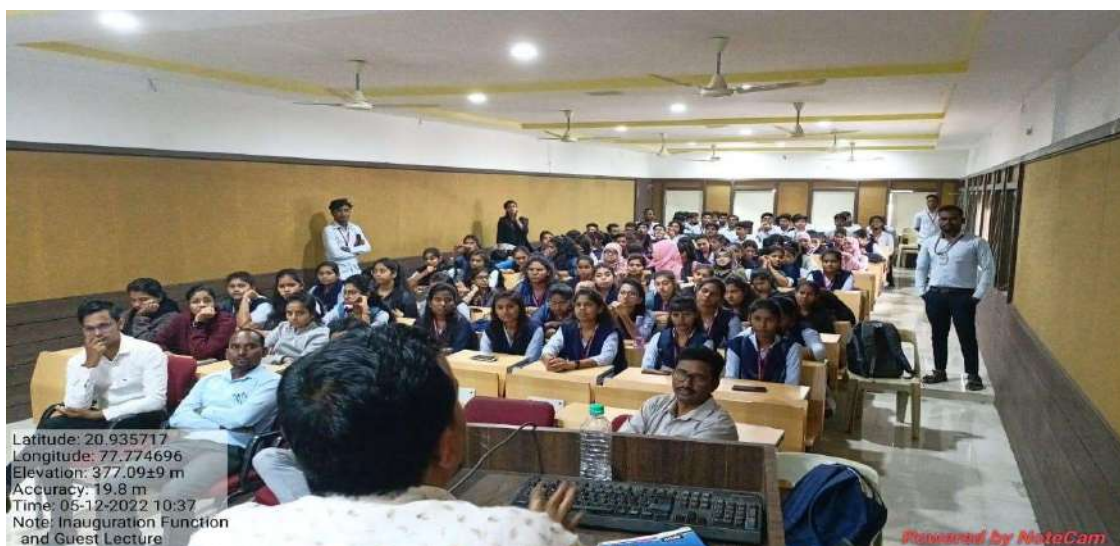
Students along with teachers grasping the innovative ideas of NET/SET preparation