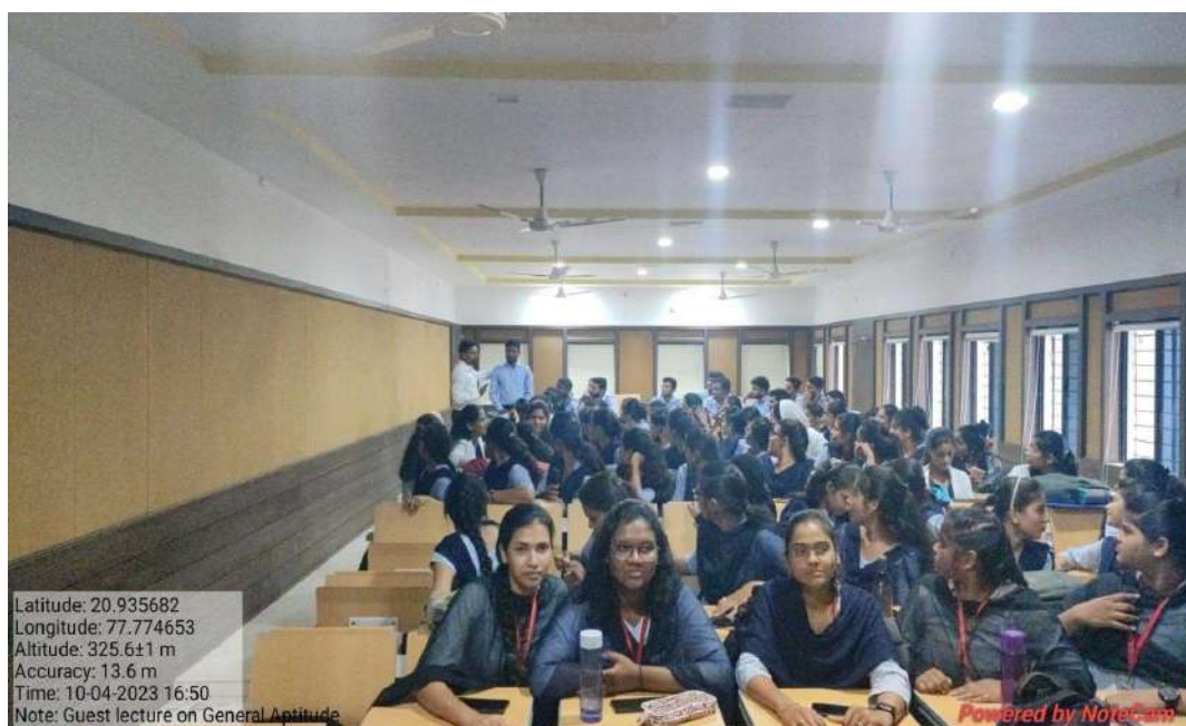
Participants having interaction with the resource person