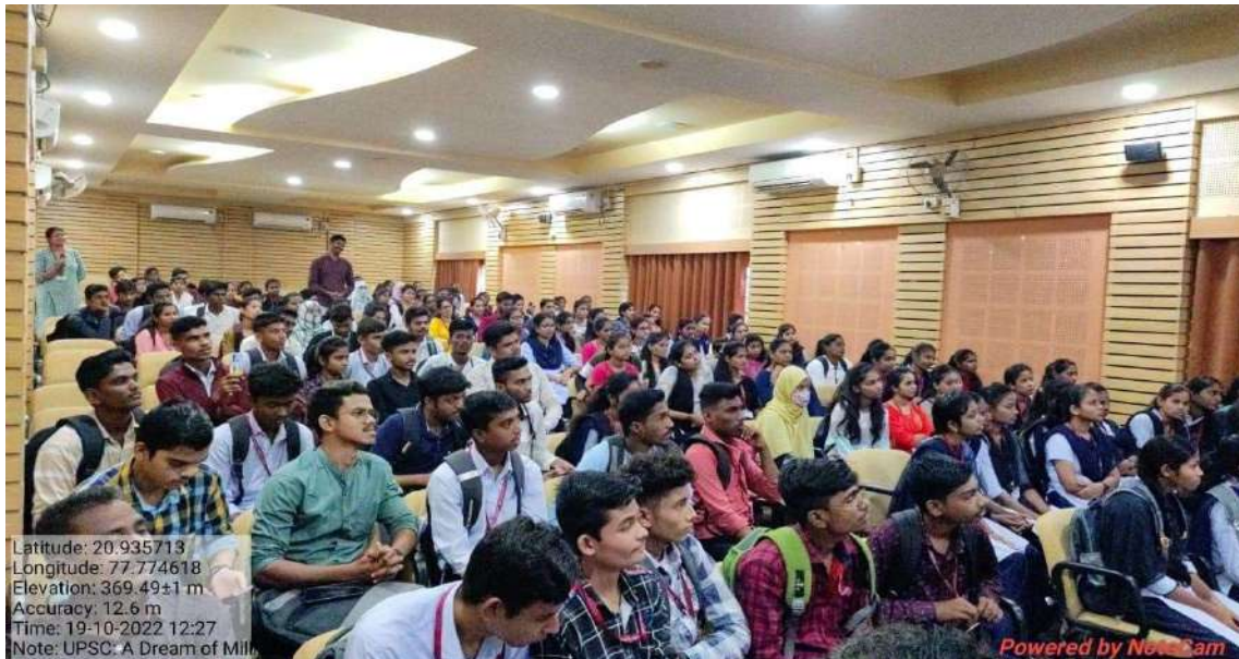
Students having interaction with the guest speaker