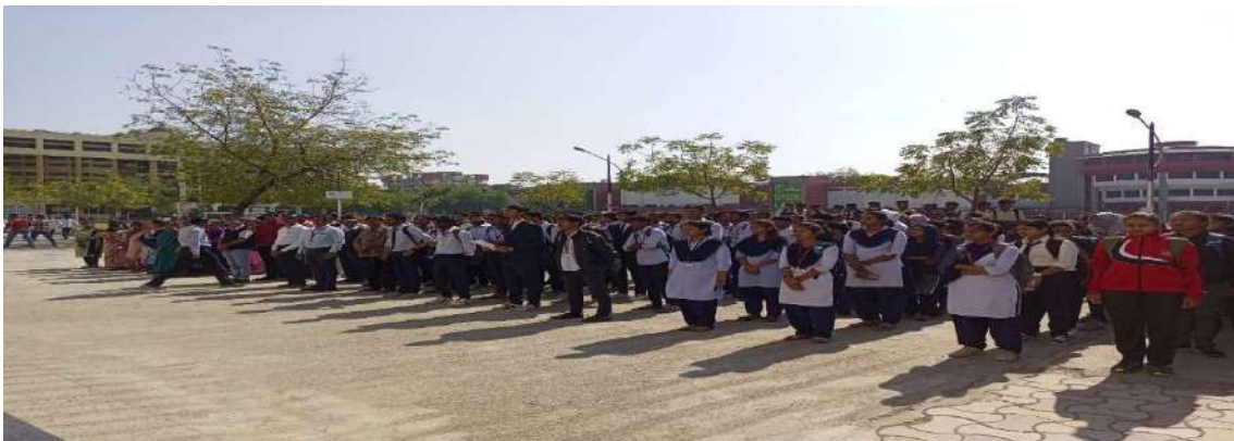
Students of Vidya Bharati Mahavidyalaya reading a Preamble Indian Constitution on 26/10/2023