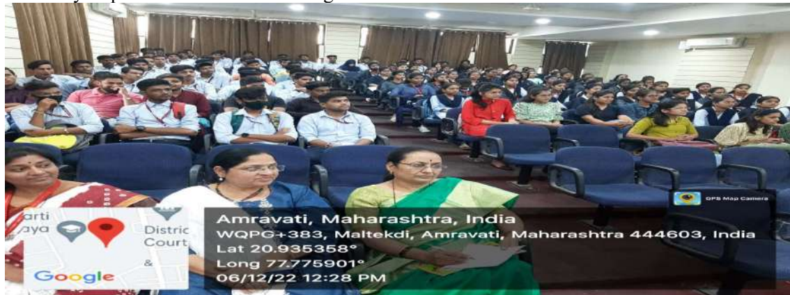
Students who participated in Seminar on Cell to Prevent Sexual Harassment on the topic”

Dr. Varsha Deshmukh enlightened on the topic “Role of Internal Complaint Committee under POSH (Protection of Women from Sexual Harassment) “.Building up of a value based work culture is expected to be inherent in every educational setting; Moreover in our male dominated society, issues related to women are quite complex and are multi-folded and overlapping day by day, Today cyber crime is a global phenomenon. With the advent of technology, cyber-crime and victimization of women are on the high and it poses as a major threat to the security of a person as a whole. Home was the safest place for a woman to protect herself from being victimized, but not now. So in order to sensitize ourselves from this issue our today’s topic revolves around Protection of Women From Sexual Harassment. What it is?, What is the role of Internal Complaint Committee, What is POSH, Rules and Procedures, Redressal Mechanism and many such issues were discussed by the guest speaker for today’s seminar She discussed various types of crimes going on today, along with the necessary steps to avoid and be aware against it.