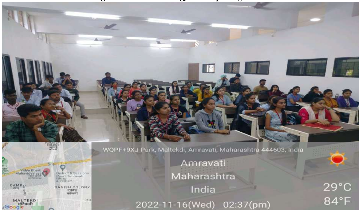
Students and the Staff patiently listening the Guest, explaining How the mobile technology works, issues and remedies on it.