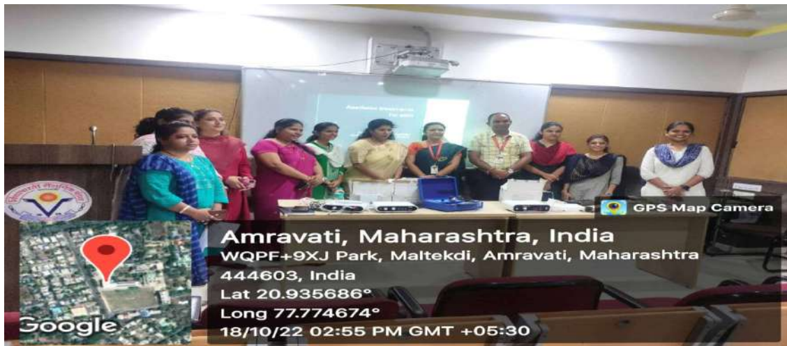
All Staff with Speaker

Outcome of this guest lecture is to set forth certain understanding of various aesthetic treatment for skin care and their application used in advance.