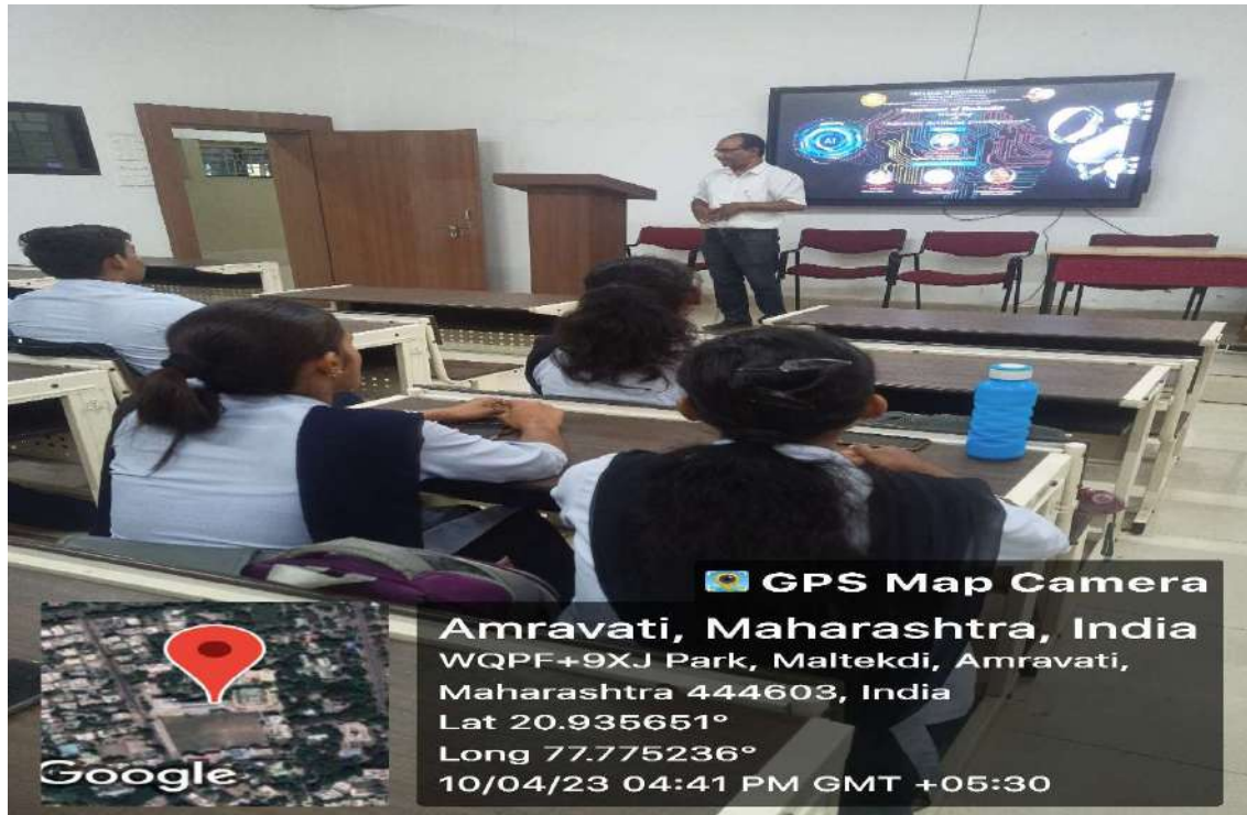
Students patiently listening the Guest, explaining How the AI can be used in Academics purposes.