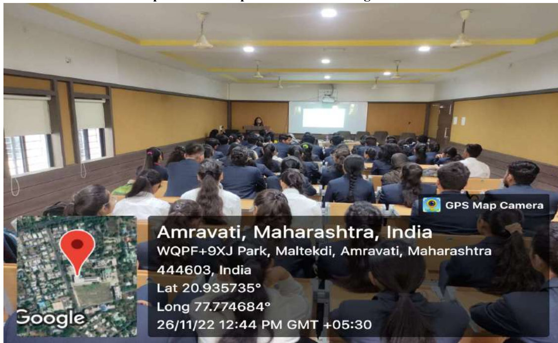
Students are fascinate about hair anatomy