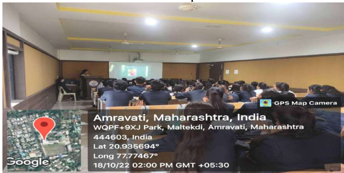
Speaker addressing the Students