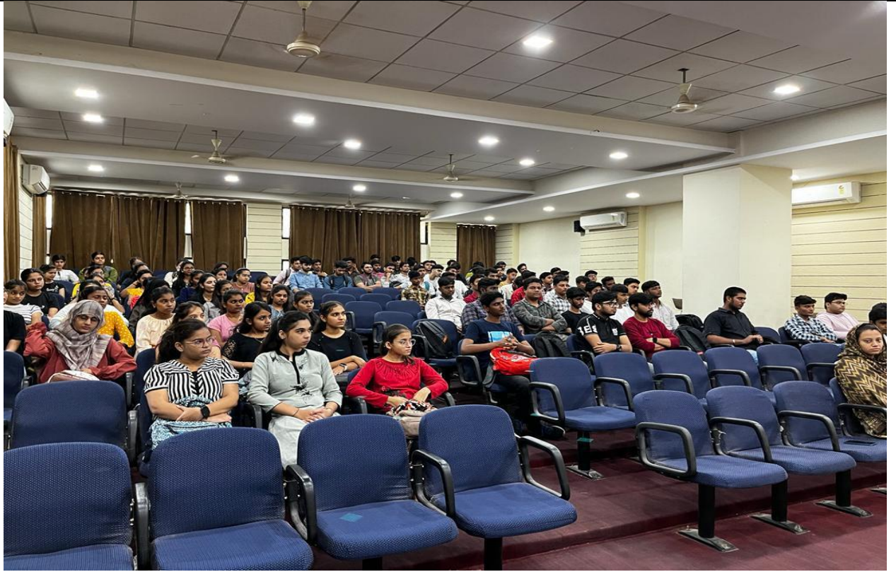
BBA Induction Programme 2023-24