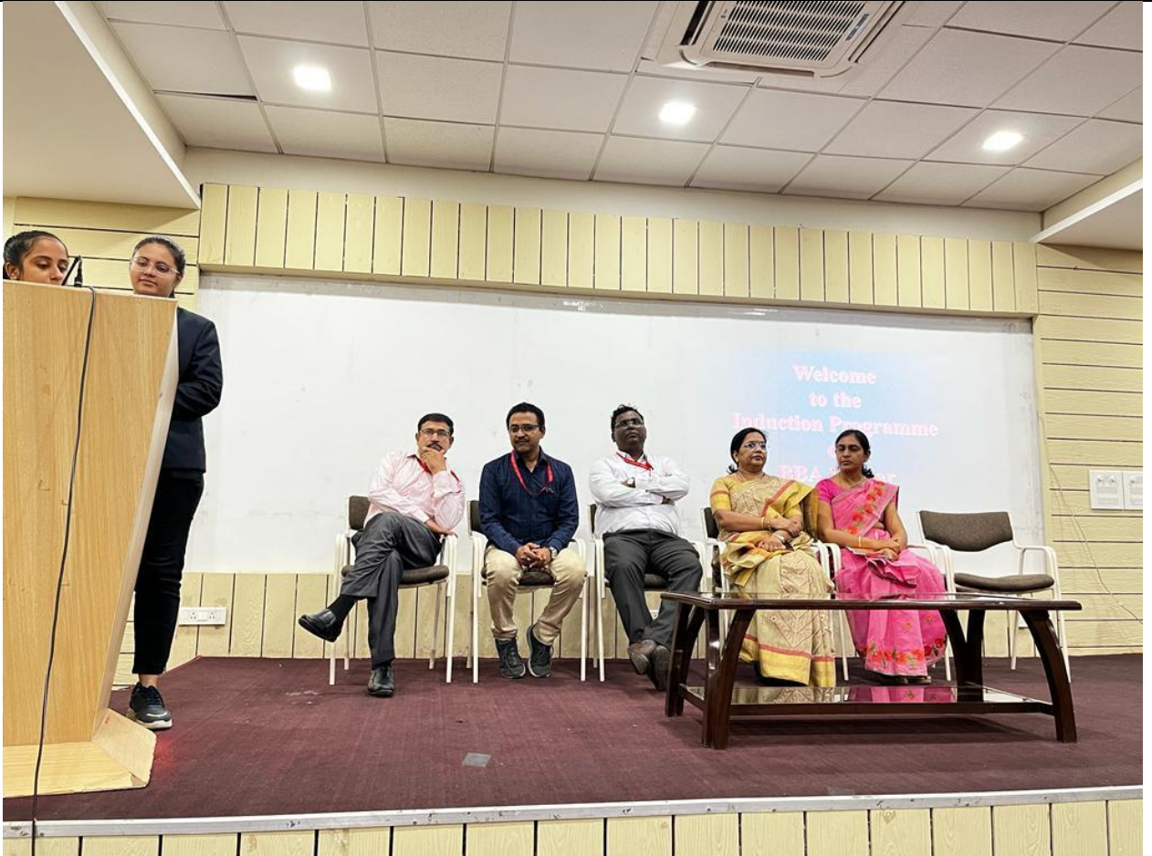
Dignitaries Invited to Department of Management for BBA Induction Program 2023-24