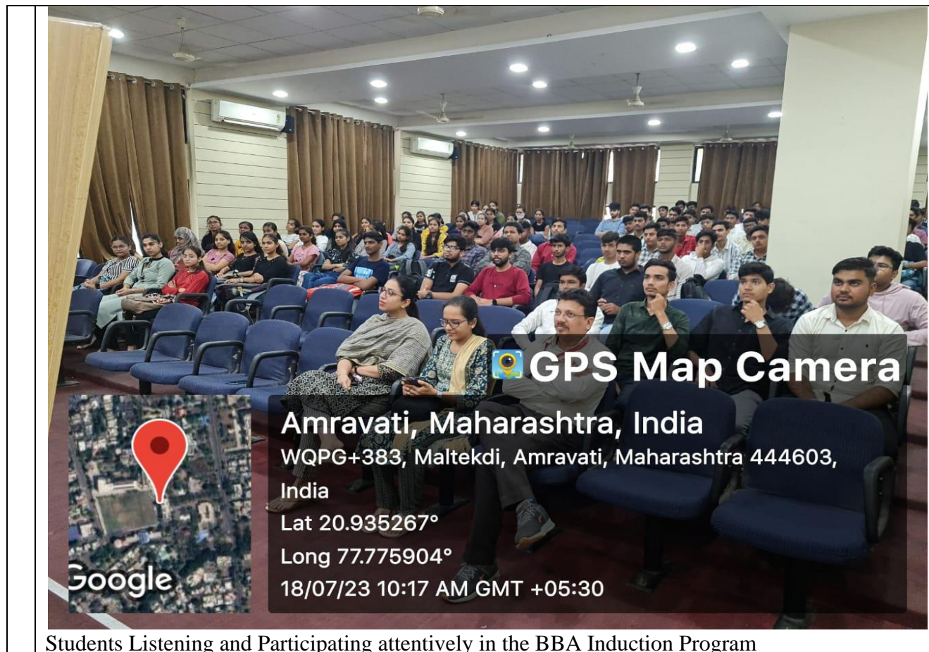
Students Listening and Participating attentively in the BBA Induction Program