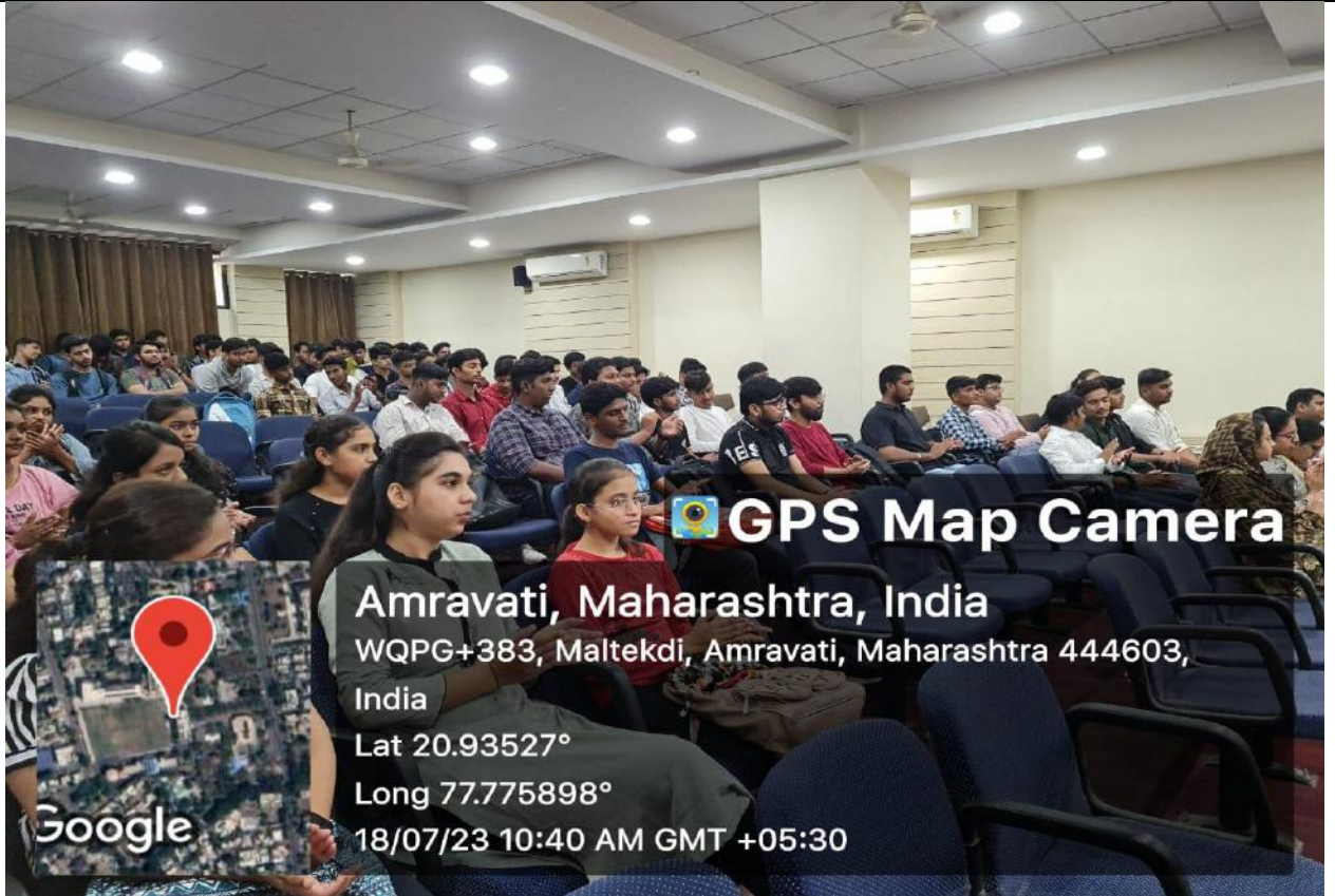
BBA 2023-24 first year new entrants listening the committee attentively during Induction Programme 2023-24