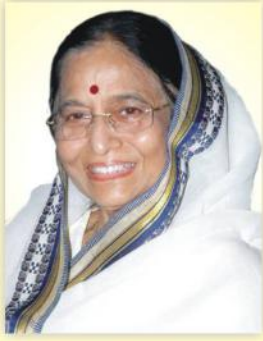
Hon'ble Smt. Pratibhatai Patil Former President of India

Former President, Vidya Bharati Shaikshanik Mandal, Amravati