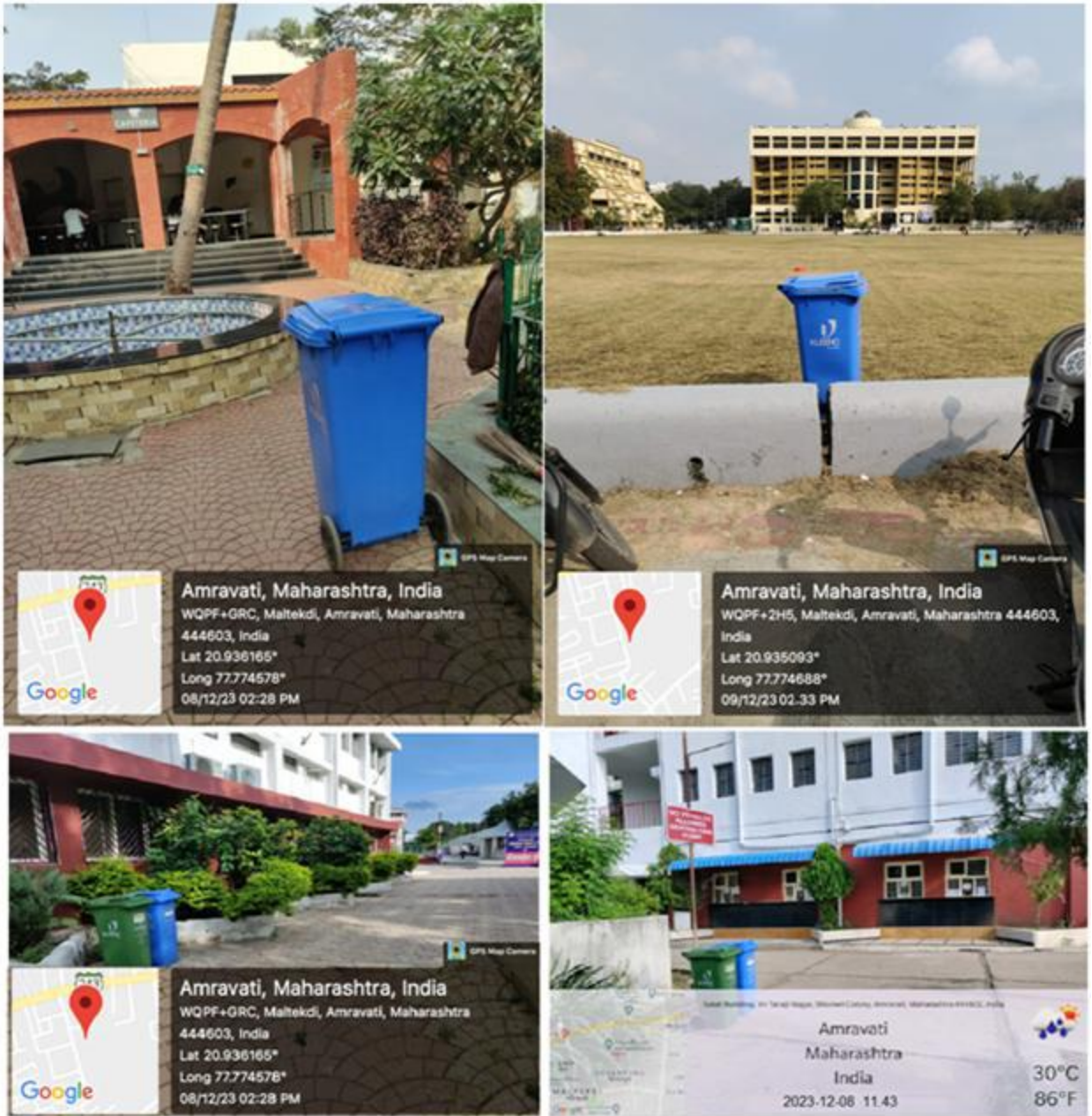
Dustbins to segregate dry and liquid waste