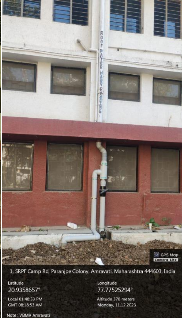
Rain water harvesting