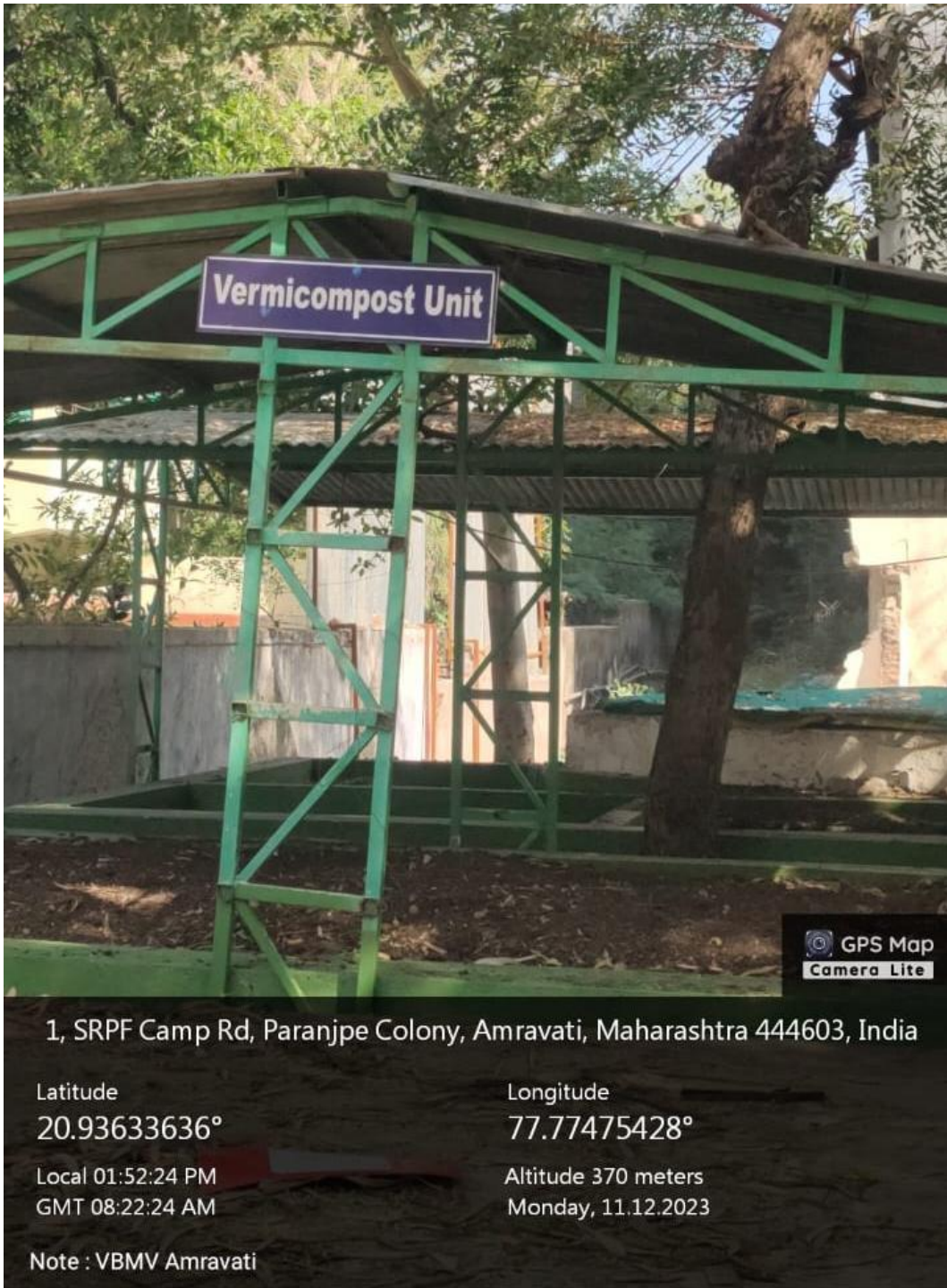
Vermi Compost Unit