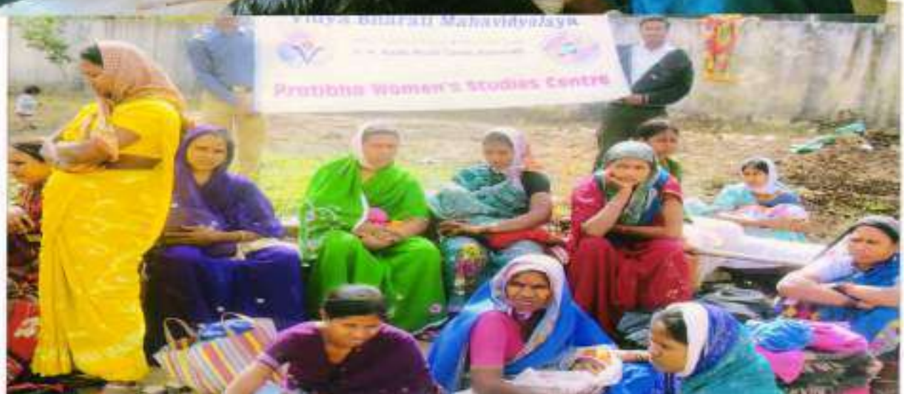
Medical Check-up camp at Salona Melghat, specially organized for Tribal women