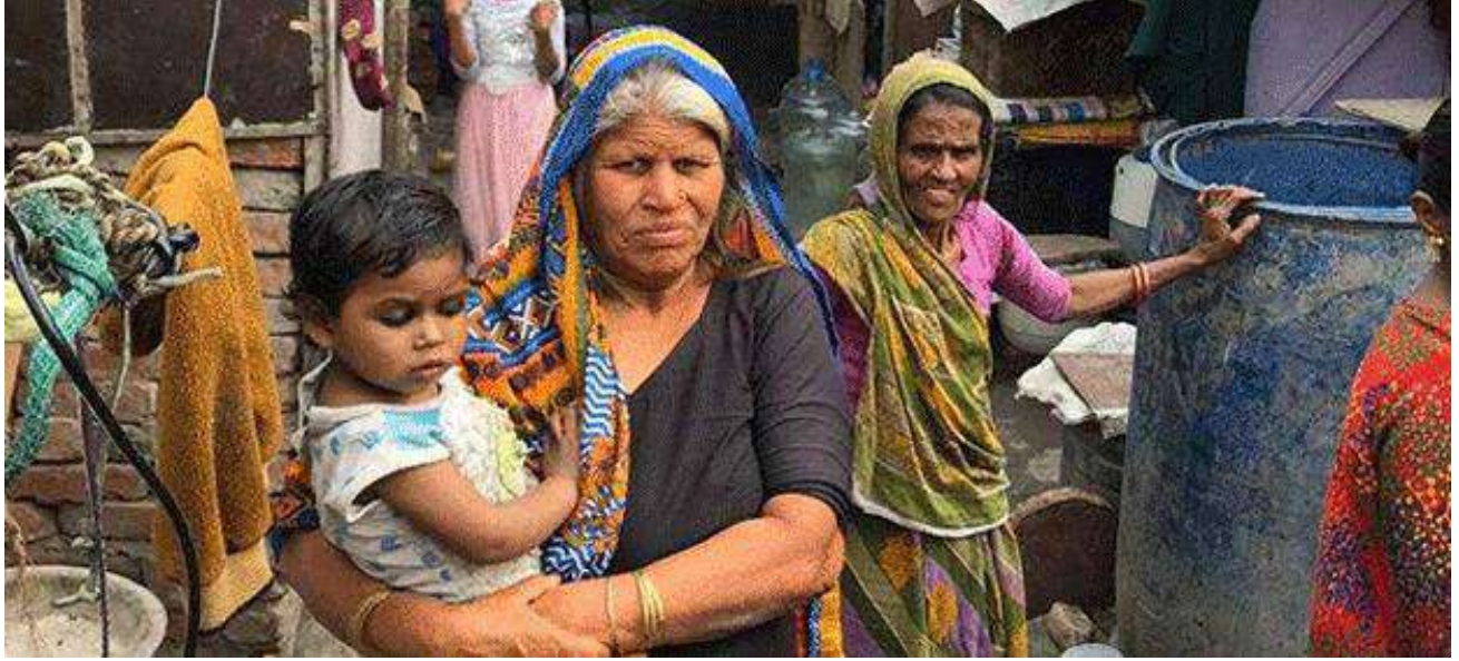
Visit to Slum area at Wadali, Amravati