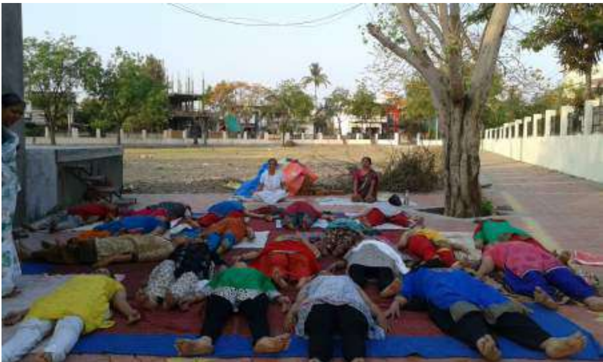
Participants at yoga camp performing different asanas