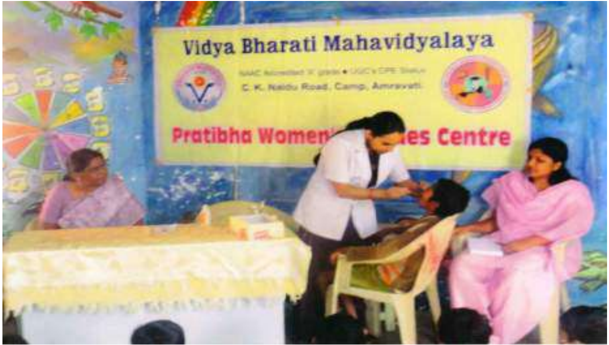
“Dental & Oral Check- up Camp” for Primary school No.14, Wadali Amravati.