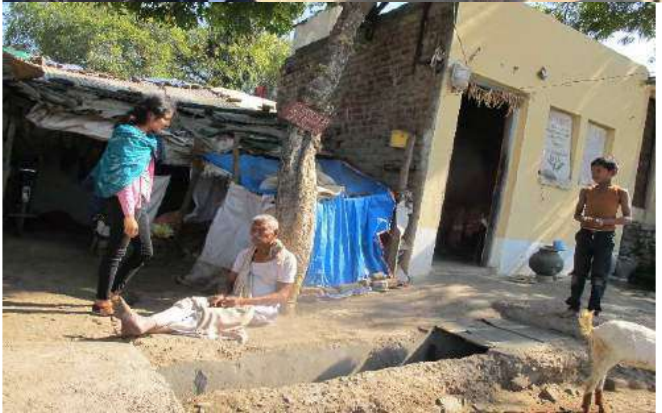
Visit to Slum area at Wadali, Amravati