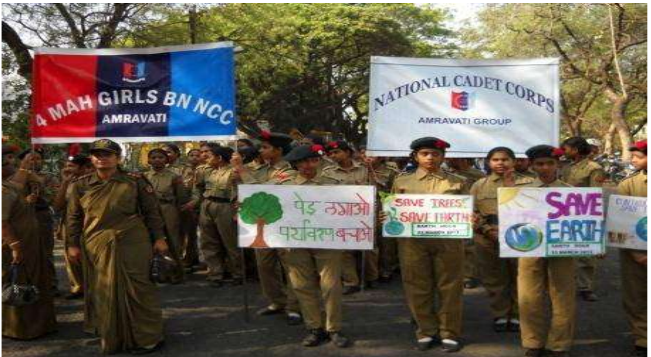
Rally on Social issues from NCC Bhavan to Irwin Square Amravati