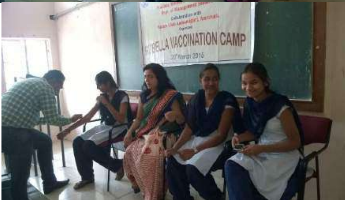
Vaccination being done on Two Days Medical Check-up Camp