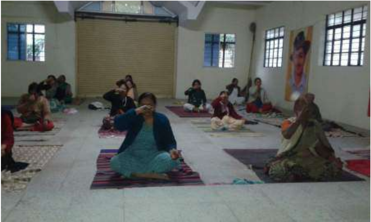
Participants doing Yoga Sadhana by performing Anulom-Vilom Pranayam