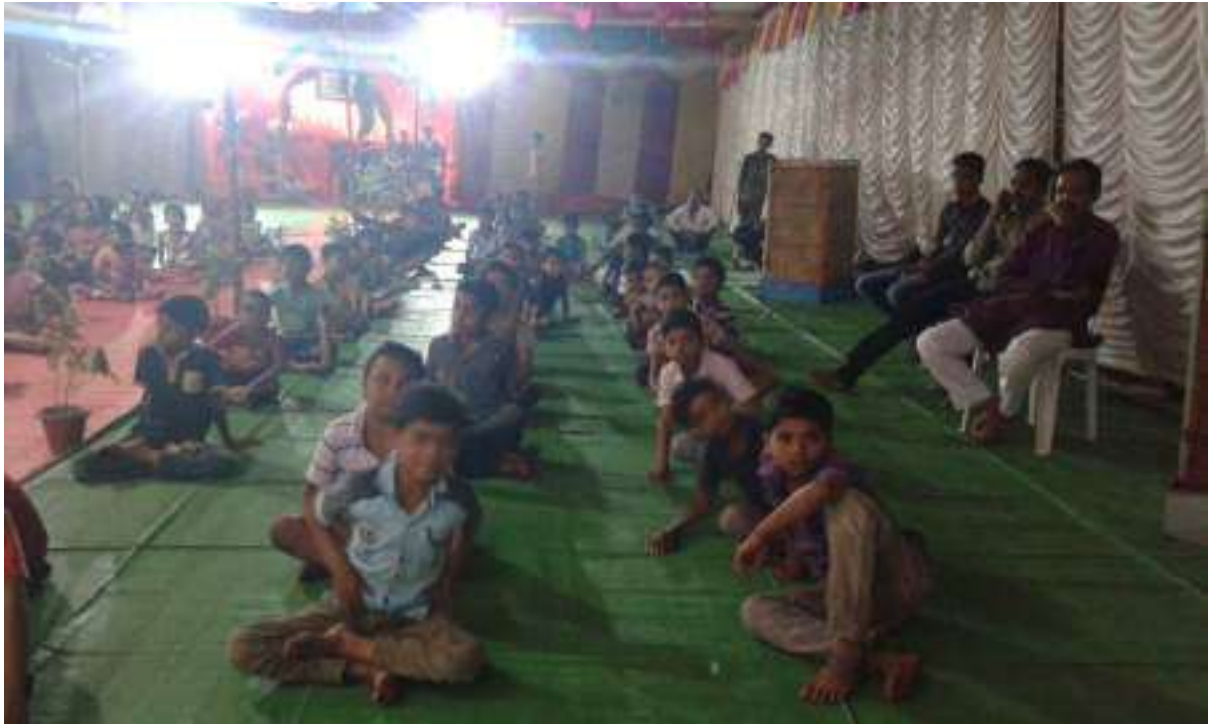
Students practicing yoga at Sawarkhed