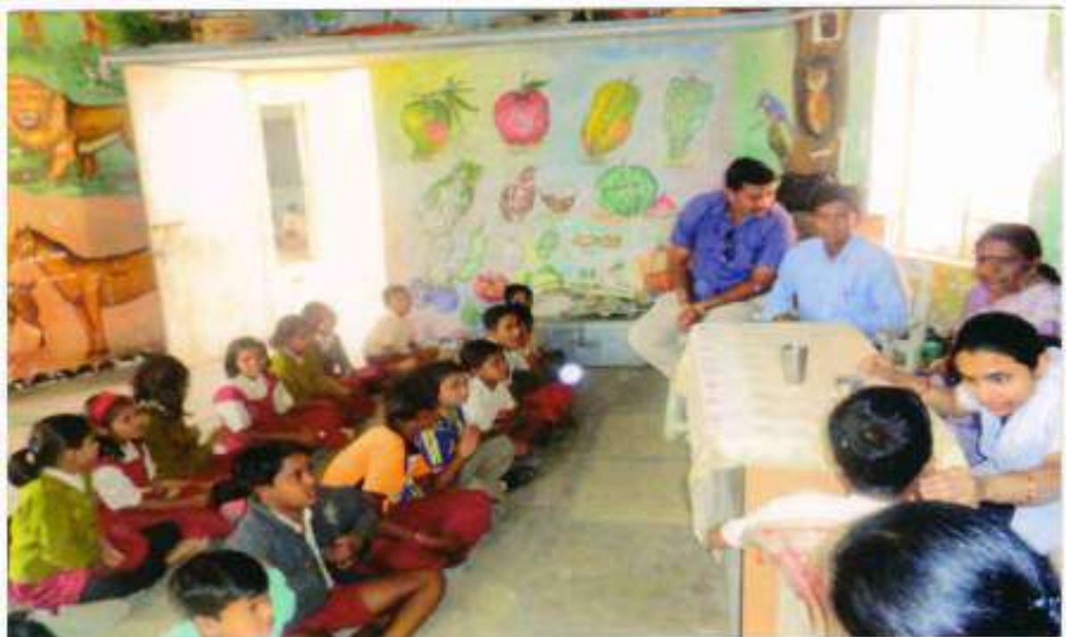
“Dental & Oral Check- up Camp” for Primary school No.14, Wadali Amravati