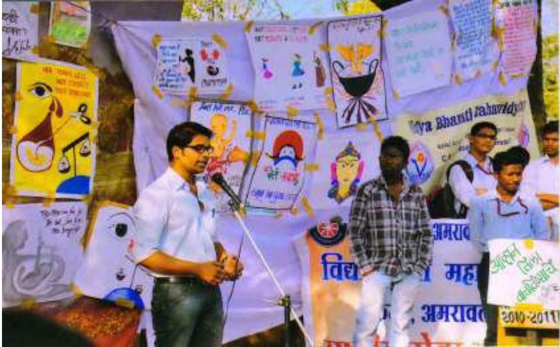
Students expressing their views through Poster Exhibition on Lokjagar against Female Feticide