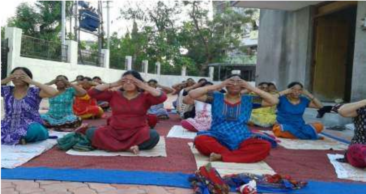
Participants at Yoga Camp performing different asanas