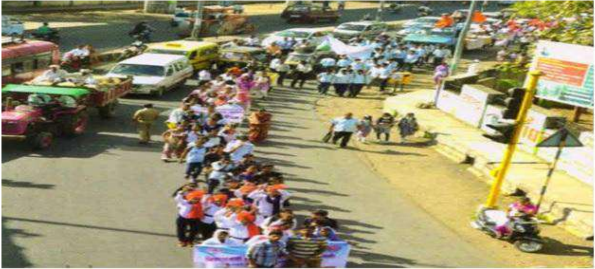
AIDS Awareness Rally organized by N.S.S.