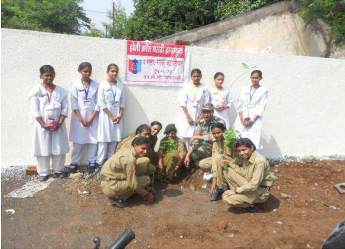
Tree Plantation by Cadets