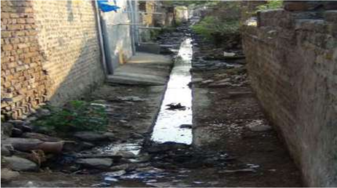
Blocked up Service Lane, Slum Area, Amravati being surveyed