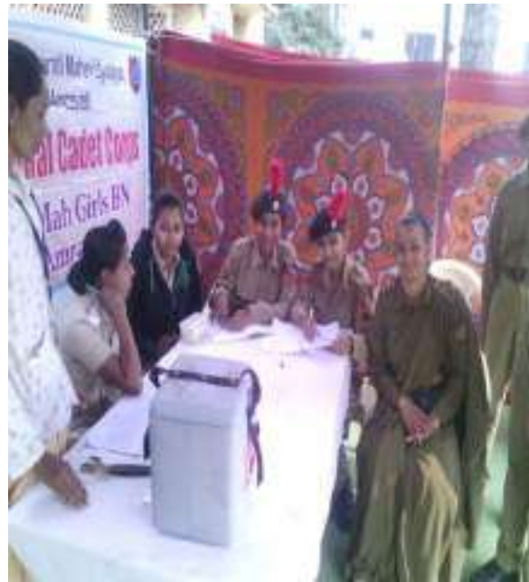
Cadets are helping hospital staff in Pulse Polio Campaign at Police Head Quarter, Amravati