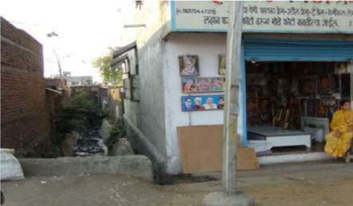
Blocked up Service Lane, Slum Area, Amravati being surveyed