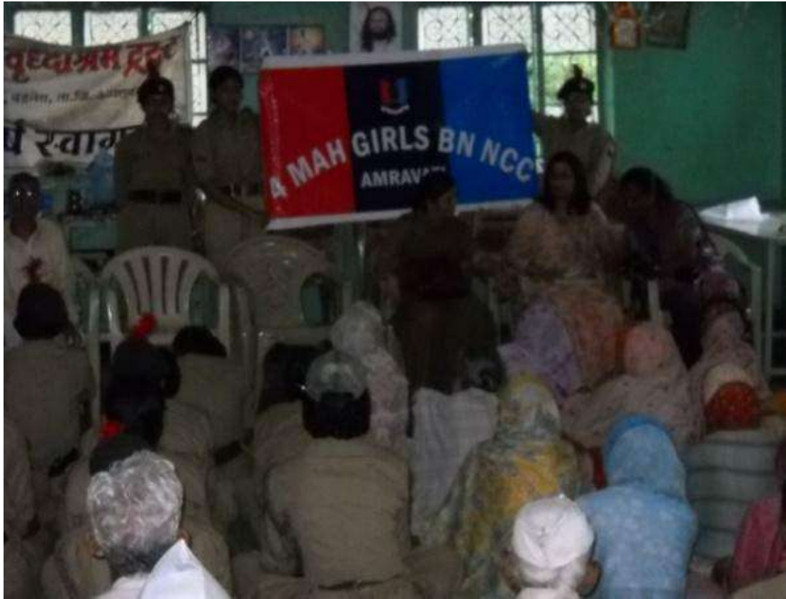
Interaction with old Age People