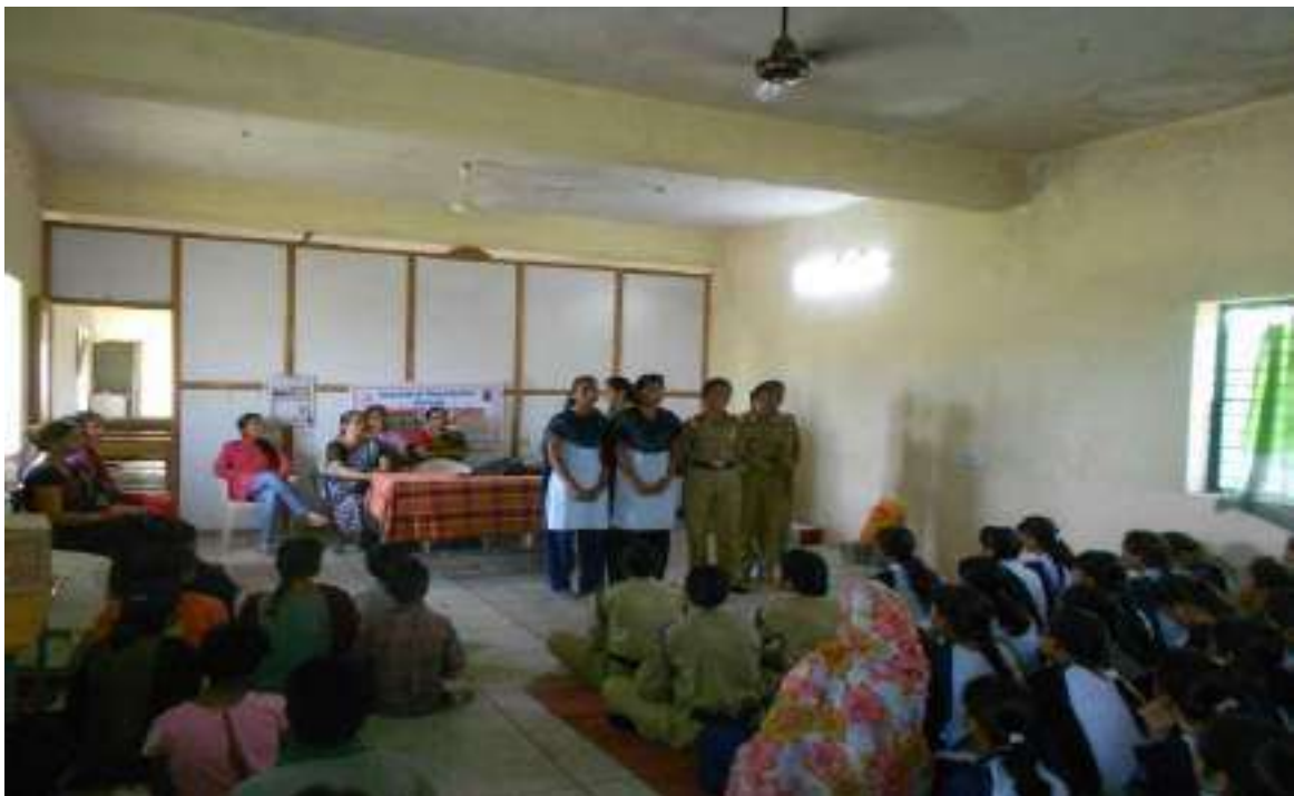
Students entertaining the elders at old-age home