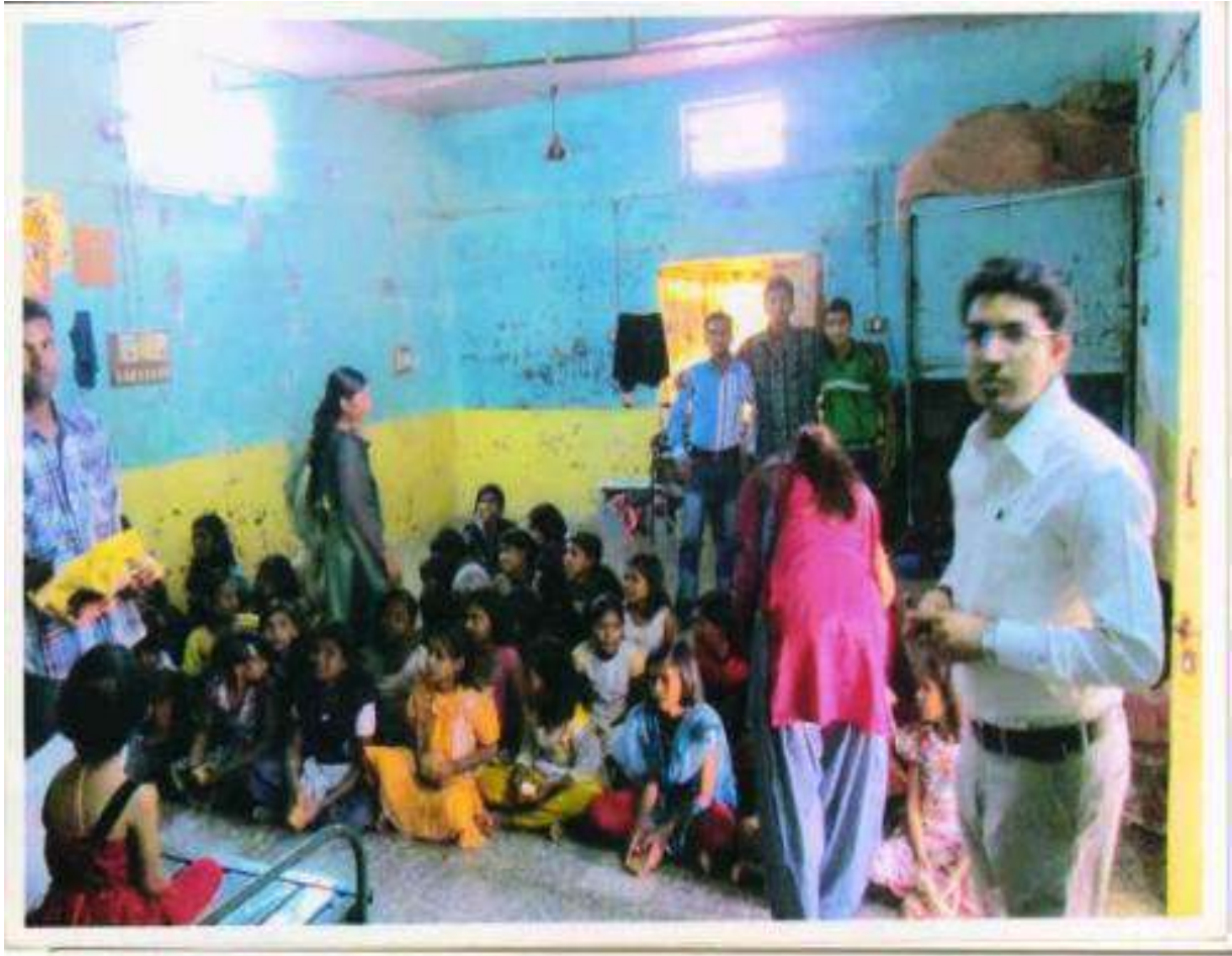
NSS Volunteers Distributing things of Daily Needs