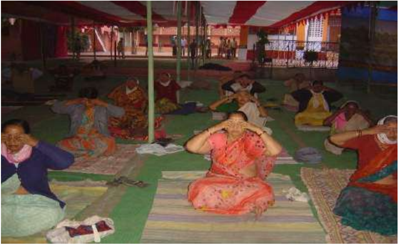
Yoga Sadhak performing Bramari Pranayama.