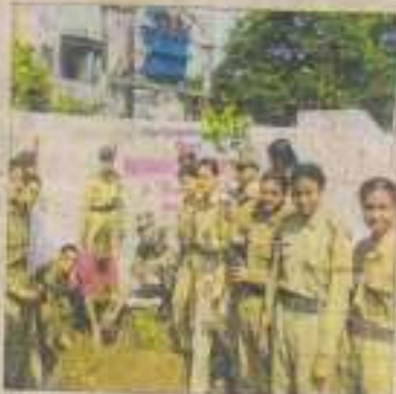
NCC cadets and guest planting saplings.

A tree-planting drive taken out by the cadets in which they raised slogans and high-banners promoting environment awareness.