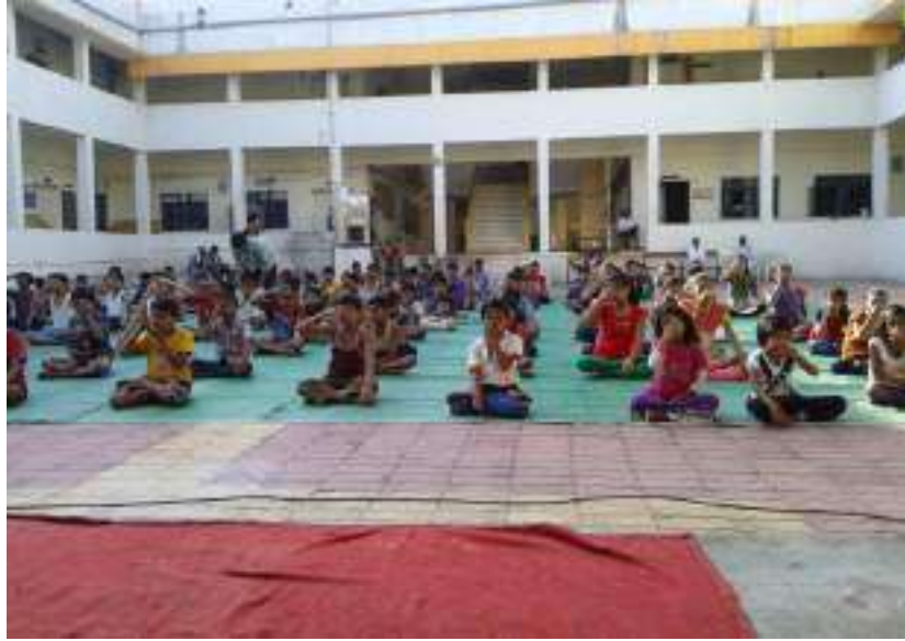
Yog Sadhak doing Anulom-Vilom