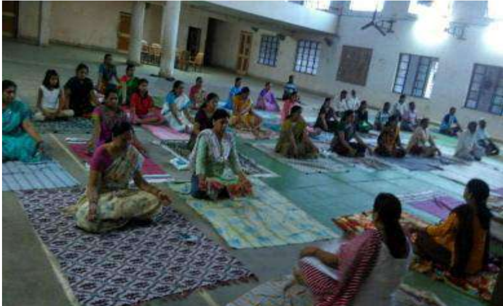
One Day Yoga Camp at Sawarkhed, Dist. Amravati

Caption : One Day Yoga Camp at Sawarkhed, Dist. Amravati Venue : Hanuman Mandir, Sawarkhed Date : 18/04/2016 Collaborating agency : Hanuman Mandir, Sawarkhed Total No. of students participated : 100