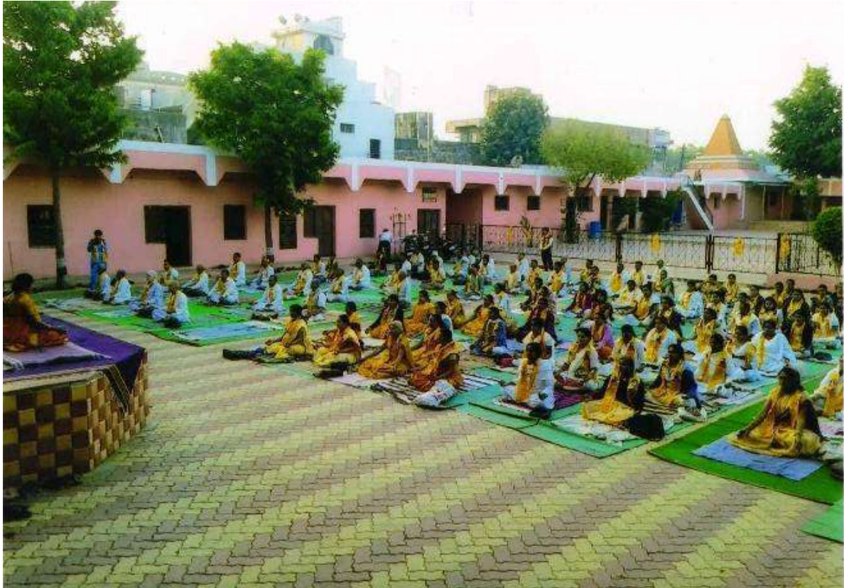
Students performing sarvangasana and Dr.V.V.Parhate demonstrating asnas