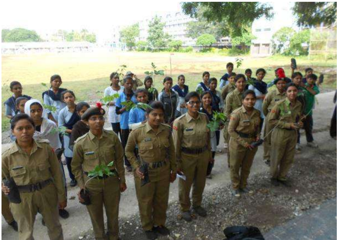
Cadets Along With Saplings