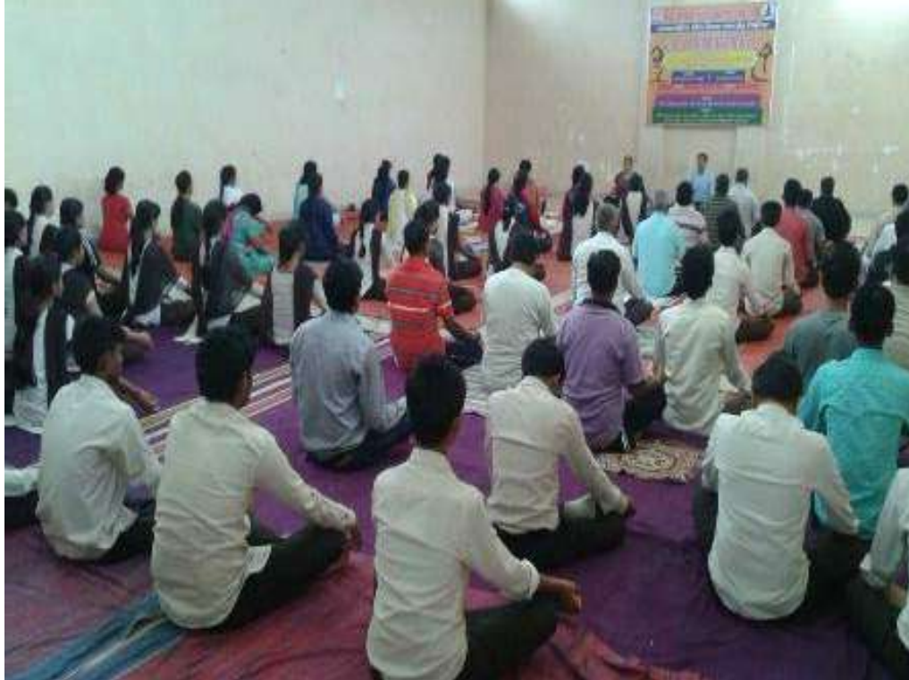
Students and staff performing Yoga on 1 st International Yoga Day 21 st June, 2015