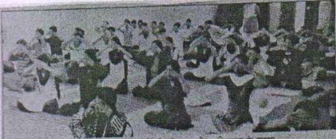
अमरावती : योग साधना में लोन विद्याभारती महाविद्यालय के सदस्य