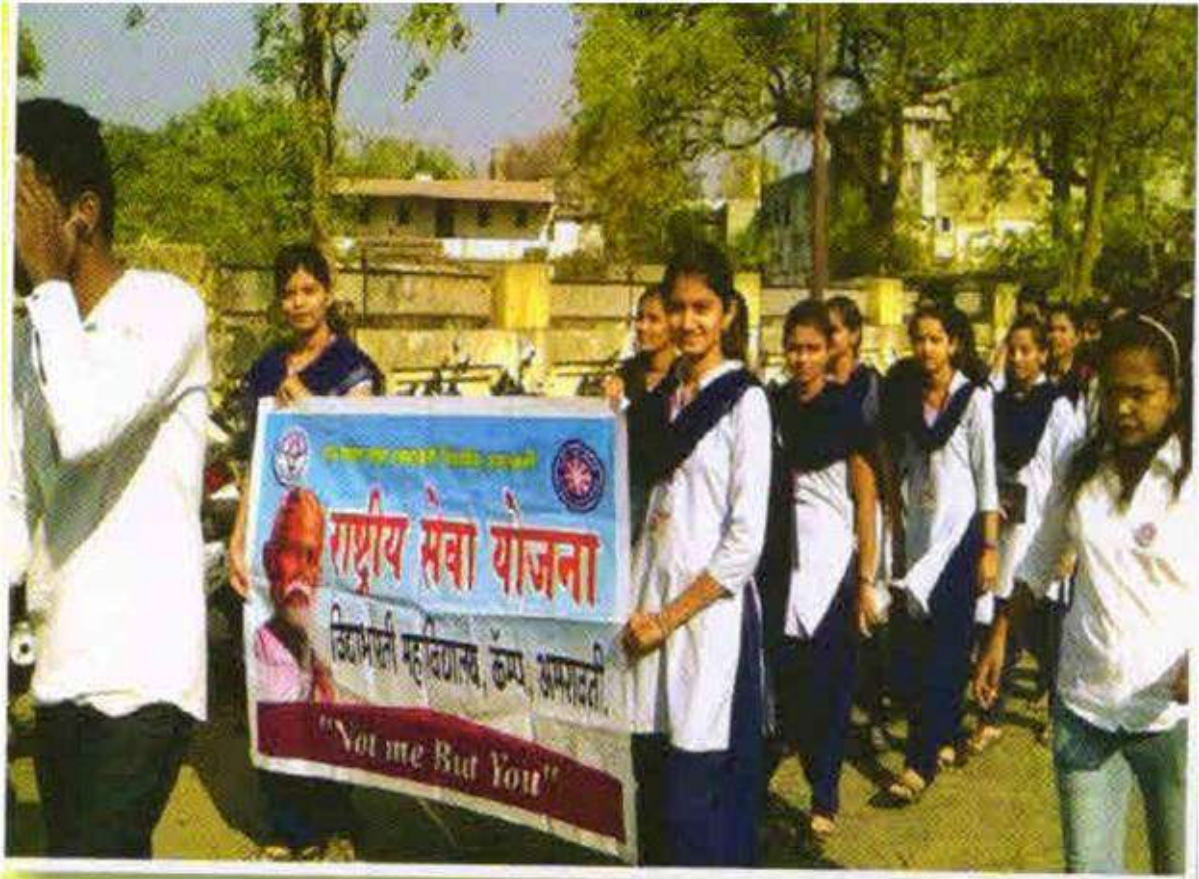
N.S.S. Volunteers Participated in HIV/ AIDS Awareness Rally