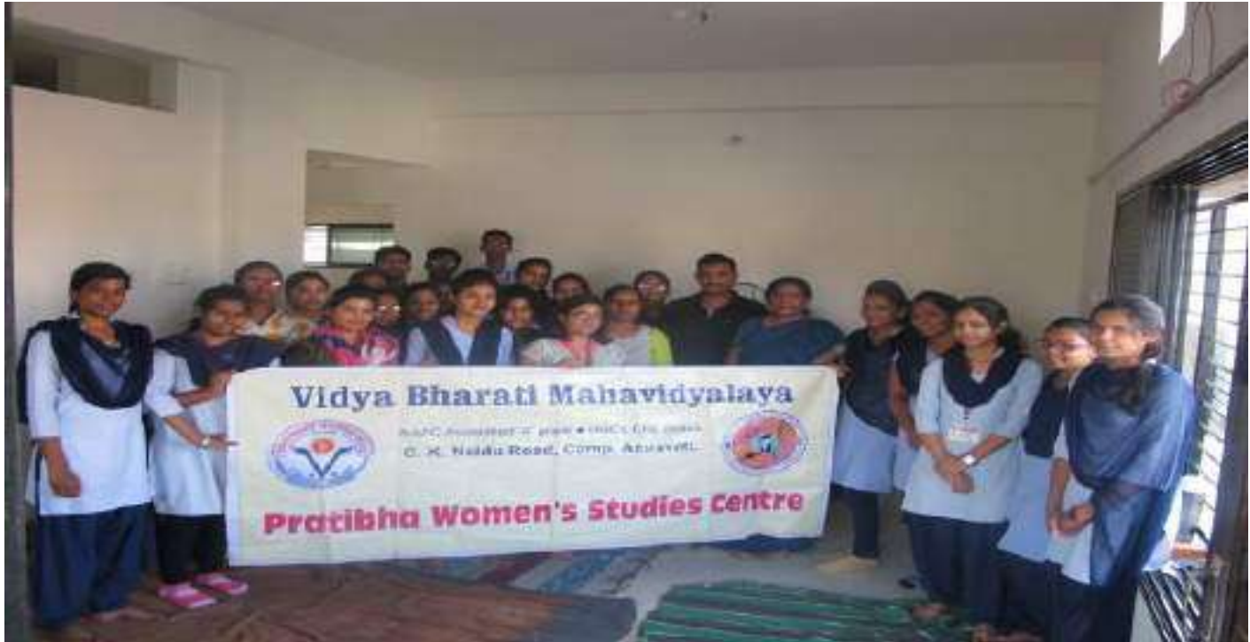
Students posing for a group photo during Awareness program on Human Rights