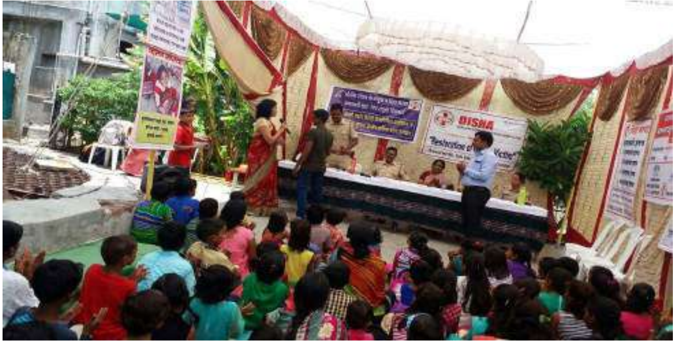
Glimpses of School Kit Distribution program