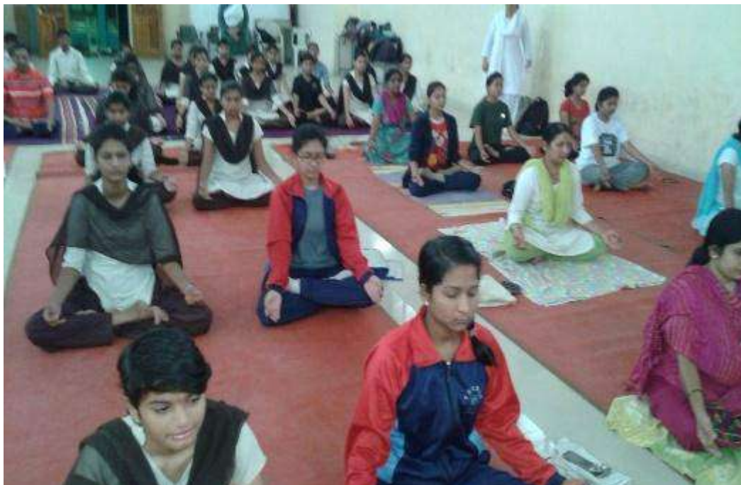
Students and staff performing Yoga on 1 st International Yoga Day 21 st June, 2015