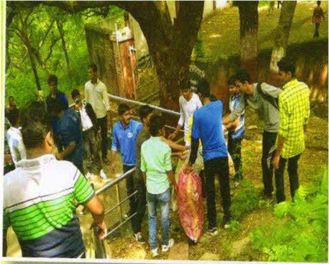
Cleanliness Drive at Shiv Tekadi, Amravati