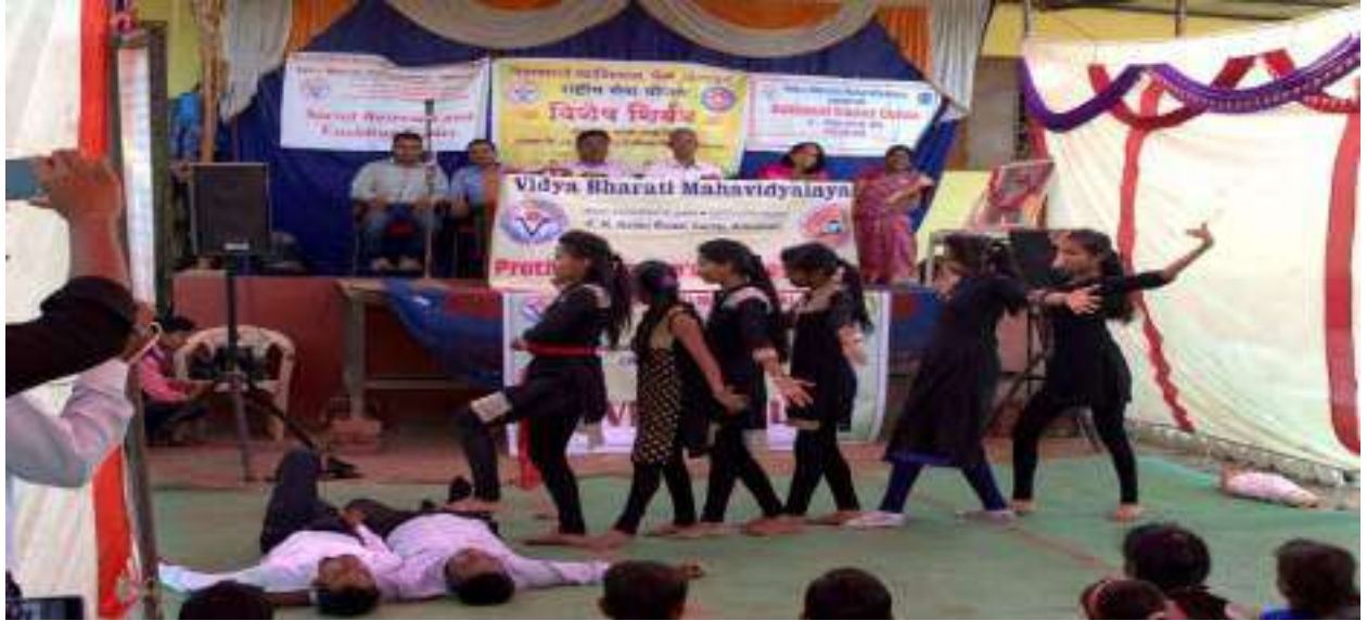
Students performing One Act Play at village Karala