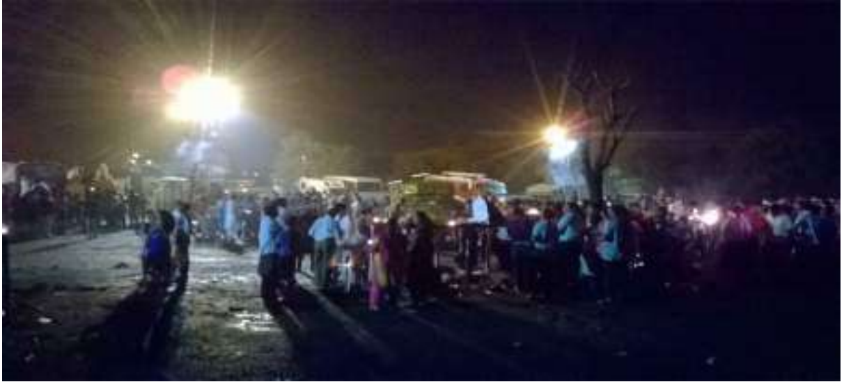
NSS Volunteers Collecting Garbage during Ganpati Visarjan at Chhatri Talao, Amravati