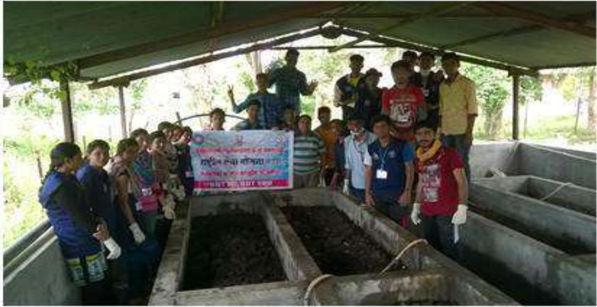
N.S. S. Volunteers visited to the Project on ‘Nirmalya Separation and Compost Formation’