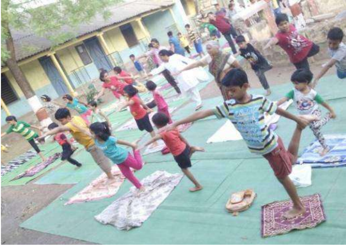
BalsanskarShibir at ZilhaParishad School,Radha Nagar,Amaravati.