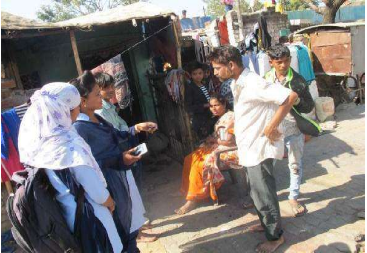
Slum Area Survey at Frezarpura, Amravati