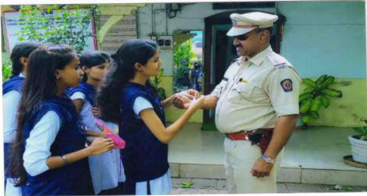
Celebration of Rakhabandhan of NSS Volunteers with Amravati Police Staff and Officers