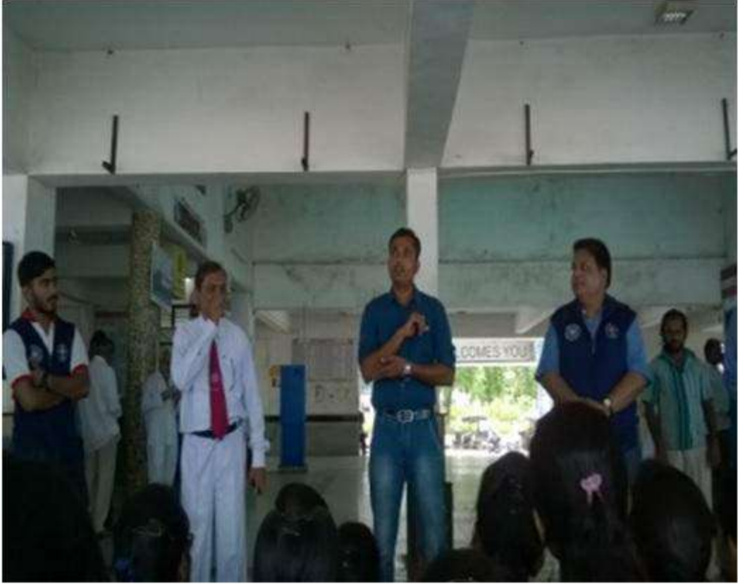
New Model Rly. Station Master delivering Speech on Swachta Hi Sewa Awareness Programme