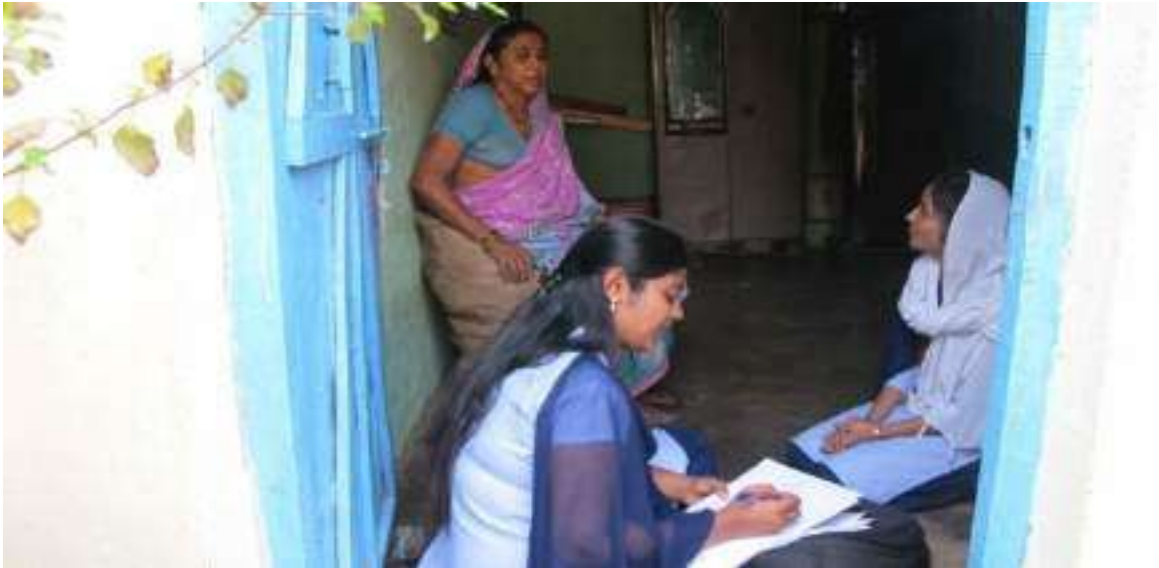
Students interacting with villagers during household survey at Karla Village