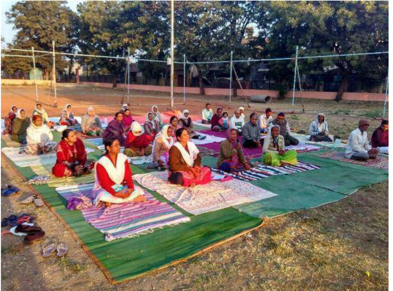
Participants practicing Yoga at Sahayog Prashikshan Shibir at Sahajanand Nagar, Arjun Nagar, Amravati