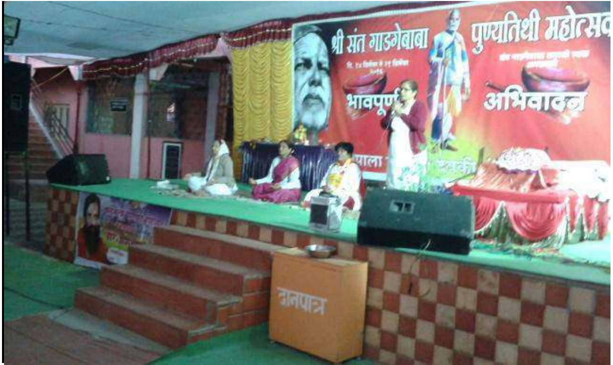
Yogic Exercise being practiced at Gadge baba Samadhi Mandir, Gadge Nagar, Amravati