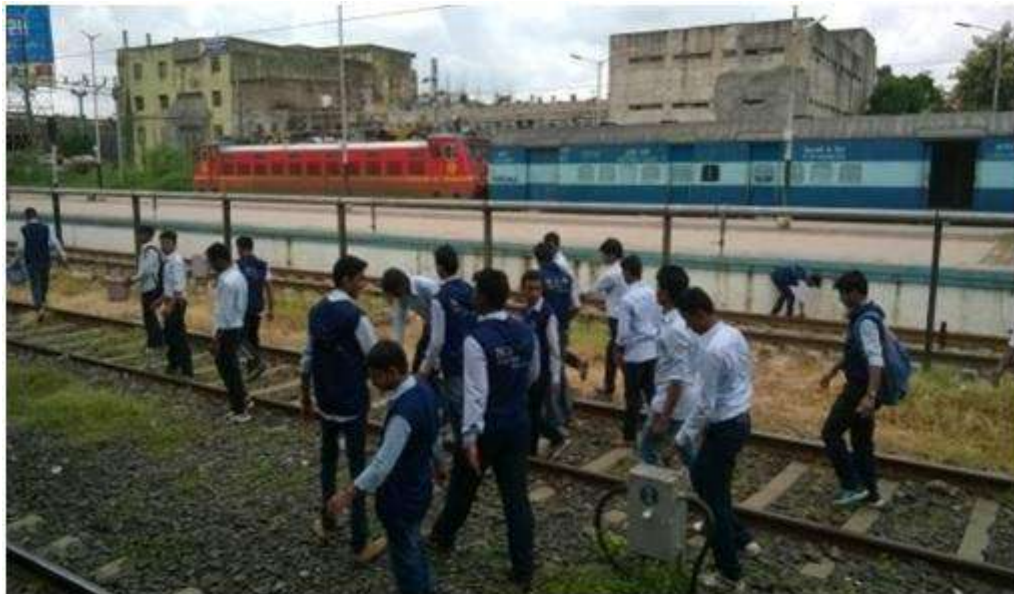
N.S.S. Volunteers addressed the gathering about the Cleanliness Drive at Model Rly. Station Amravati