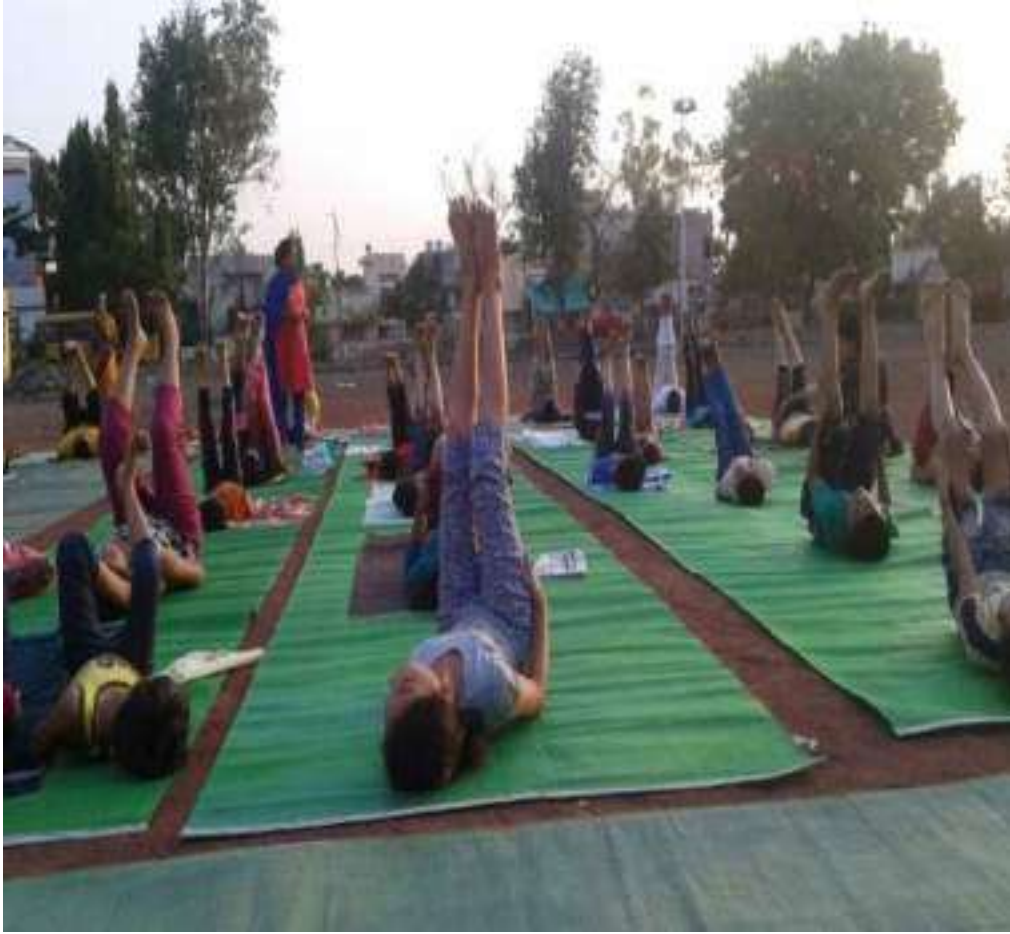
Yoga Participants doing Yoga