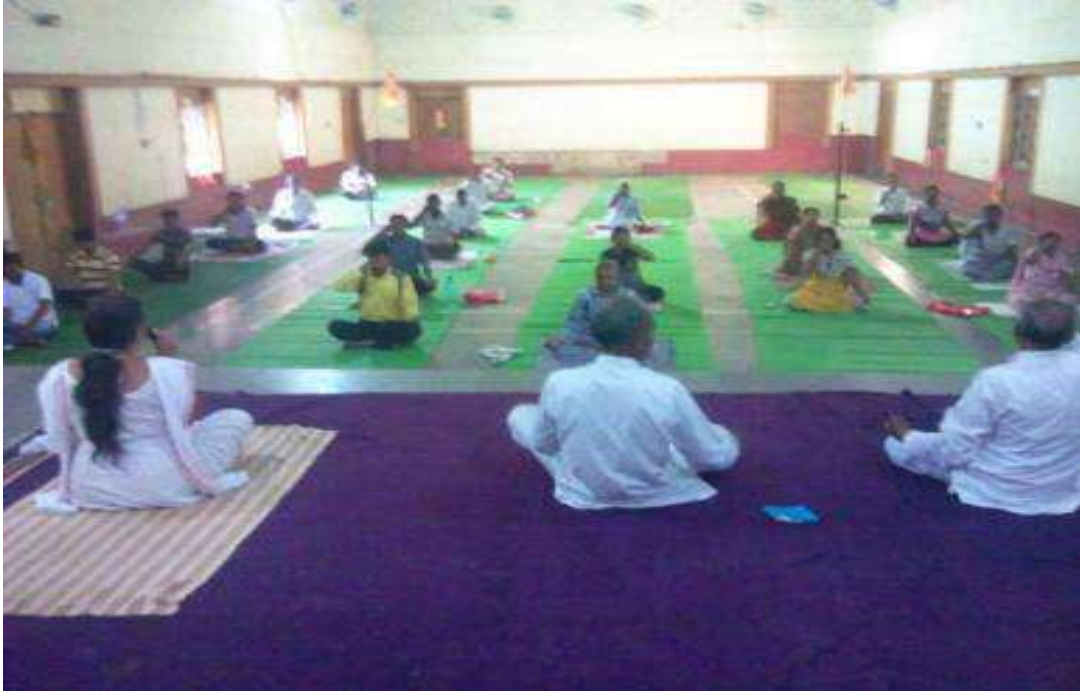
Yoga Camp organized at Upper Wardha Colony, Amravati