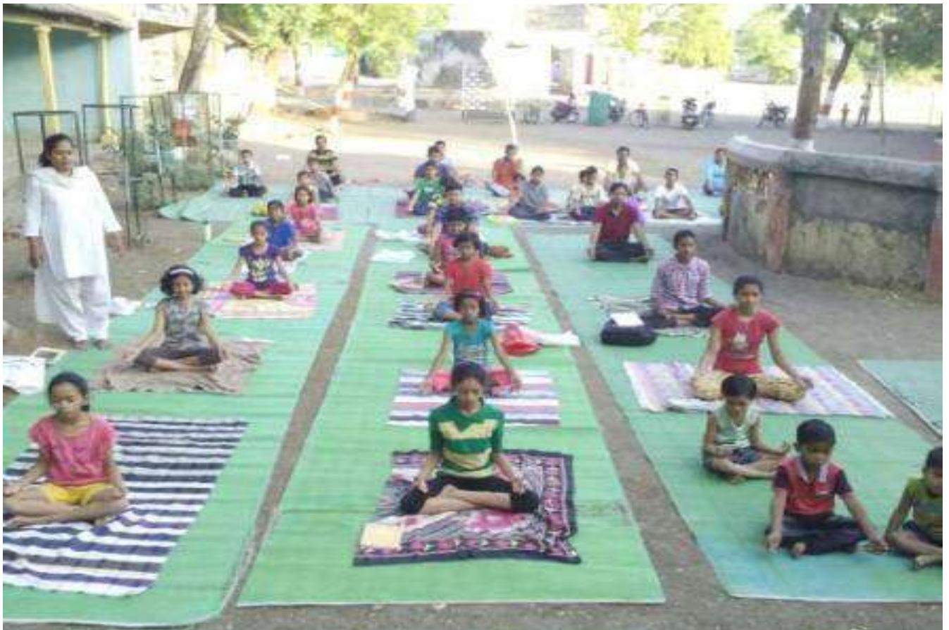
BalsanskarShibir at ZilhaParishad School,Radha Nagar,Amaravati.