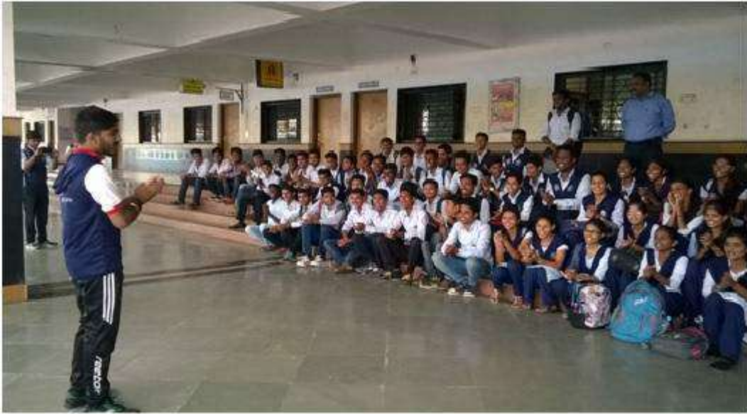
NSS Volunteers participated in Cleanliness Drive at New Model Railway, Amravati on 27/08/2016