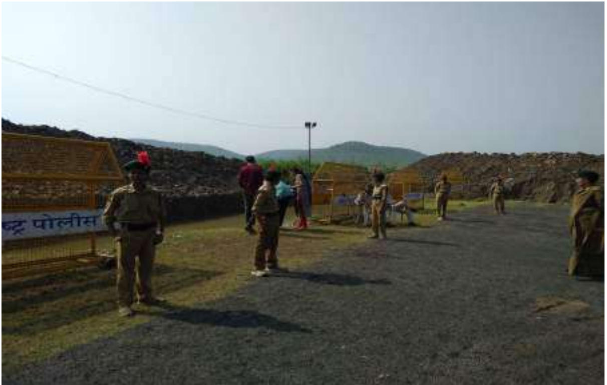
NSS Volunteers Collecting Garbage during Ganpati Visarjan at Chhatri Talao, Amravati