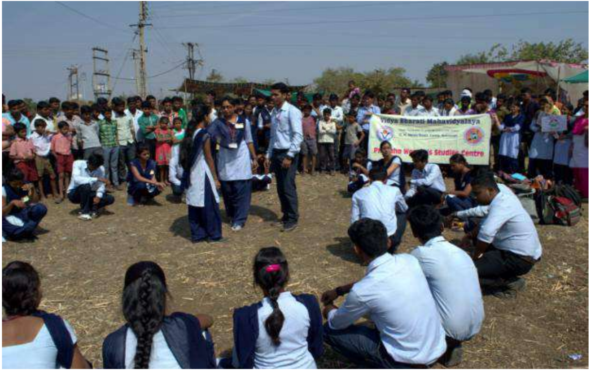
Performance of a Street Play on “ Gender Equality ” at adopted village Karala, Dt Amravati