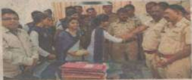
सर्वसामान्यांच्या रक्षणासाठी सदैव कार्यरत पोलिसांना राष्ट्रीय बांधल्या विद्यार्थिनींनी. या वेळी उपपुस्तक गोरखपूर उपक्रम हेसुद्धा उपस्थित होते.