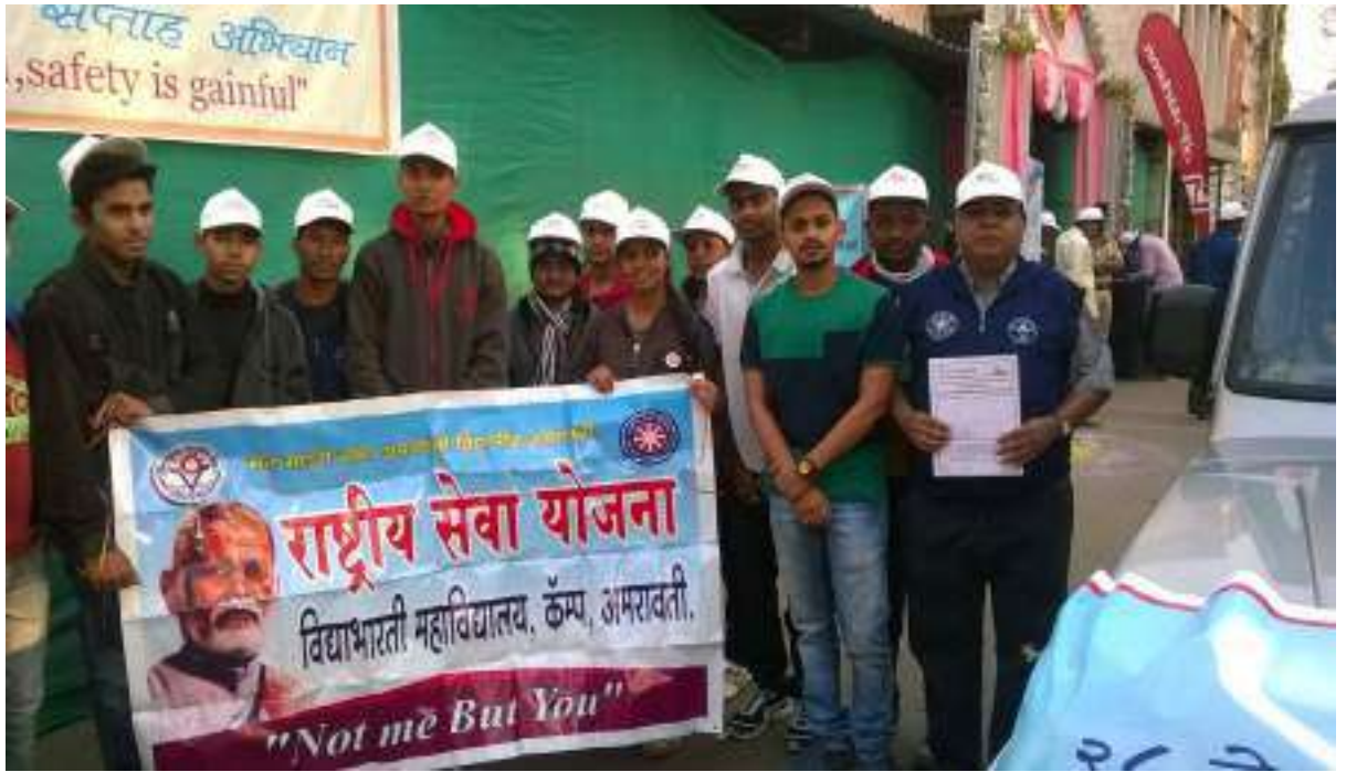
N.S.S. Volunteers Participated in programme to mark Road Safety Week