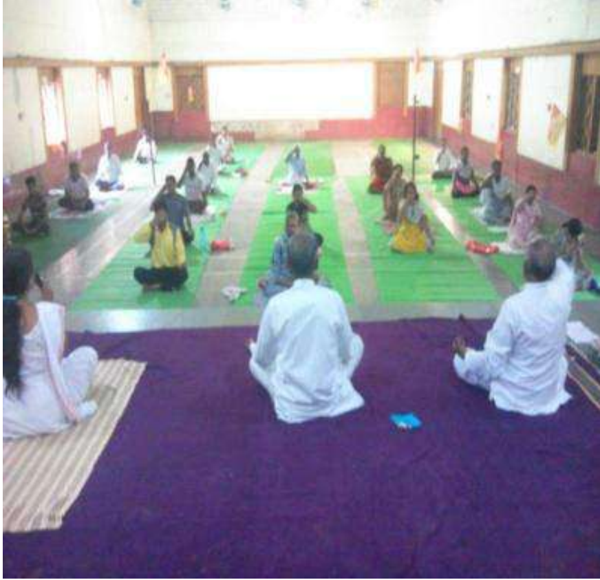
Sahyog Prashikshan Shibir