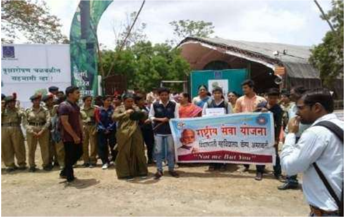
Tree Plantation program at Panchavati square