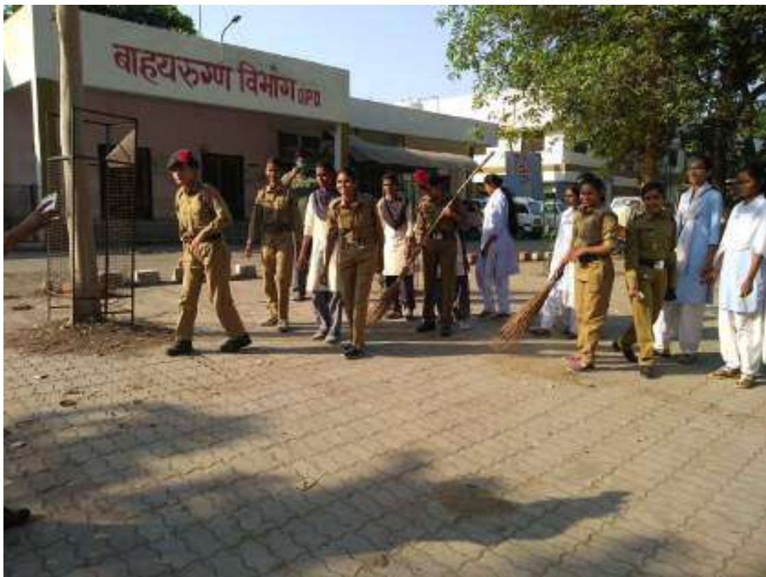
Cleanliness Drive at Irvin Hospital, Amravati