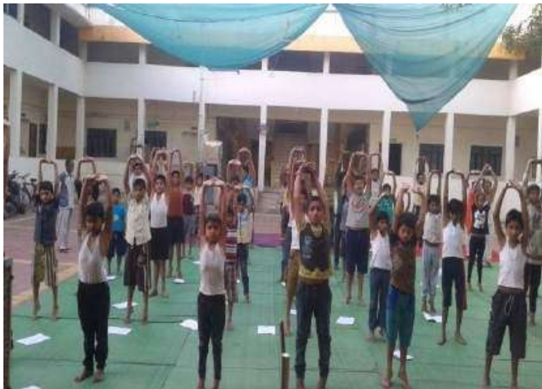
Bal-Sanskar Shibir at Law College, Amravati