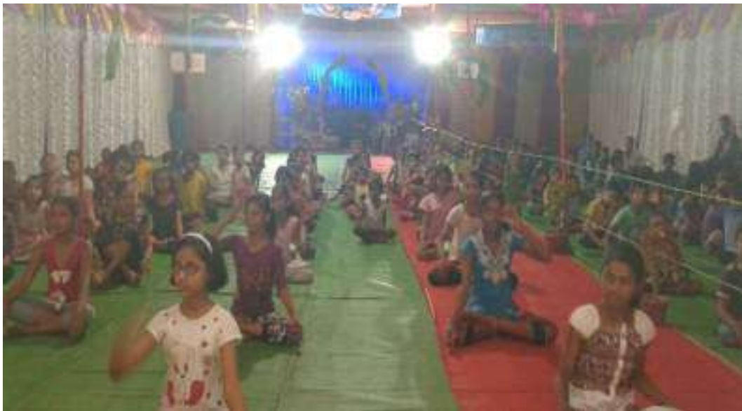
Yoga Class at Hanuman Mandir, Sawarkhed