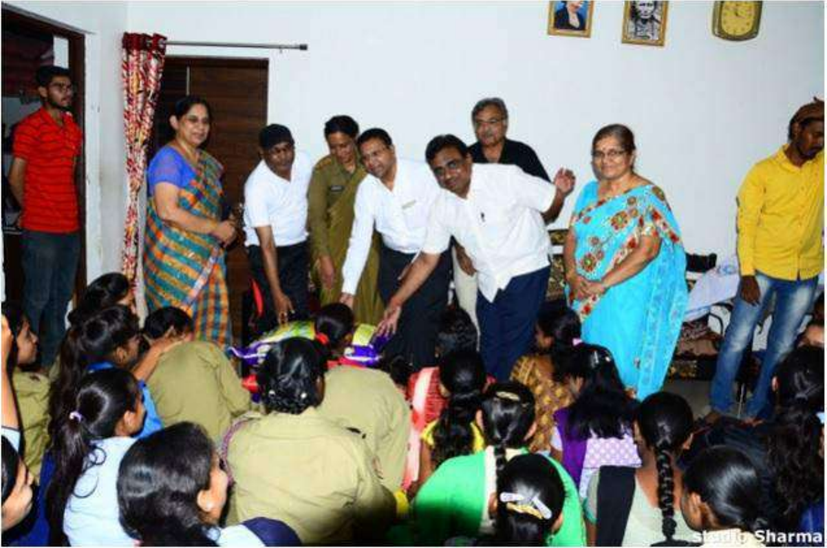
NGO Visit at Raghoba Dada Patil Andha Vidyalaya Amravati