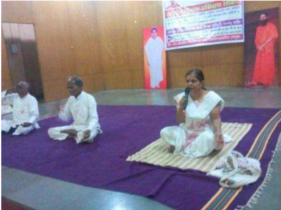
Sahyog Prashikshan Shibir