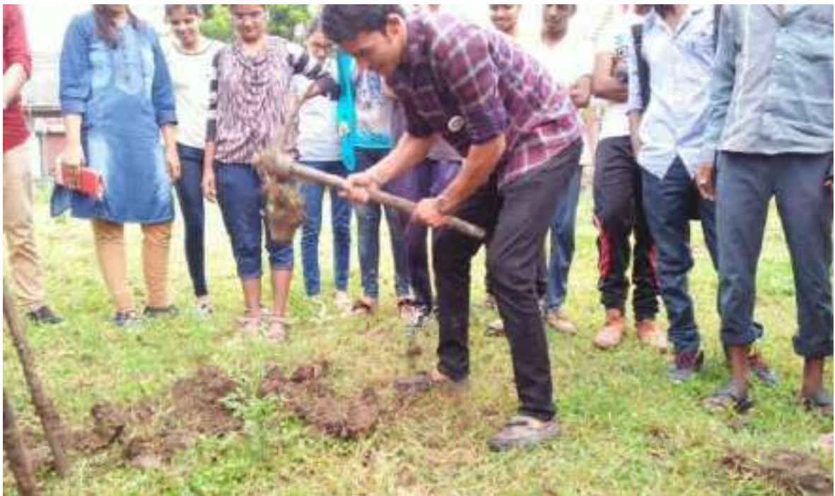
Tree plantation Drive at Kewal Colony, Amravati