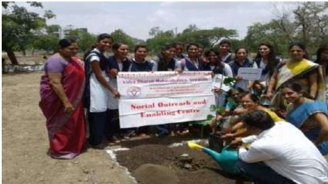
Tree Plantation program at Panchavati square