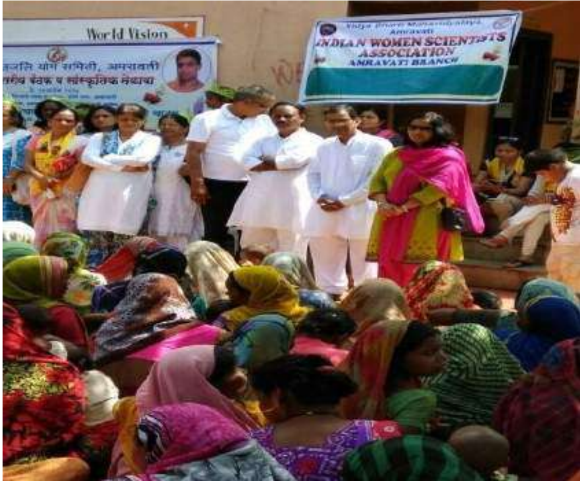
Distribution of clothes and study charts to students and villagers of Khatkali