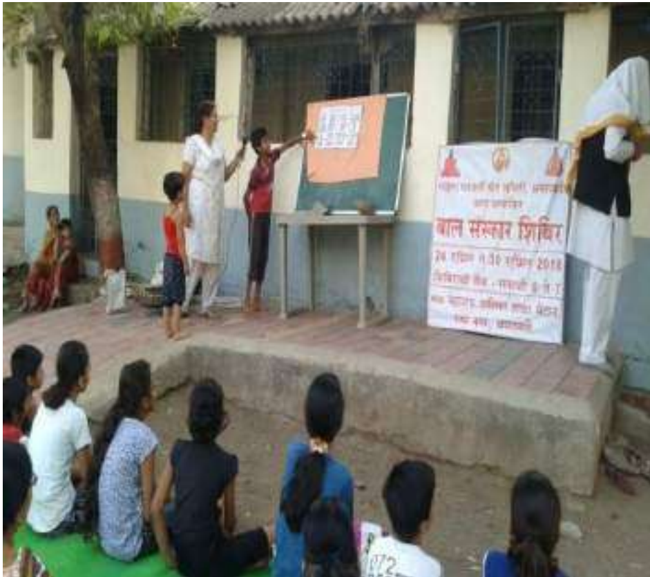
Bal-Sanskar Shibir at Z. P. School, Radhanagar, Amravati