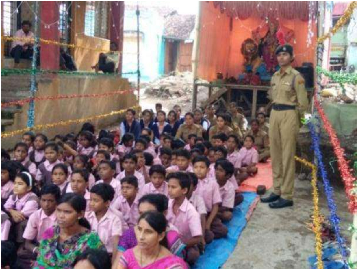
Students participation in the campaign