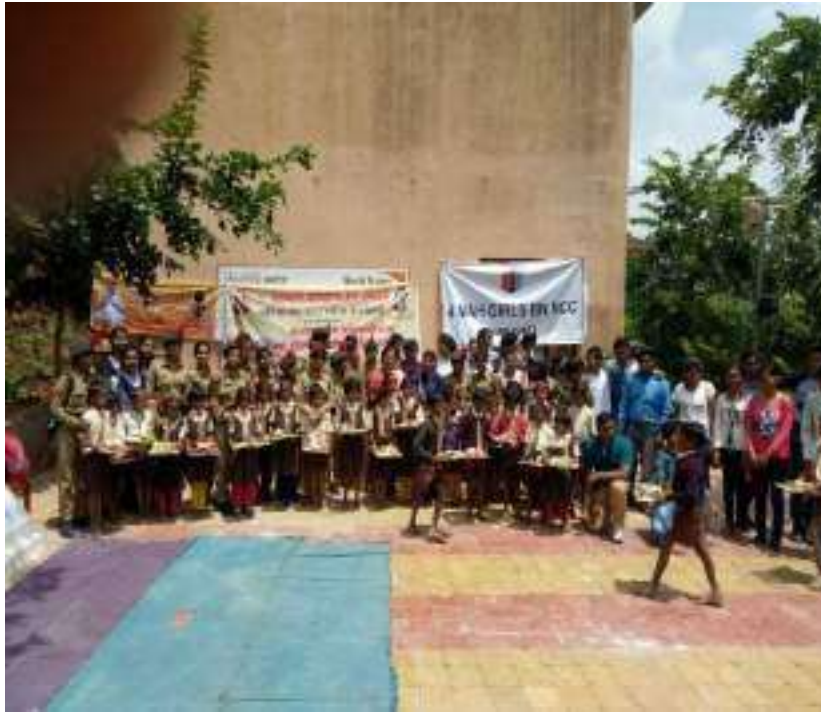
Distribution of study material and clothes to students and villagers of Khatkali