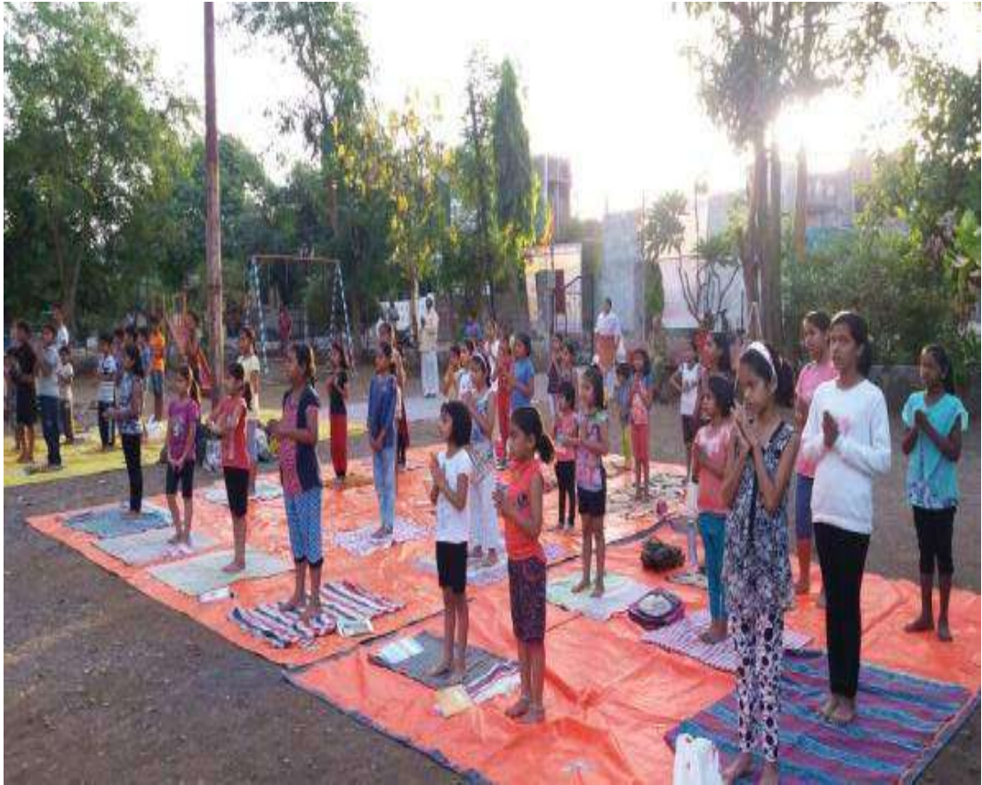
Students doing Vivekasana