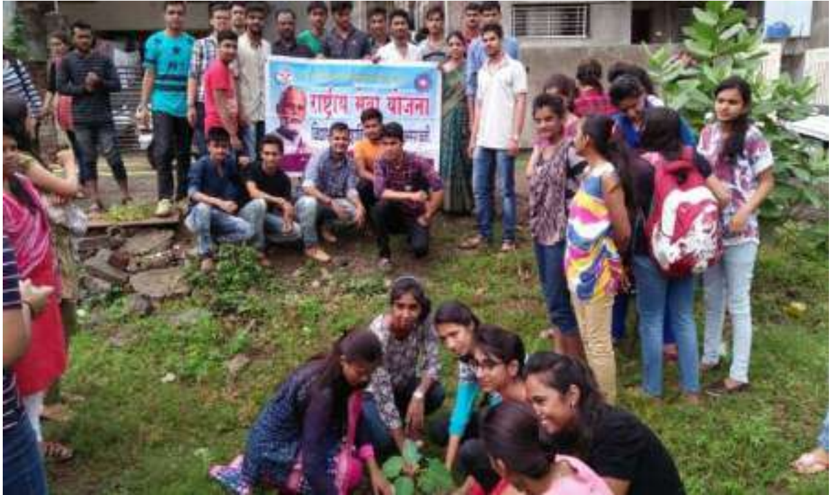
Tree plantation Drive at Kewal Colony, Amravati