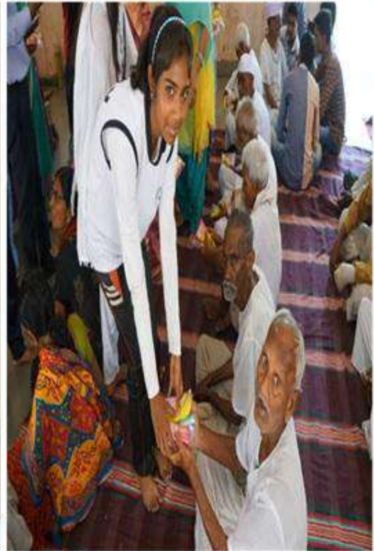
NGO visit at Shri Gadage Maharaj Paramdham Vrudhhashram, Walgaon.