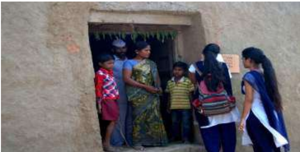
Slum Survey at Adarsha Nehru Nagar, Amravati

Caption : Slum Survey at Adarsha Nehru Nagar, Amravati Venue : Adarsha Nehru Nagar, Amravati Date : 29/07/2017 Collaborating agency : SOEC Total No. of students participated : 47