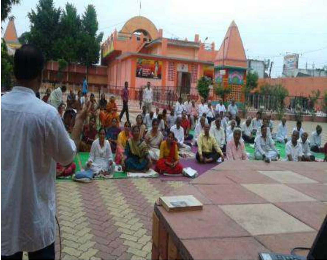
Participants listening to speaker at Heart fullness Meditation Camp