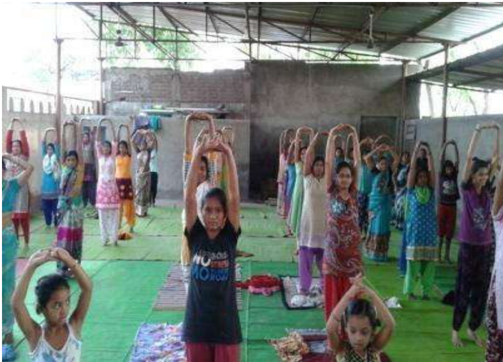
Yog Sadhak performing Yoga