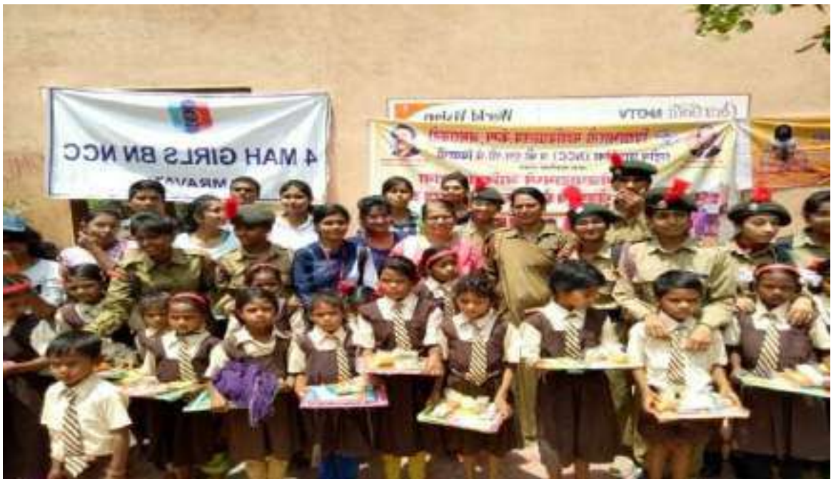
Distribution of study material and clothes to students and villagers of Khatkali