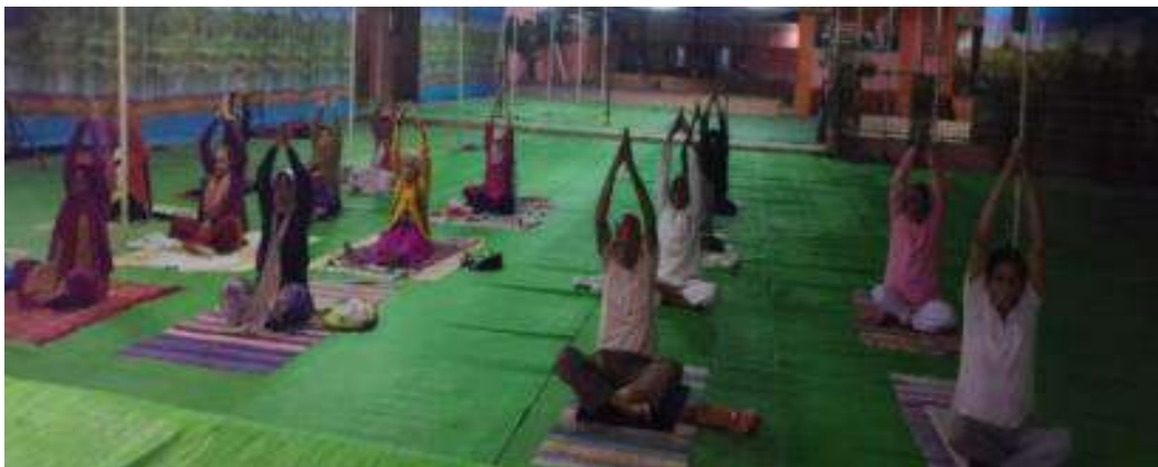
Participants practicing Yoga