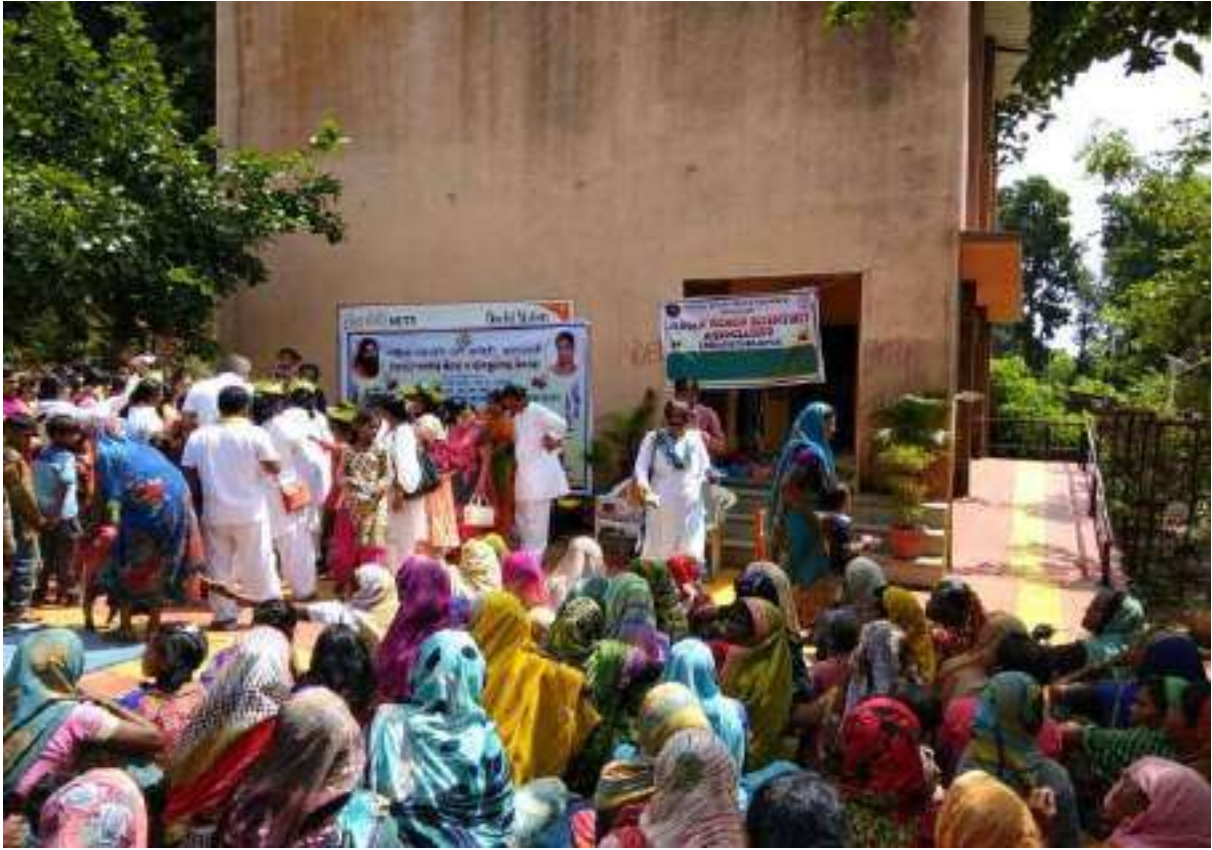
Distribution of clothes and study charts to students and villagers of Khatkali