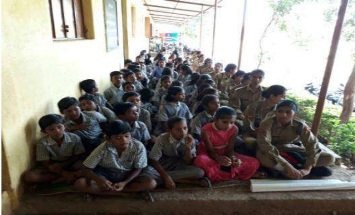
School students listening lecture on cleanliness at Karla Village