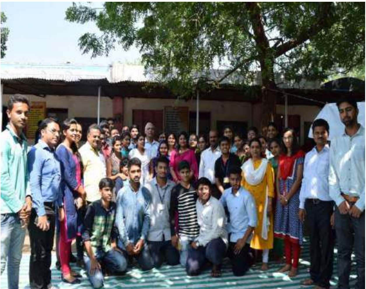
NGO Visit at Sada Shanti Balghruha, Amravati