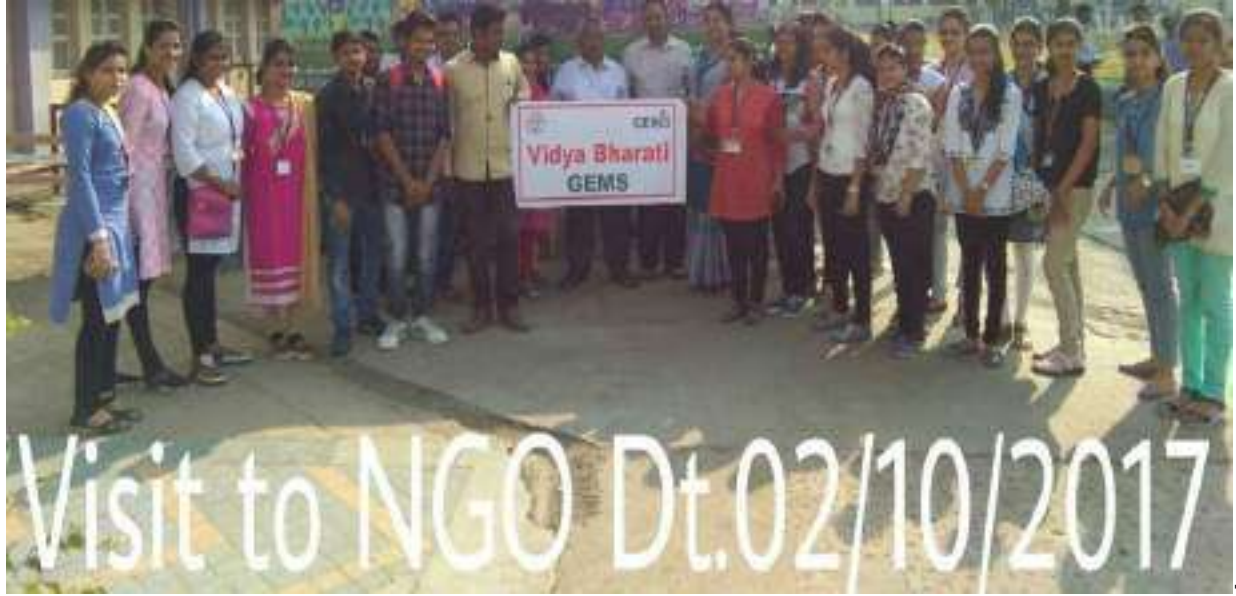
NGO Visit at Shree Bulidan Rathi Muk-badhir Vidyalaya, Sai Nagar, Amravati