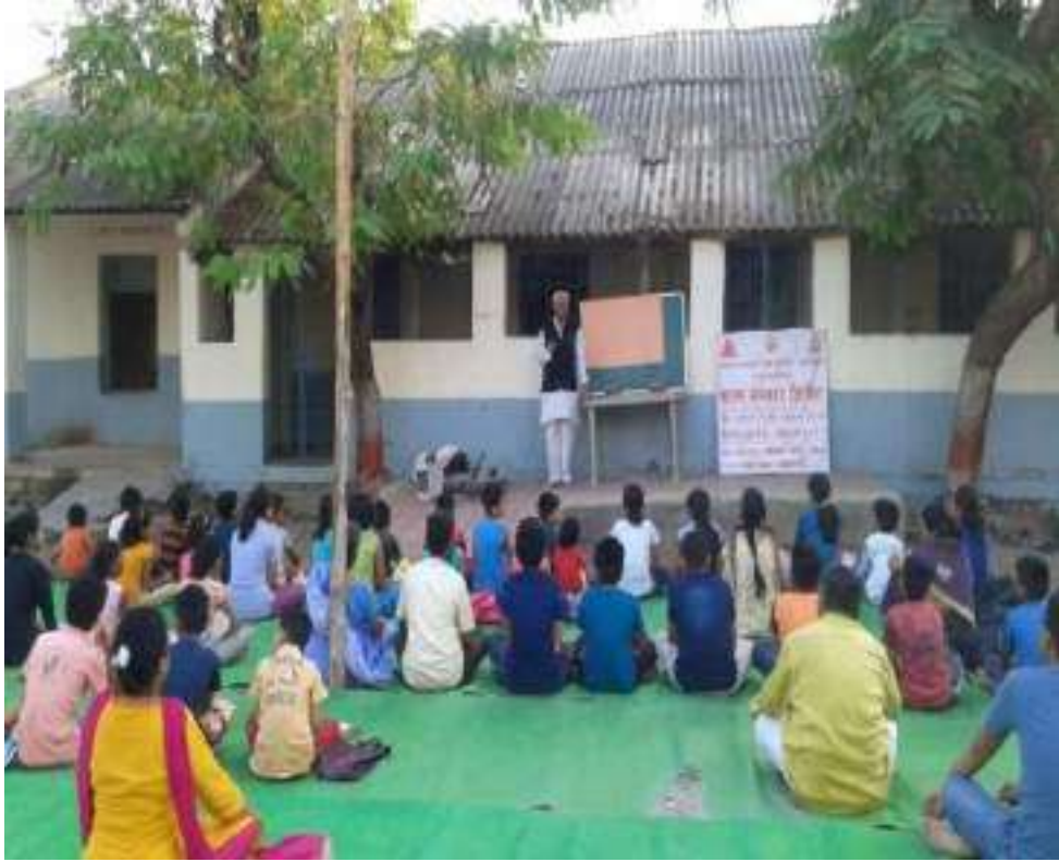
Bal-Sanskar Shibir at Z. P. School, Radhanagar, Amravati