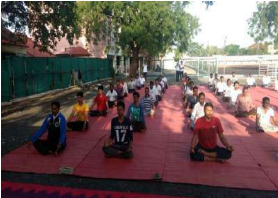
Students practicing Yoga