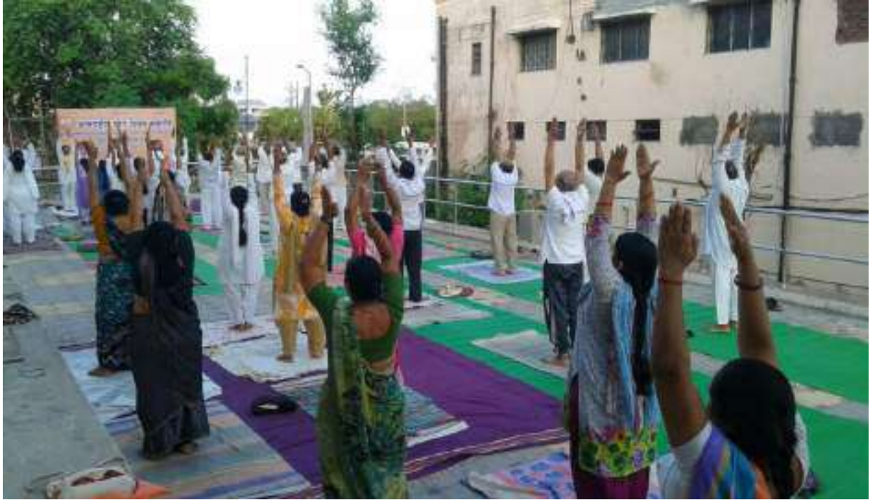
International Yoga Day at Zilha Stadium, Amravati