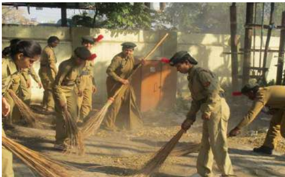
Cleanliness Drive at Irvin Hospital, Amravati

Caption : Cleanliness Drive at Irvin Hospital, Amravati Venue : Irvin Hospital, Amravati Date : 28 Sept 2017 Collaborating agency : NCC & Enviro-Club Total No. of students participated : 94