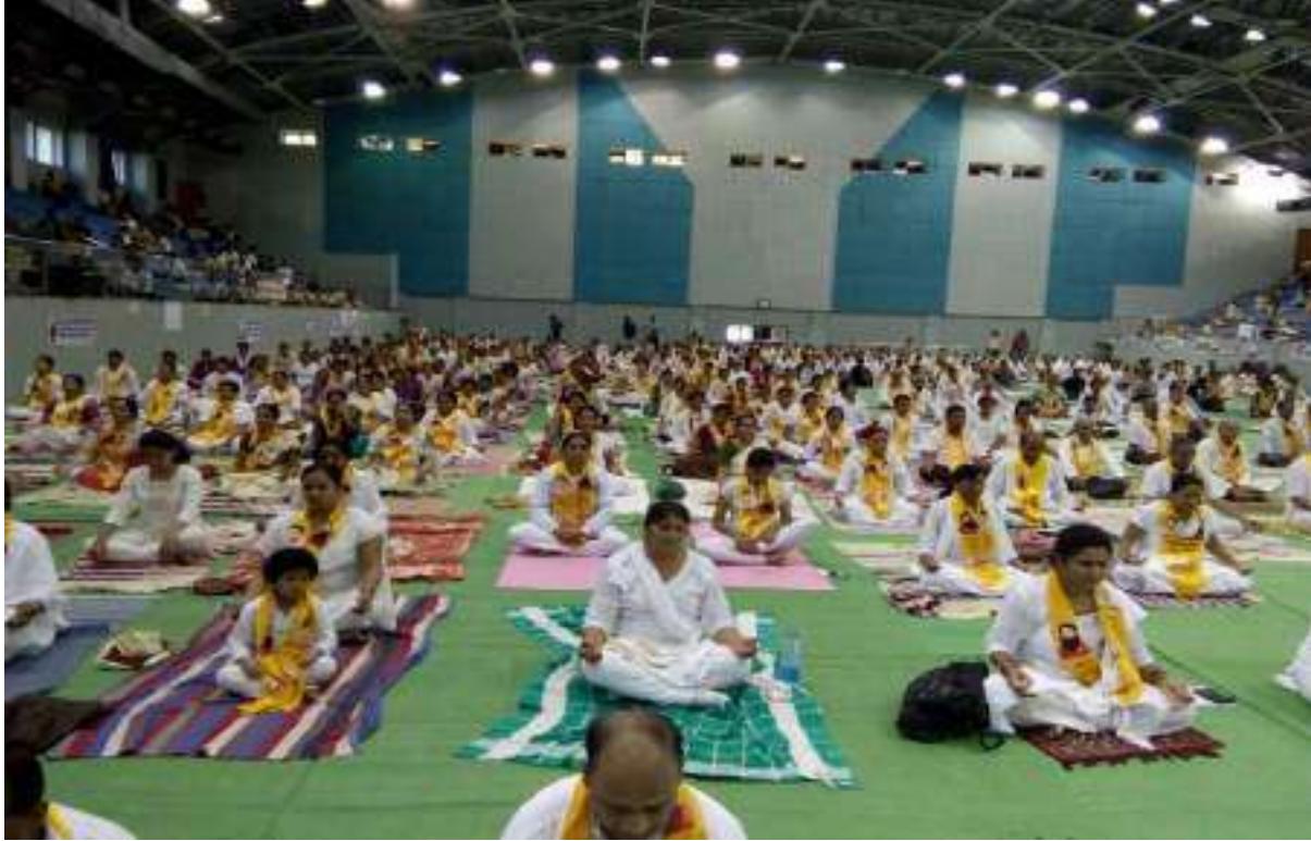
Yoga Training Camp at Zilha Stadium, Amravati