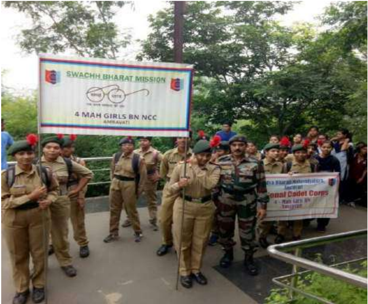
Rally on cleanliness drive from NCC Bhavan to Maltekadi