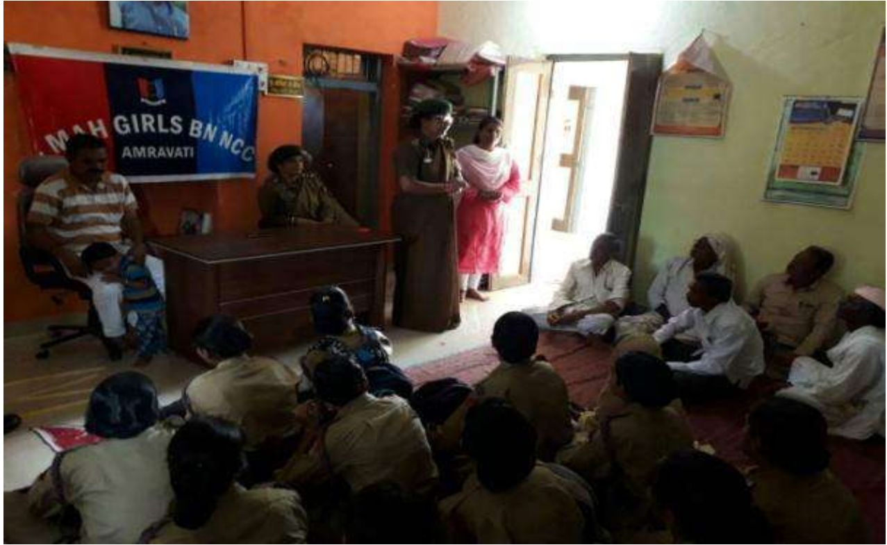
Lecture on Cashless Transaction at Gram Panchayat Karala Village