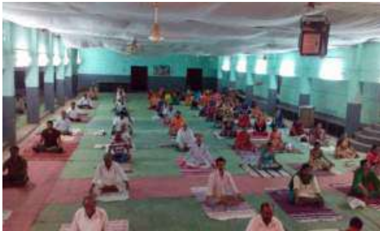
One Day Yoga Class at Bhatkuli Dist. Amravati