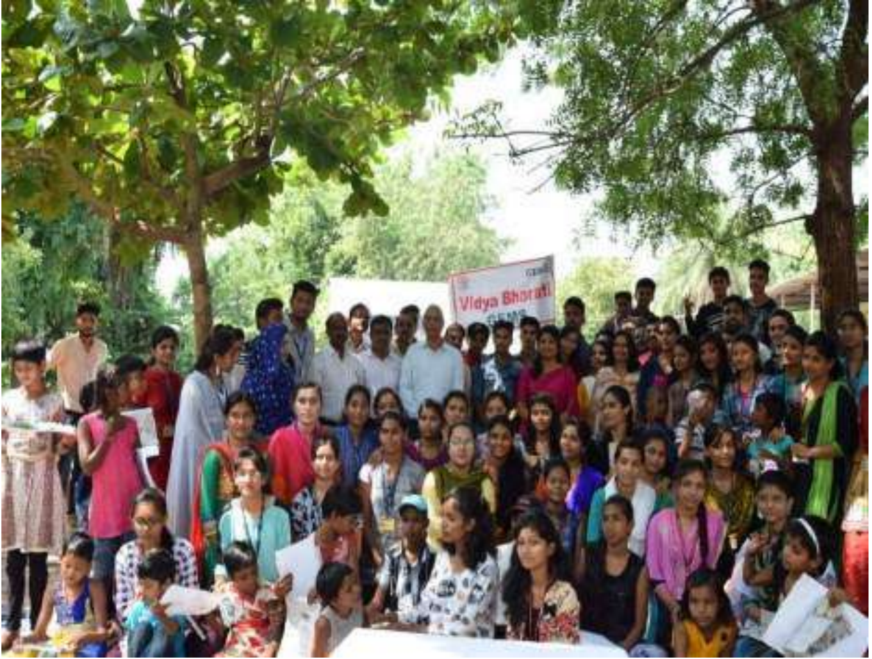
NGO Visit at Sada Shanti Balghruha, Amravati