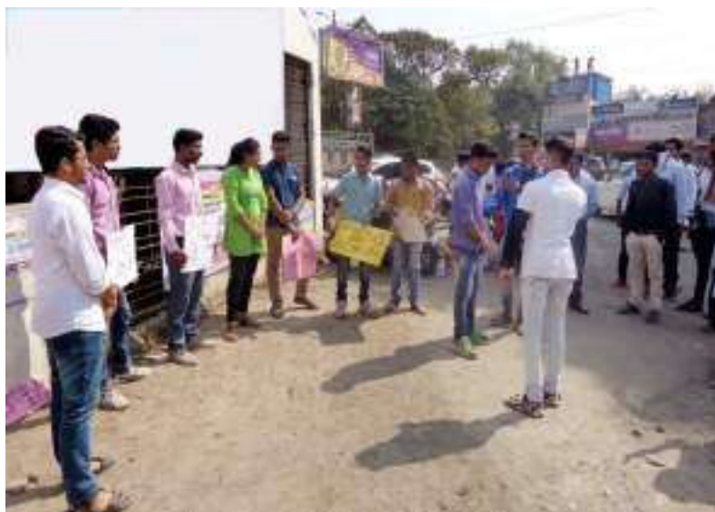
Street Play being performed

Caption : Street Play on Various Burning Social Issues Venue : Camp Road Date : 26/02/2018 Collaborating agency : SOEC Total No. of students : 55 participated