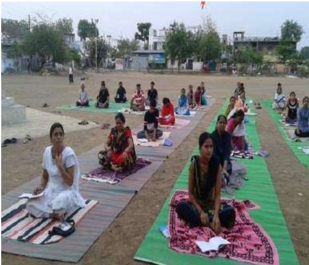
Sahyog Prashikshan Shibir at Kalinka Mata Ground , Amaravti