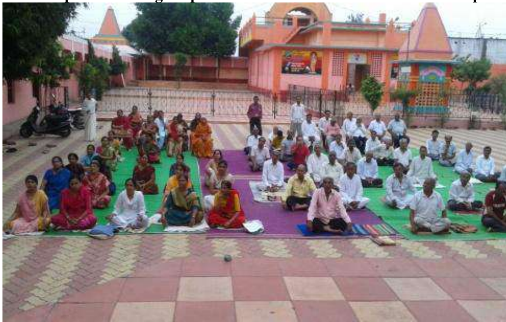
Participants listening to speaker at Heart fullness Meditation Camp