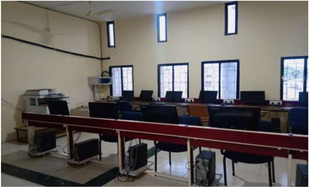
Central Library: Reprography Section