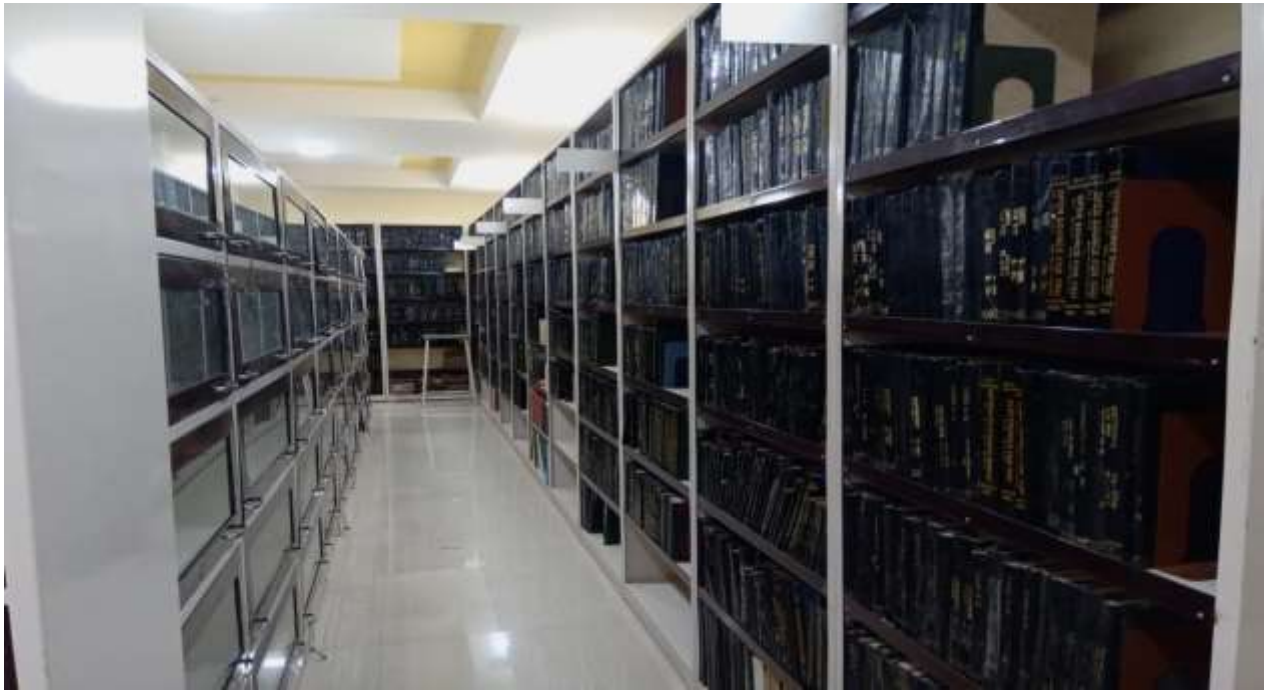
Central Library: Periodical and Reference Section