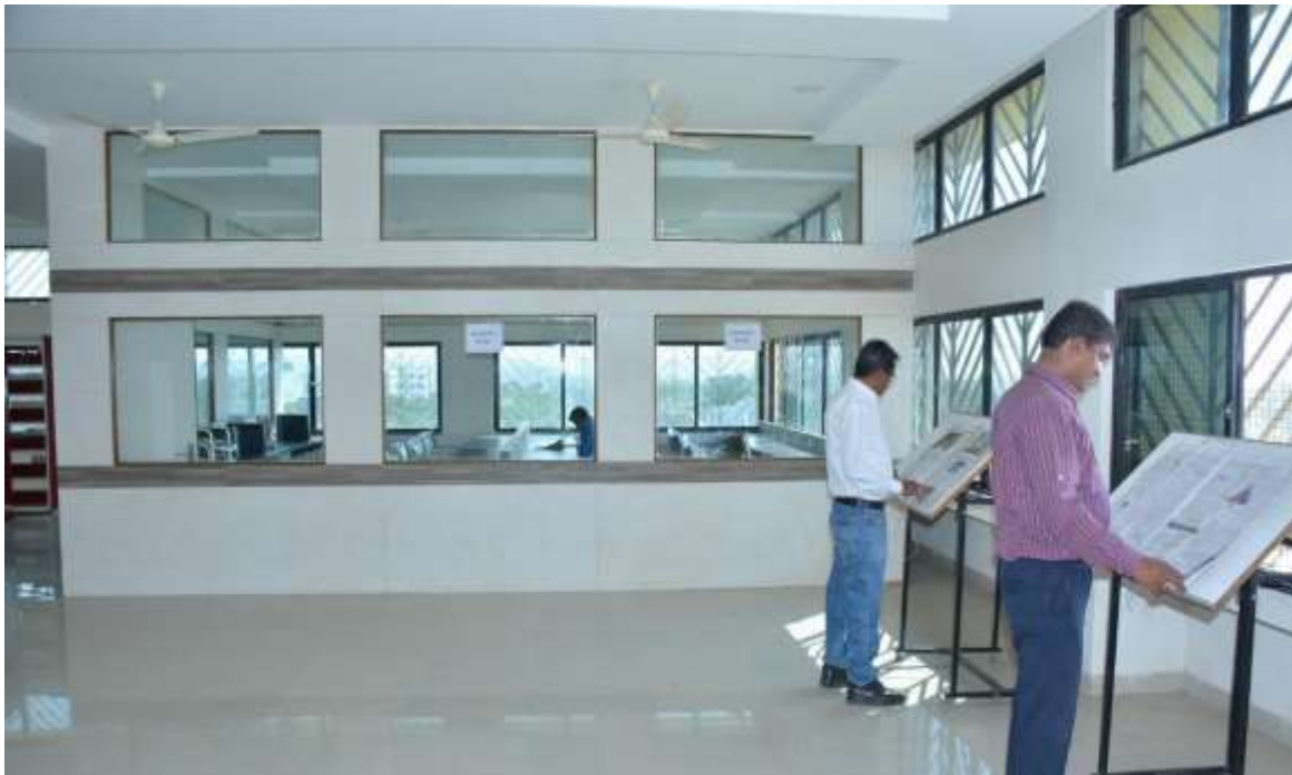
Self Financing Wing: Newspaper Reading Section