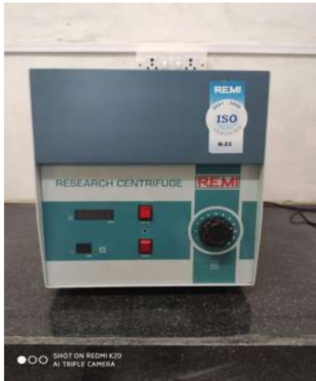
RESEARCH CENTRIFUGE (SPIN PYROLYSIS)