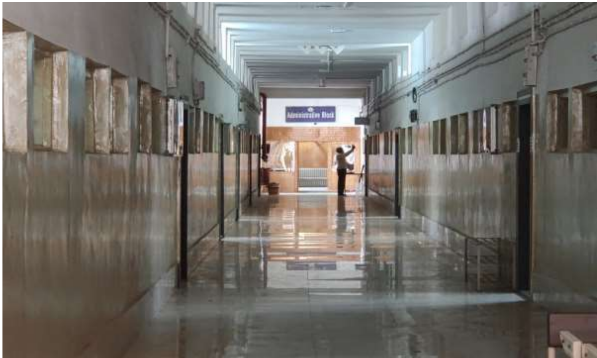
Ground Floor: Corridor