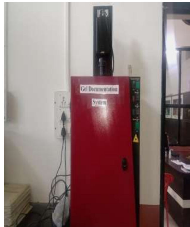
GEL DOCUMENTATION SYSTEM