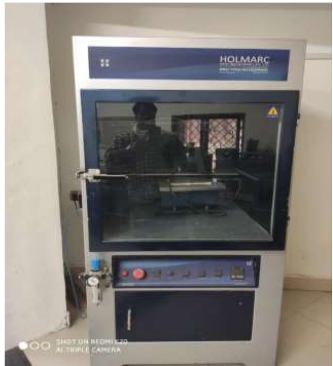
SPRAY PYROLYSIS EQUIPMENT