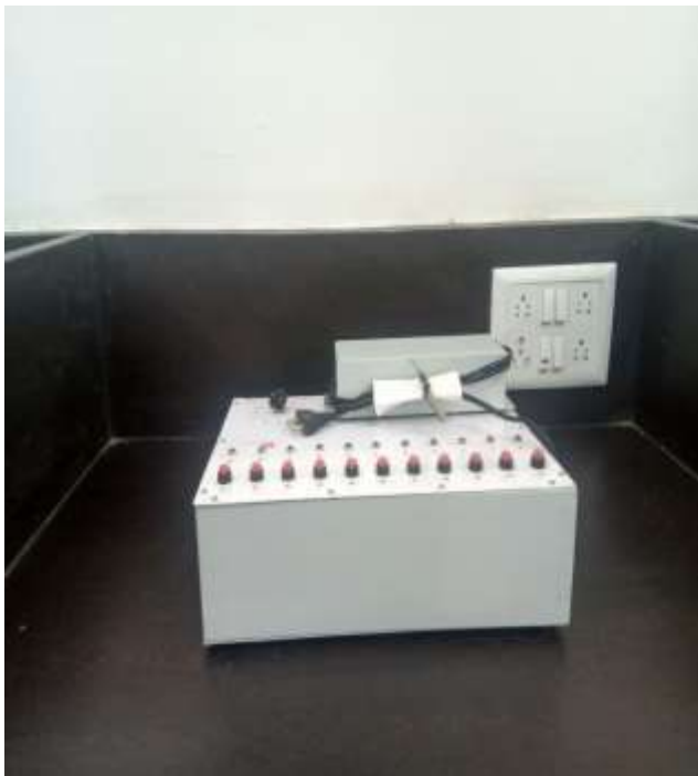
PETERSON RATIONAL LEARNING