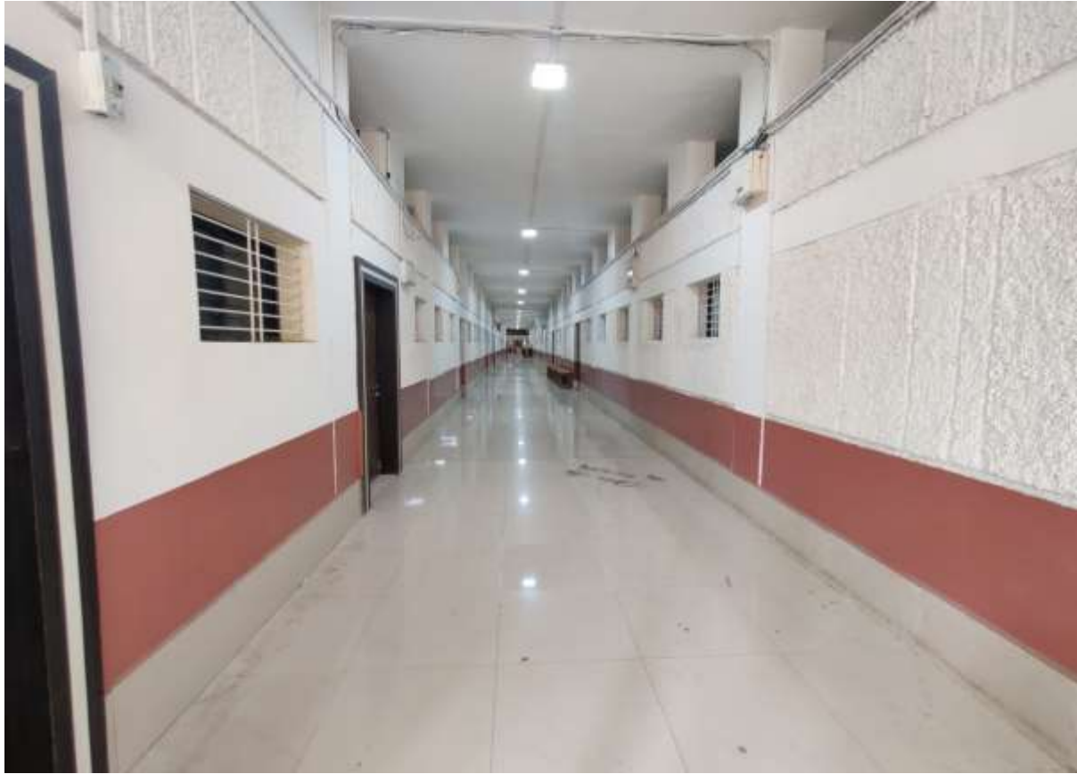
First Floor: Corridor