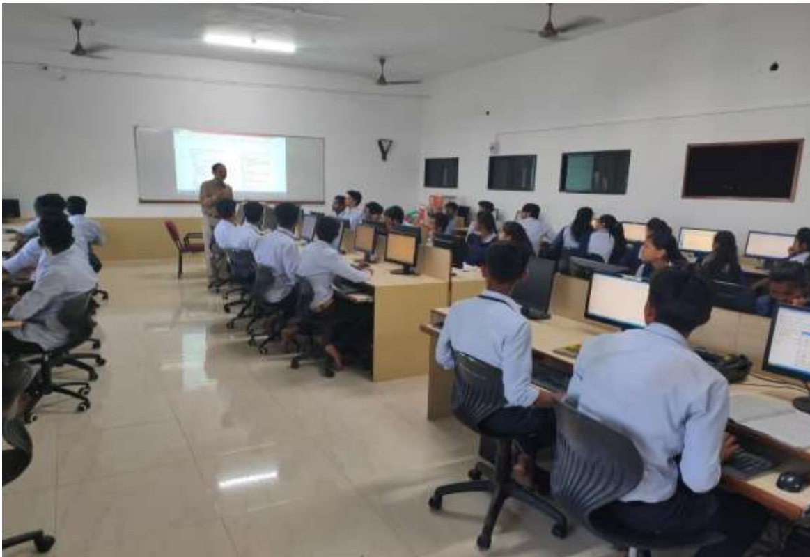
Computer Science Lab 1