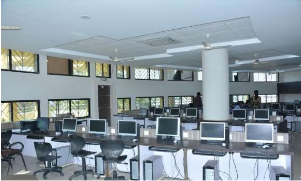
MCA Lab 2