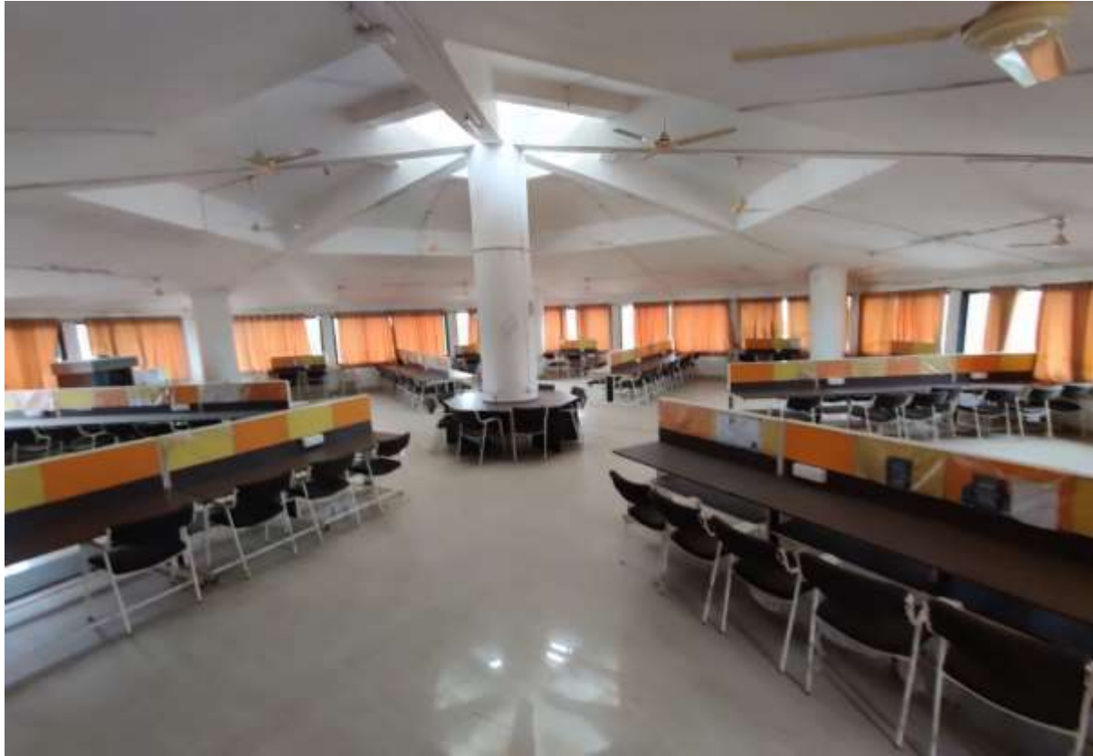
Vidya Niketan Study Centre: Third Floor