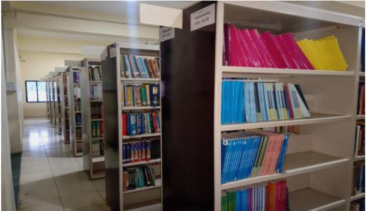
Stack room: Central Library