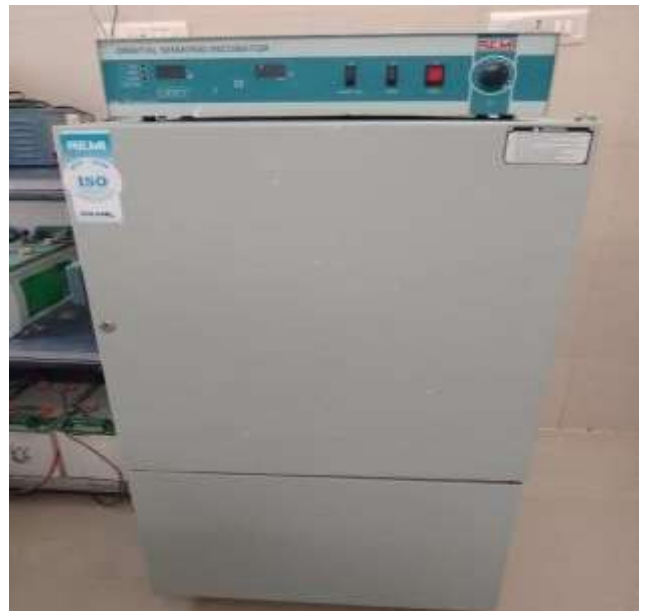
ORBITAL SHAKING INCUBATOR