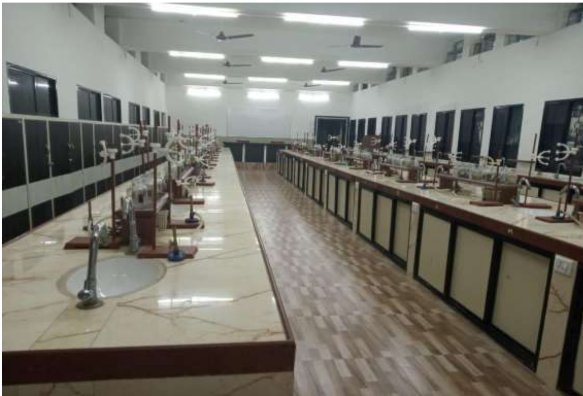
Chemistry Lab 1