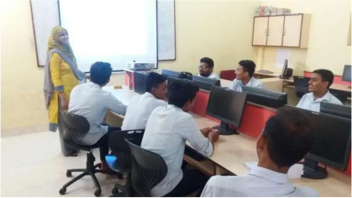
Computer Science: Lab 2