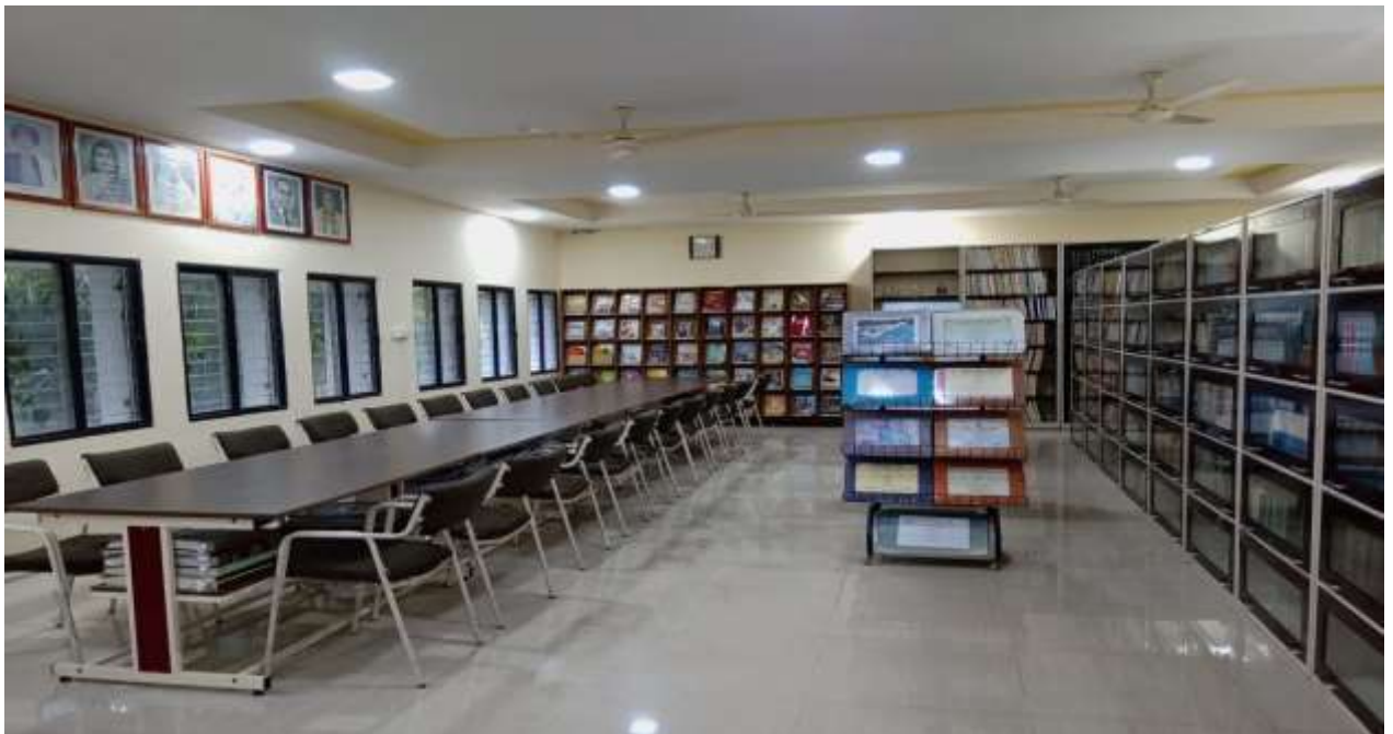
Central Library: Periodical and Reference Section