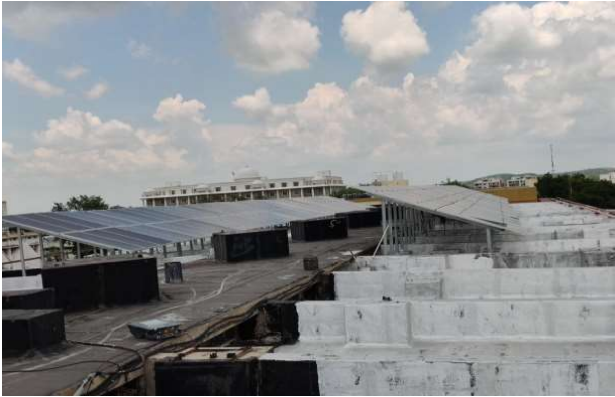
Photovoltaic Panel on the Terrace