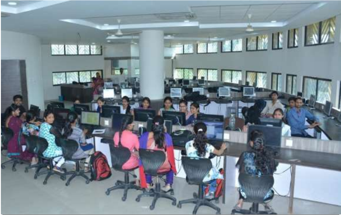
MCA Lab 1