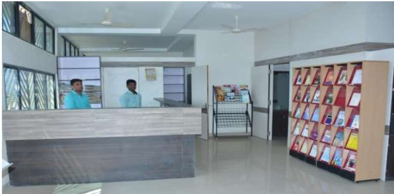
Library: Self Financing Wing