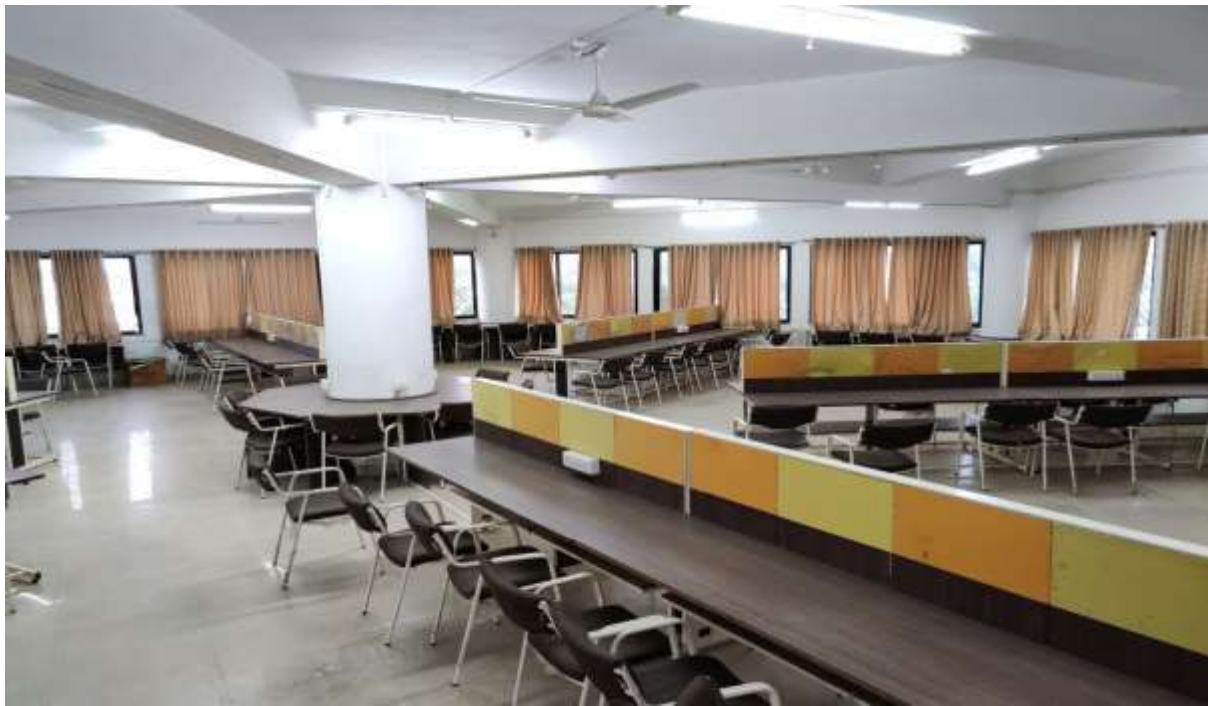
Vidya Niketan Study Centre: Second Floor