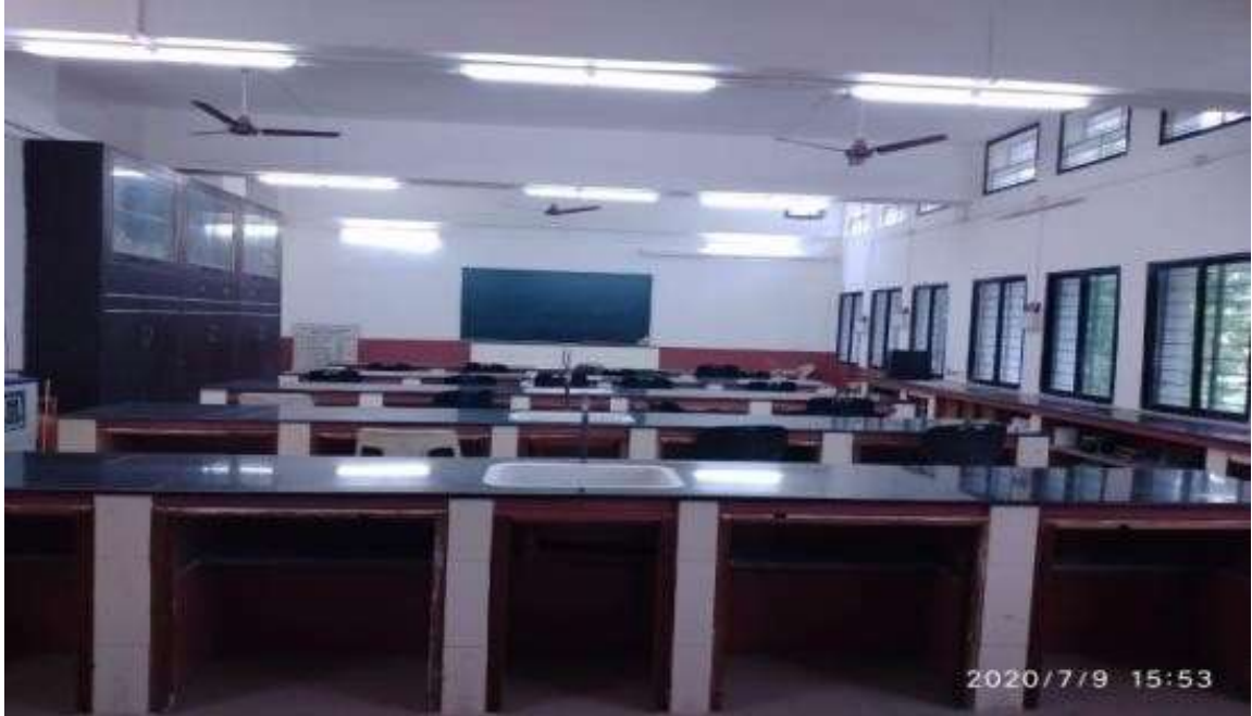
Botany Lab: PG