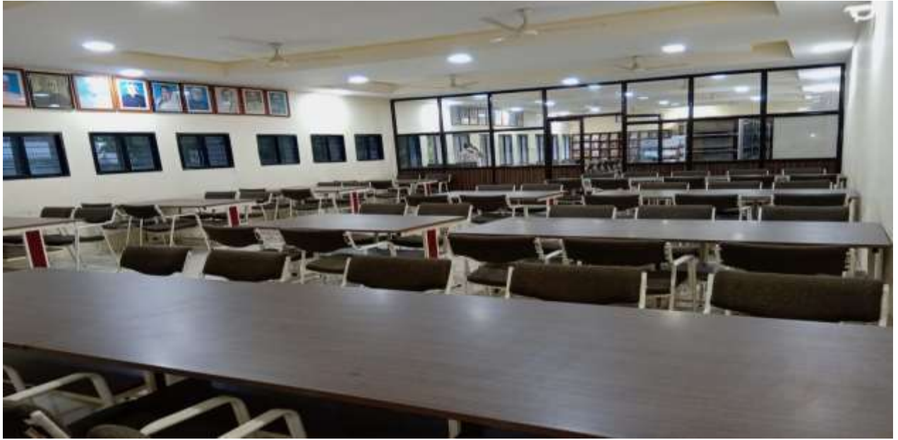
Central Library: Reading Hall