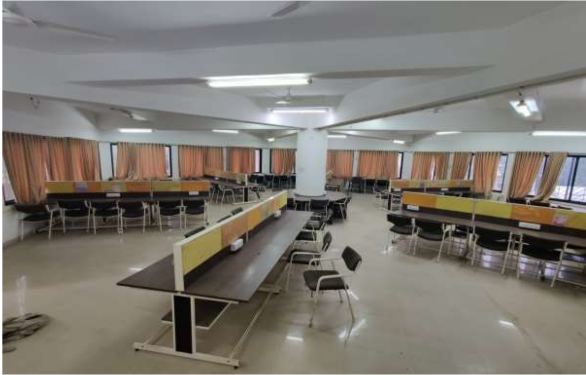
Vidya Niketan Study Centre: First Floor