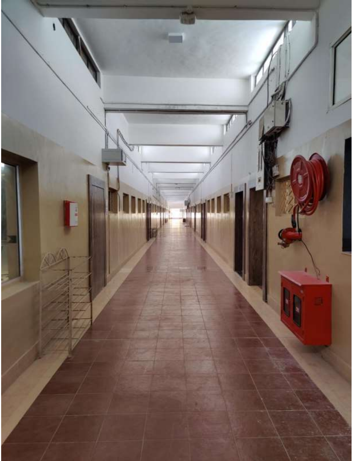
Third Floor: Fire Fighting System