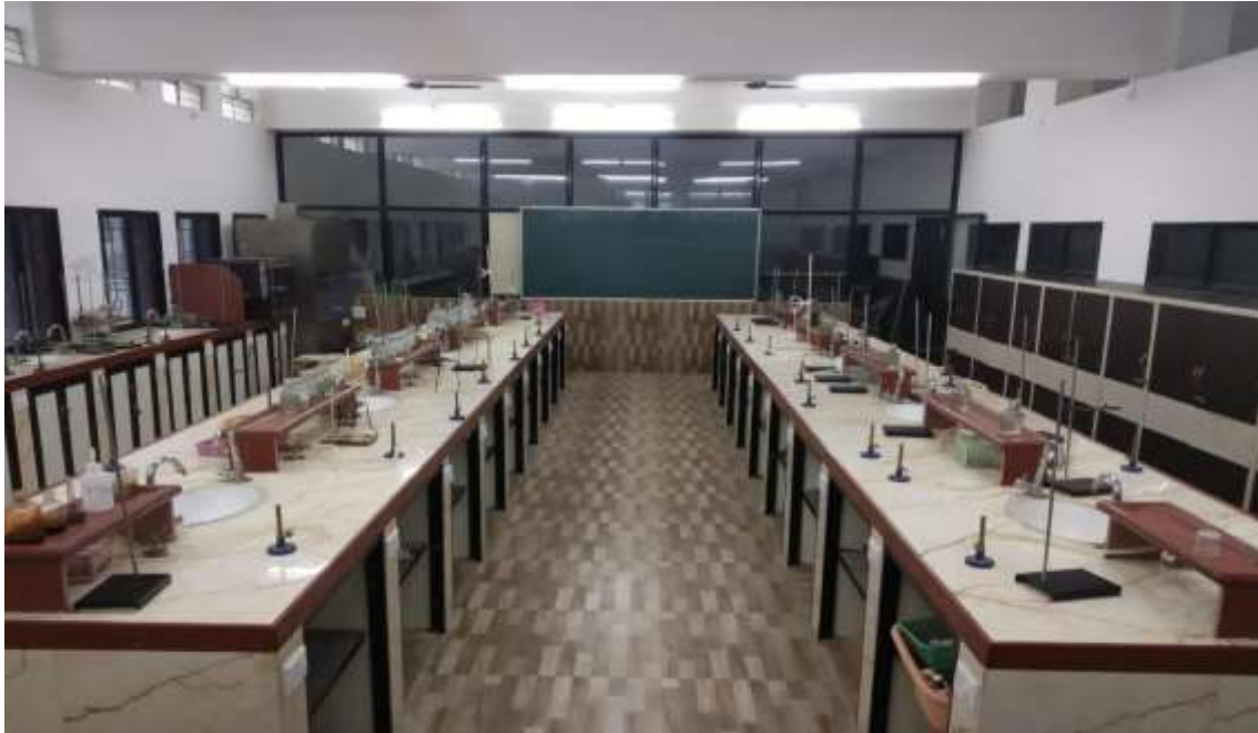
Chemistry Lab 3