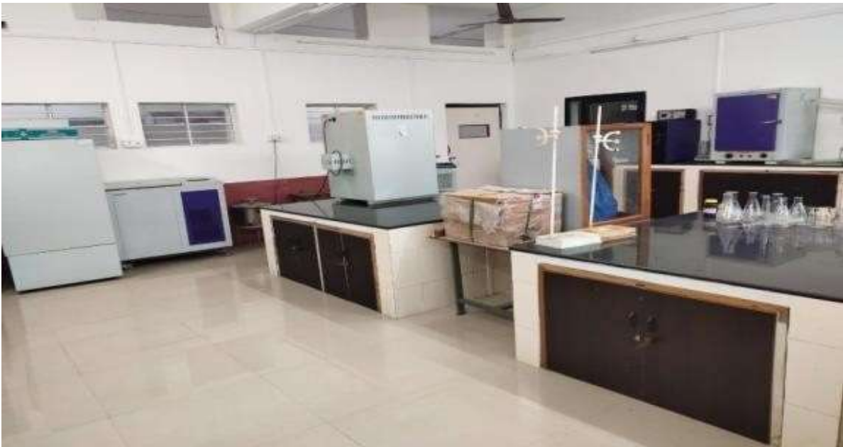
Botany: Research Lab