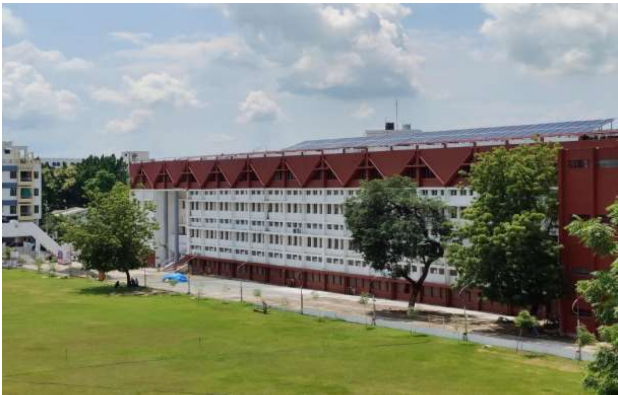
Photovoltaic Panel on the Terrace