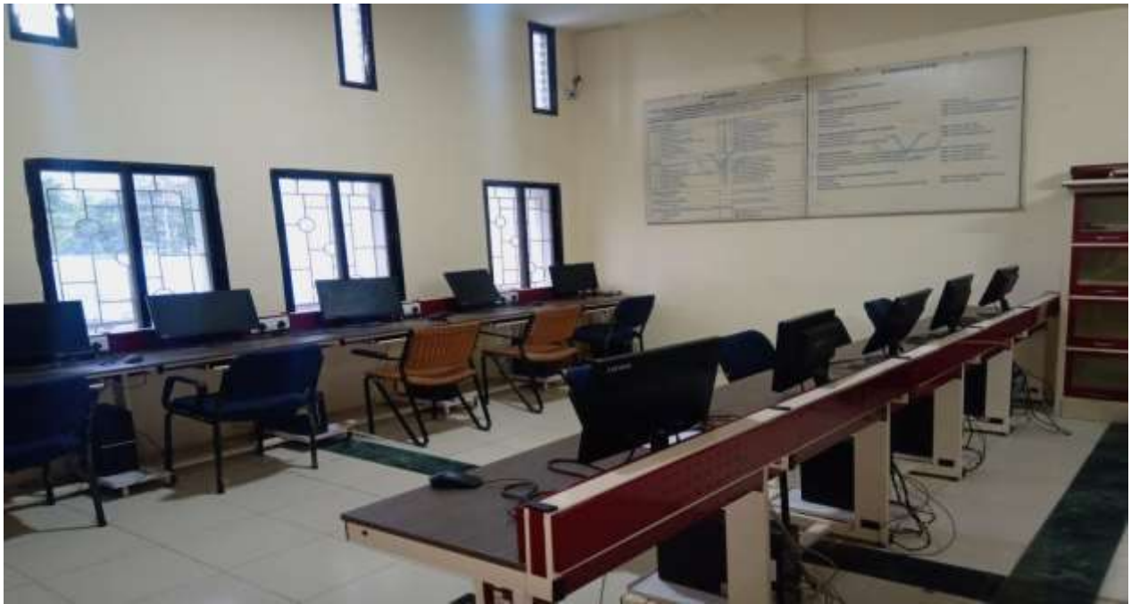
Central Library: Reprography Section