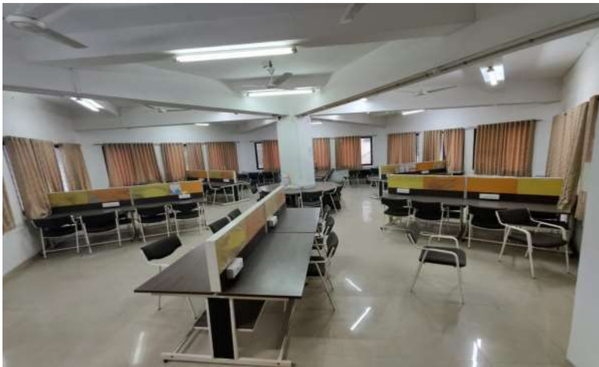
Vidya Niketan Study Centre: Ground Floor