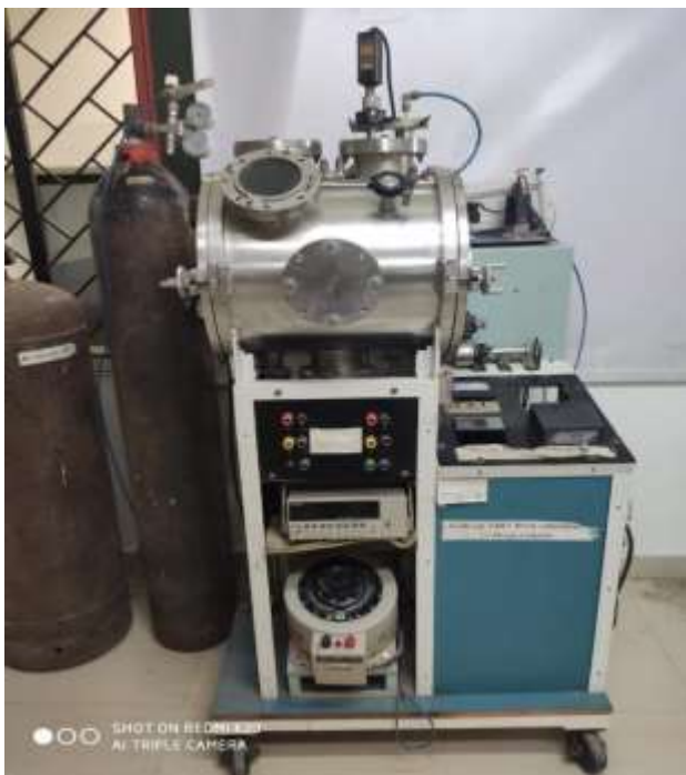
GAS SENSING INSTRUMENT