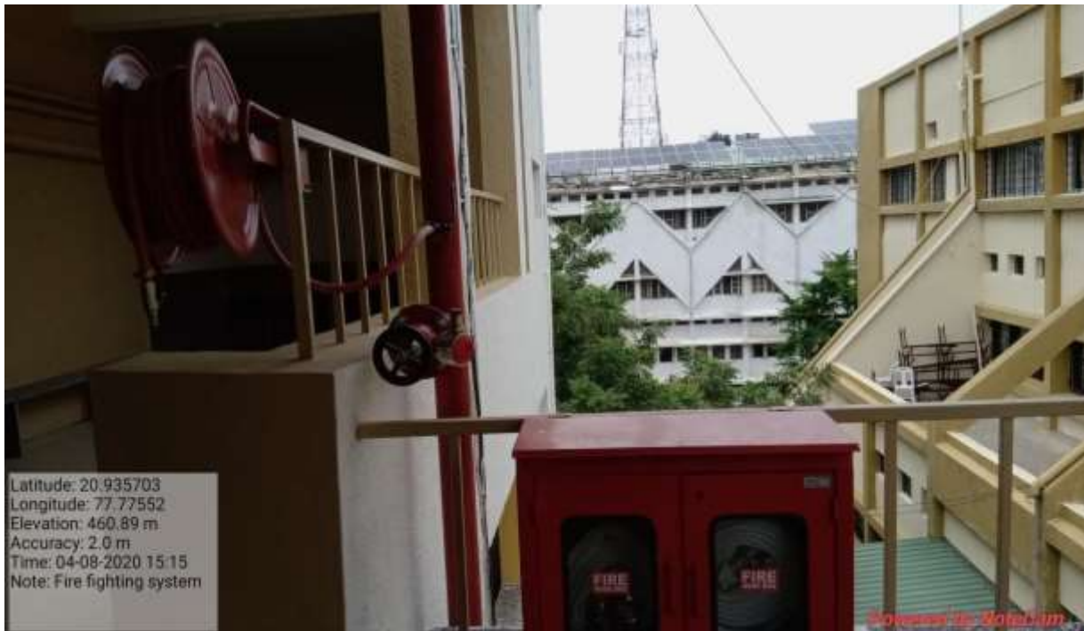
Fire Fighting System