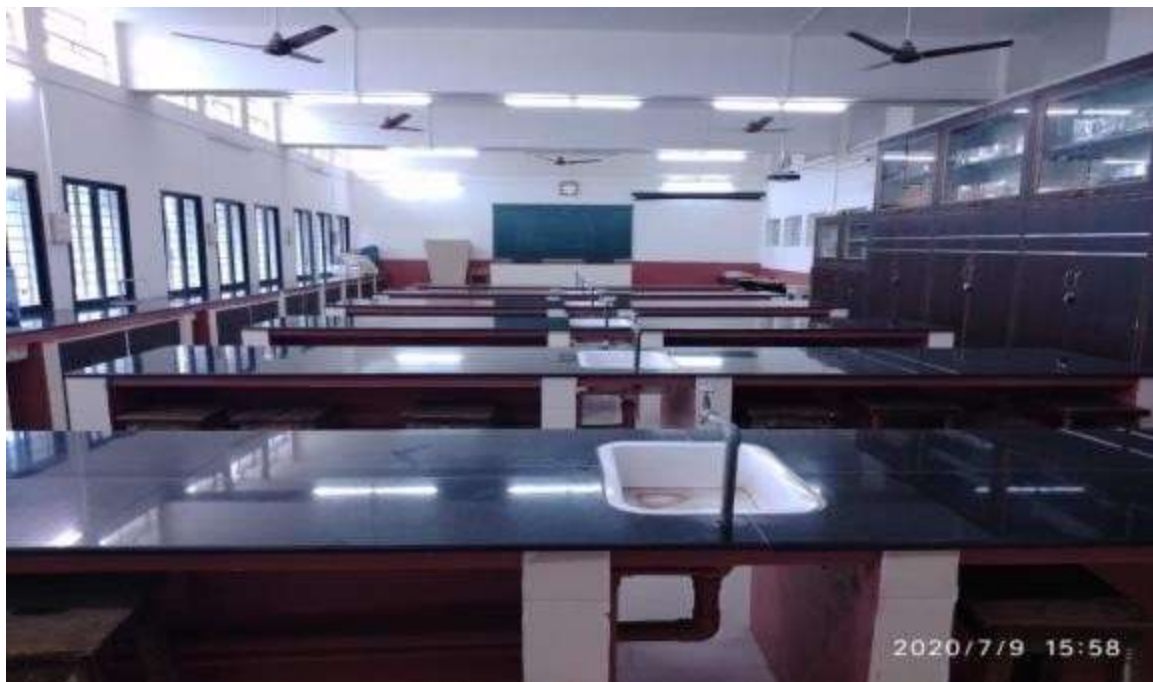
Botany Lab: UG