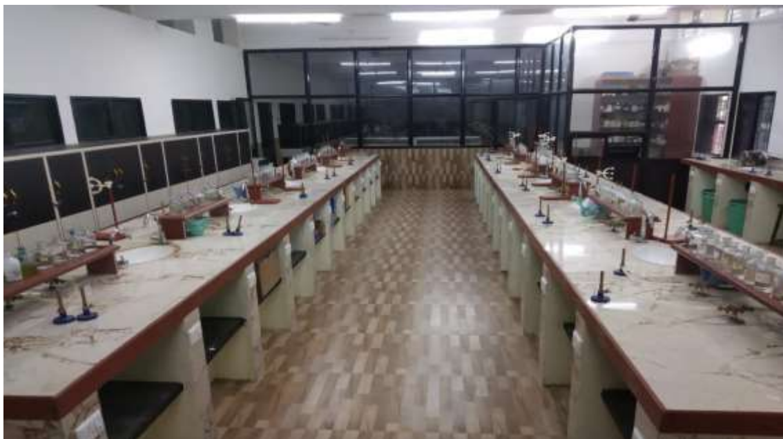
Chemistry Lab 2