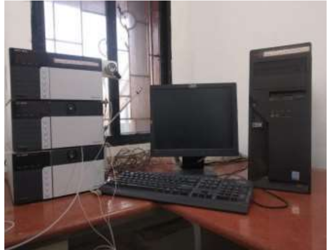
HIGH PERFORMANCE LIQUID CHROMATOGRAPHY