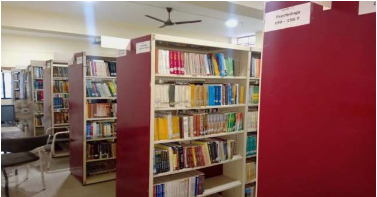
Stack Room: Central Library