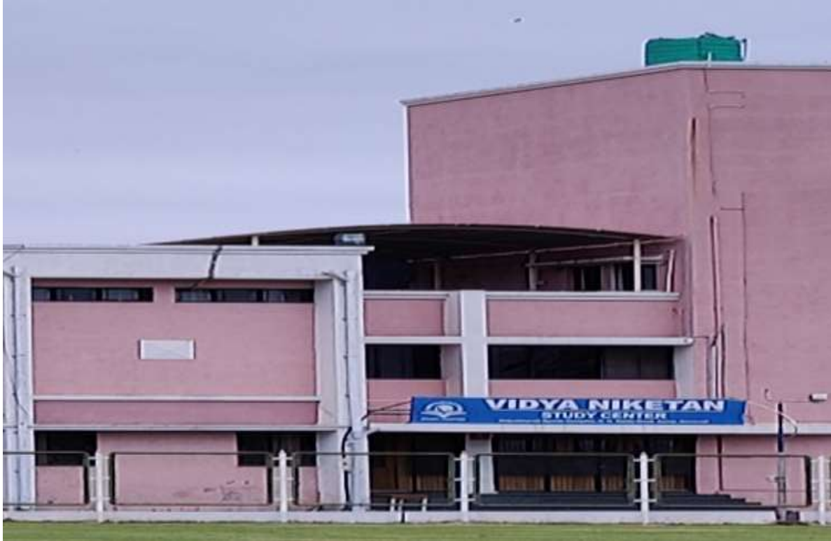
Vidya Niketan Study Center