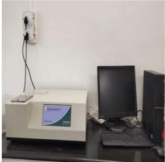
PC BASED UV-VIS SPECTROPHOTOMETER