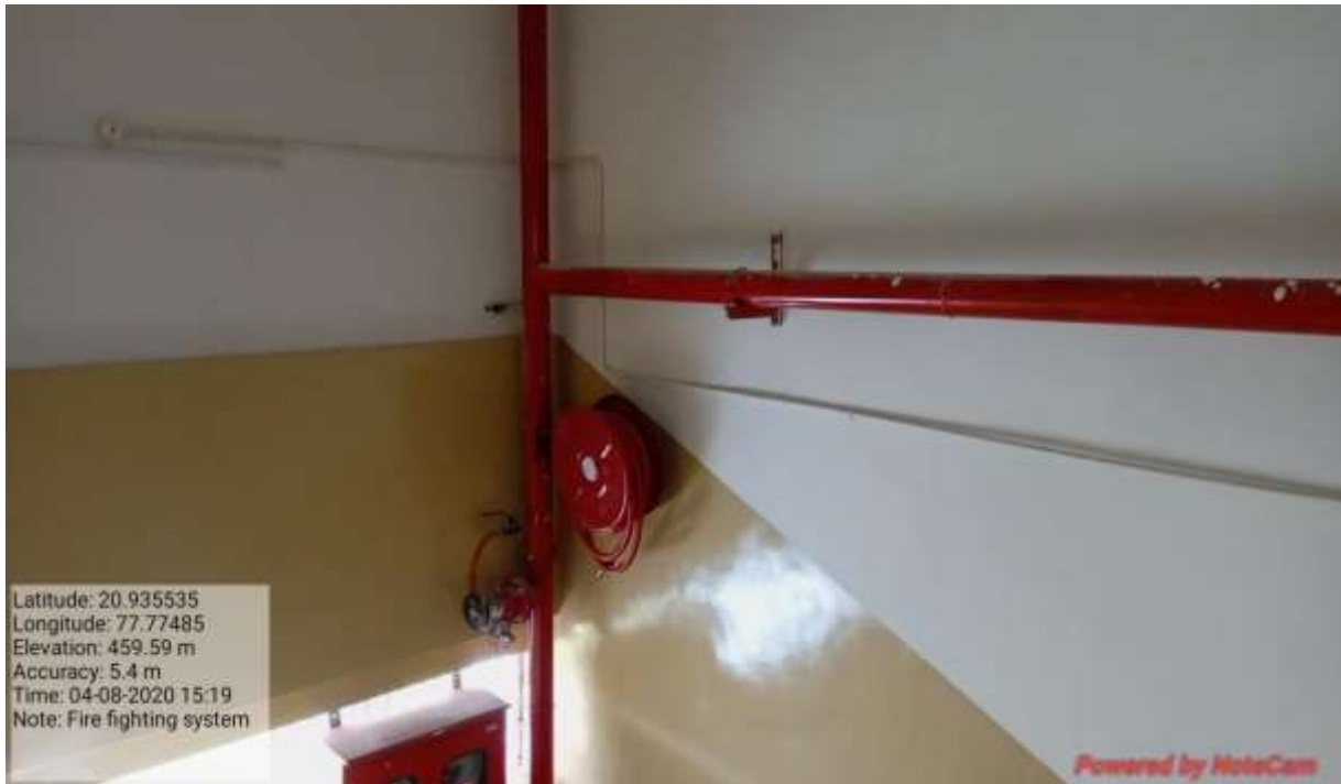
Fire Fighting System