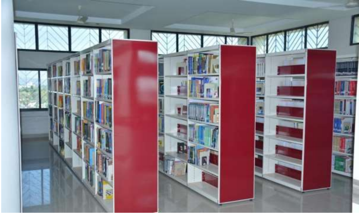
Self Financing Wing: Stack Room