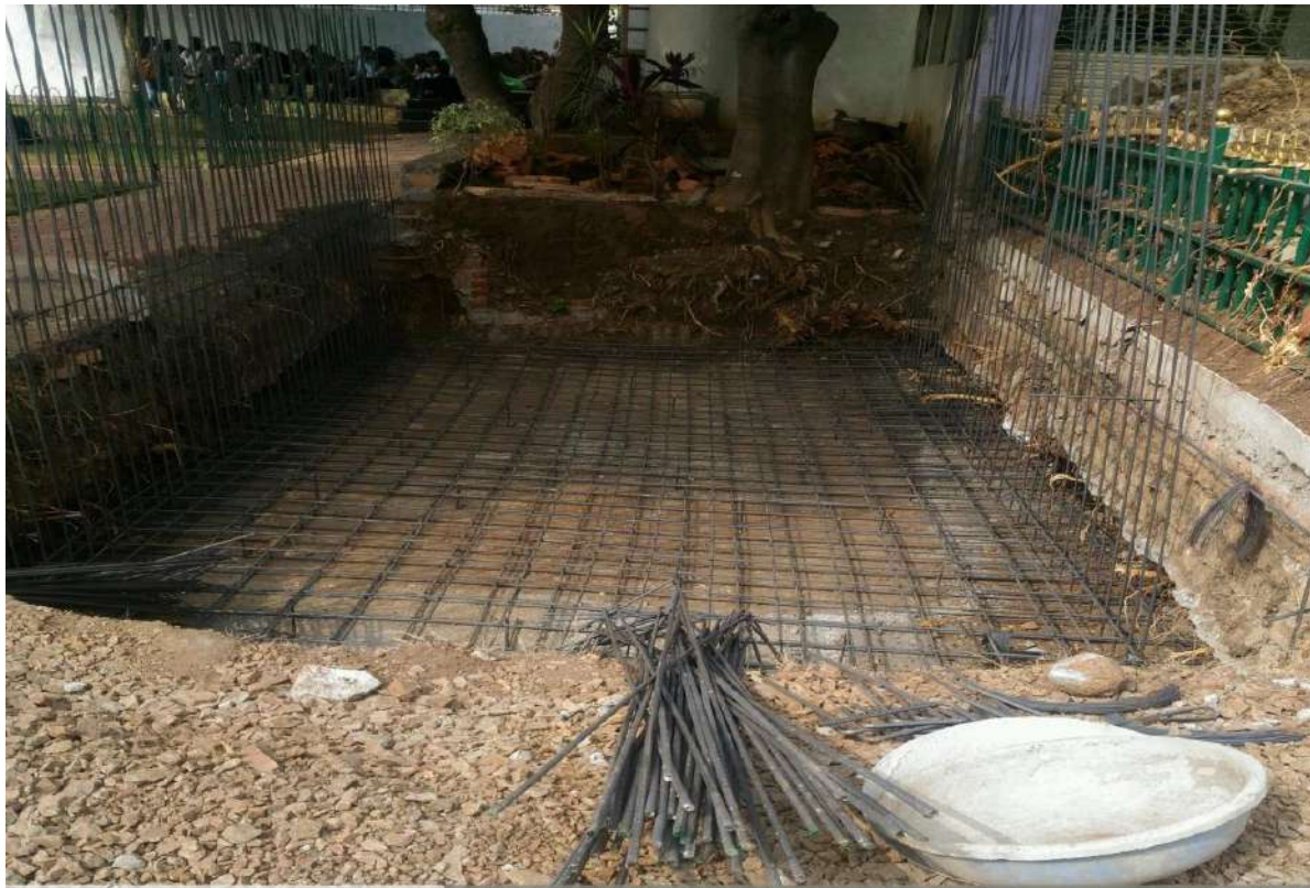
Sewage Water Treatment Plant (Under Construction) under the guidance of National Environmental Engineering Research Institute (NEERI), Nagpur