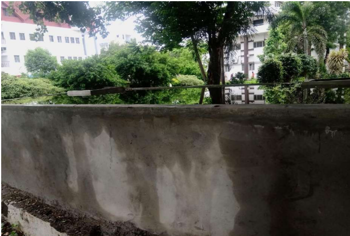
Sewage Water Treatment Plant (In Function) under the guidance of National Environmental Engineering Research Institute (NEERI), Nagpur, Capacity 25000 Liters