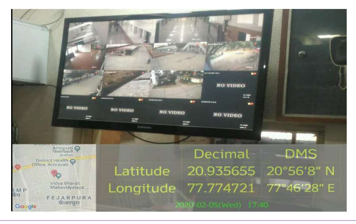
CCTV Surveillance Unit under the control of Office Superintendent