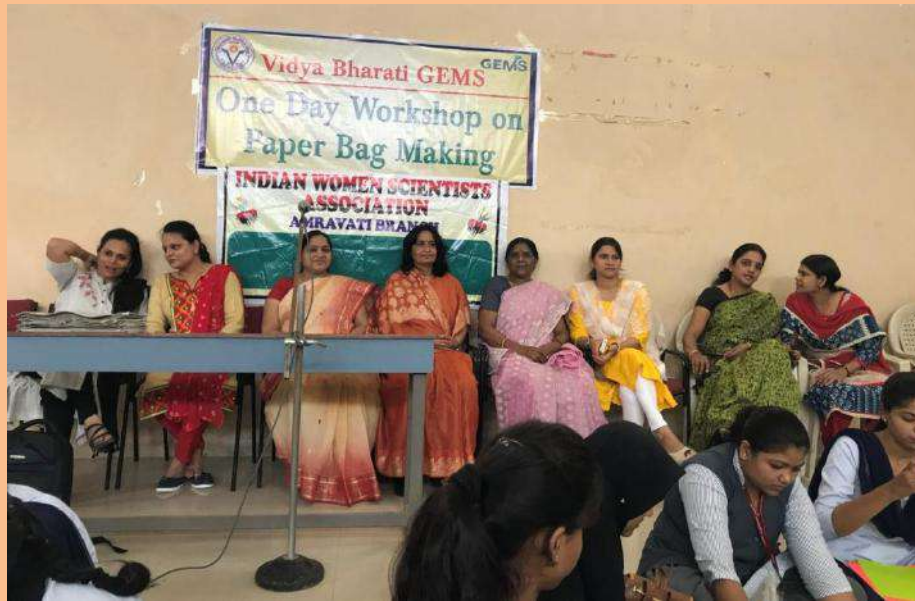
Paper Bag Making Workshop in collaboration with Indian Women Scientist Association