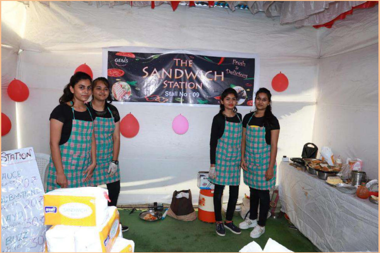
The sandwich station by our female entrepreneurs