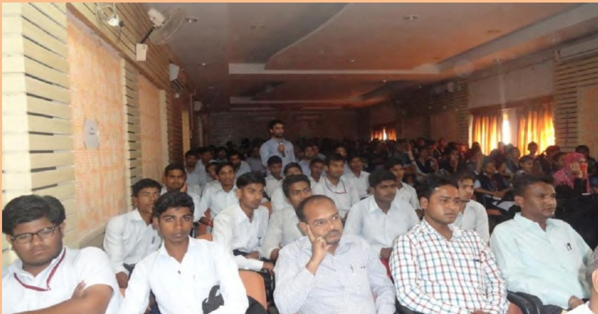
Students and staff of college listening the session