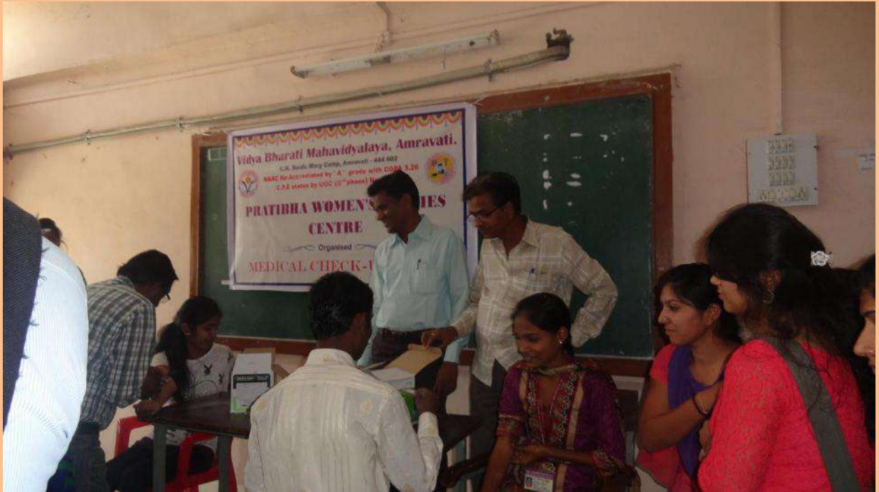
Rubella Vaccination Camp at Vidya Bharati Mahavidyalaya