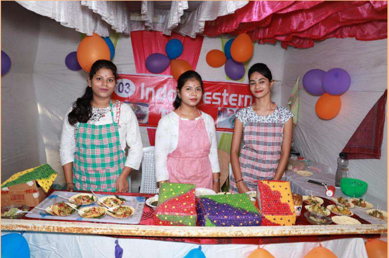
The trade fair : A step to empower women