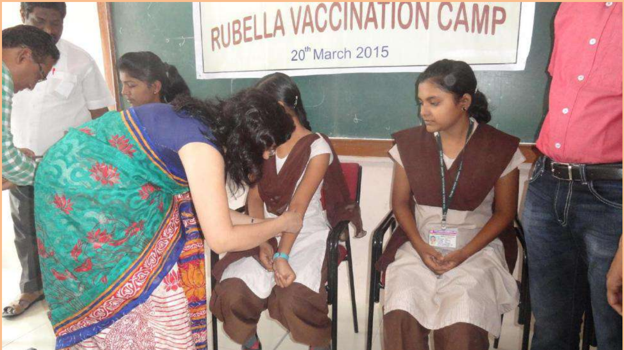
Rubella vaccination Camp