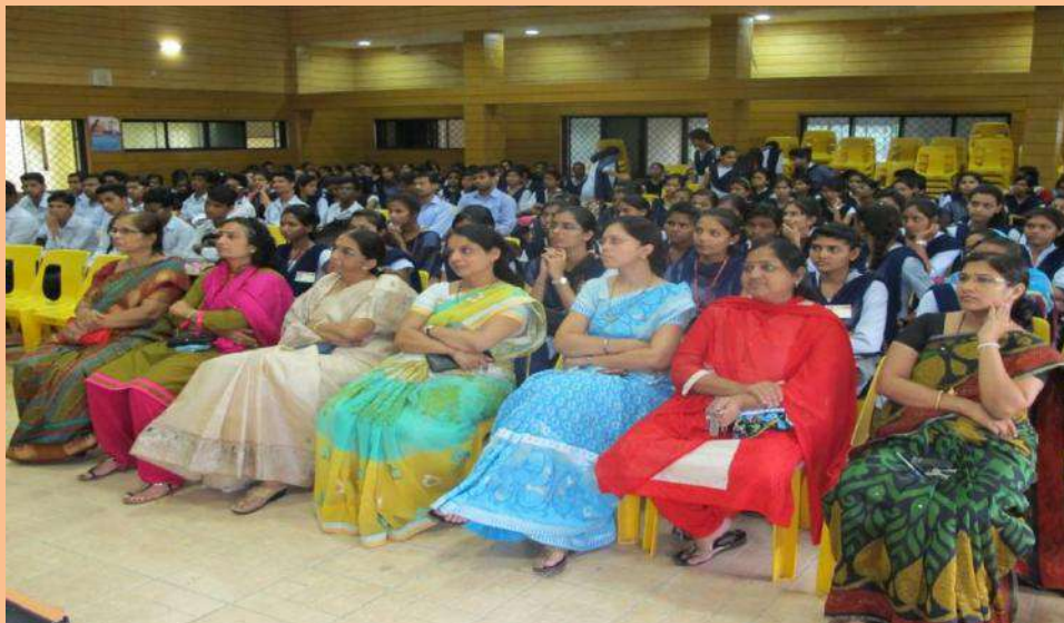
Faculty members and students attending a session on “ Mahilanchya Samajik Samasyssa ”