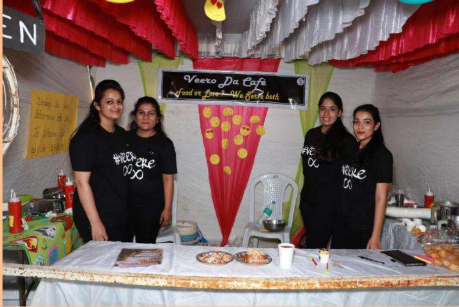
Our future entrepreneurs participating in the Trade Fair