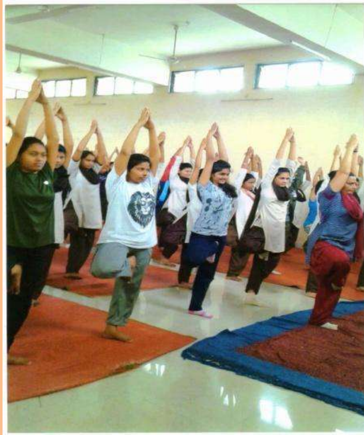
Students performing “ Rukshasana ”