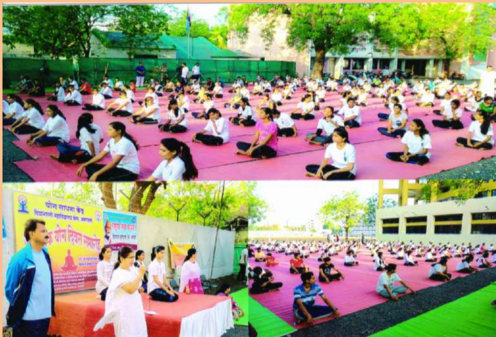
Vidya Bharati Mahavidyalaya celebrated "International Yoga Day"