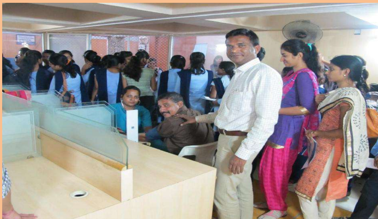
Faculty and students of VBMV at the camp undergoing Medical Check Up