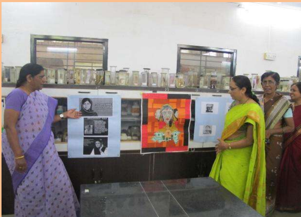
Poster Exhibition on the occasion of “International Girl Child Day” organized on 11/10/2018