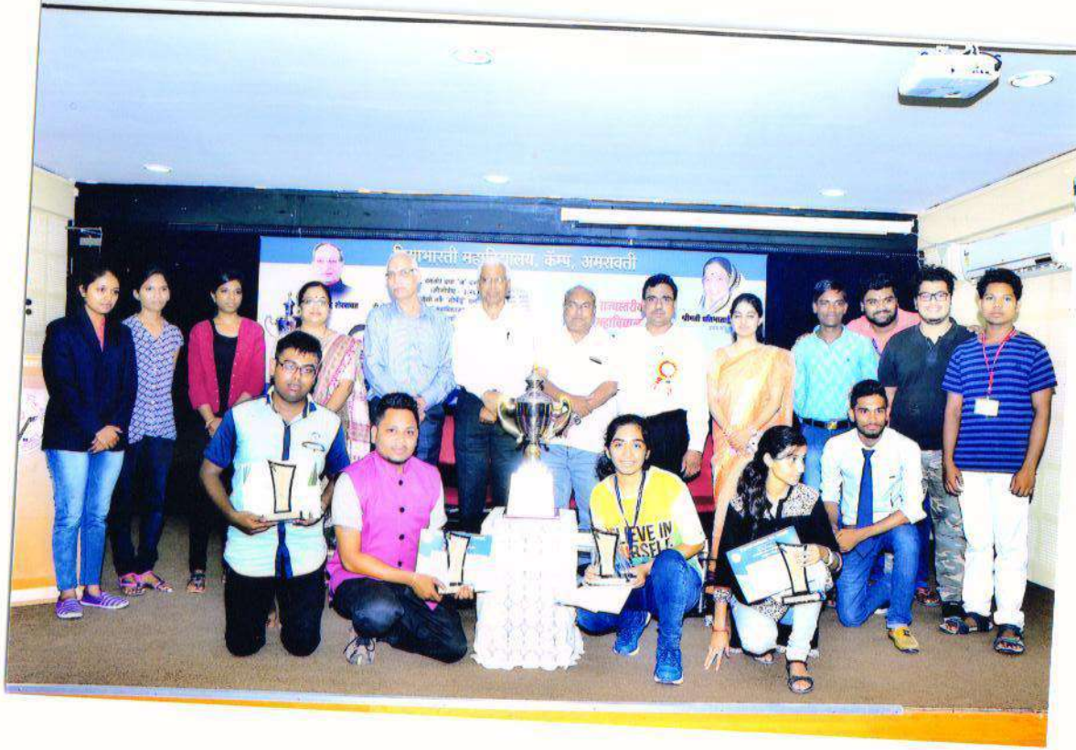
Winners of the Elocution Competition