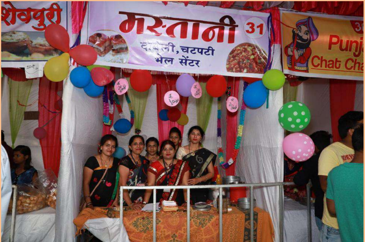
The Stall by the girl students in the trade fair organized by Vidya Bharati GEMS