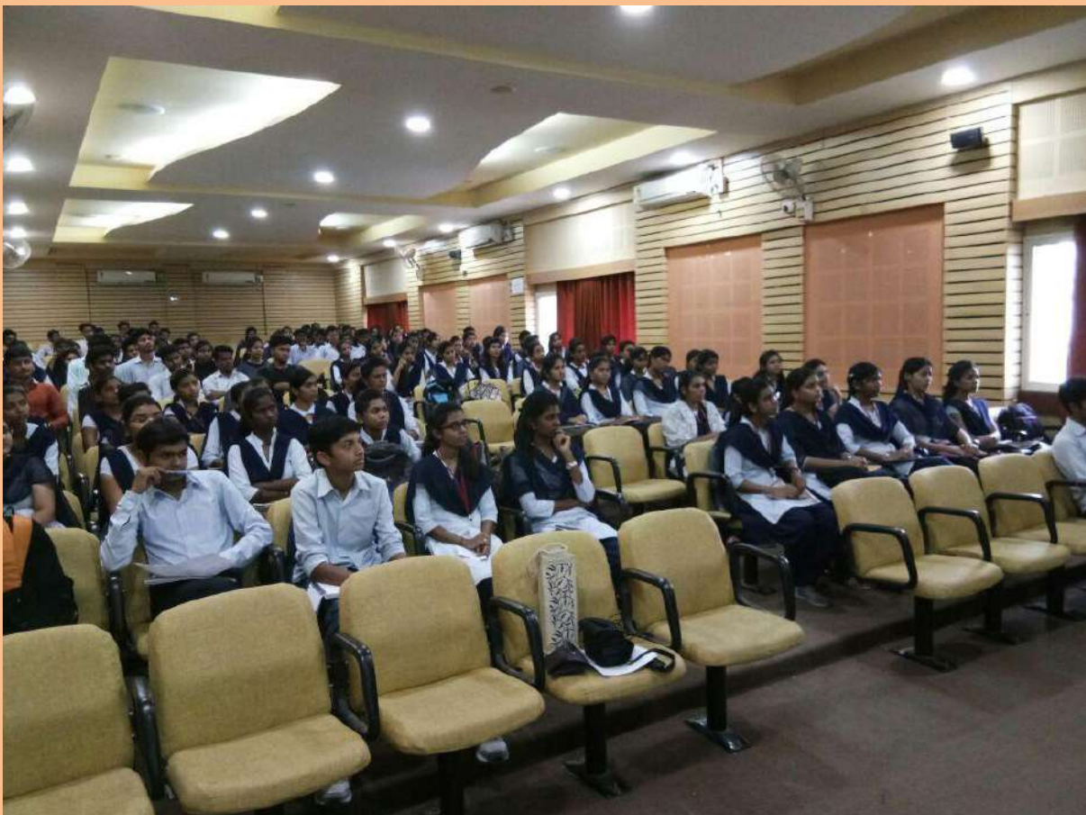
Students attending program on “Women’s Role in Politics”