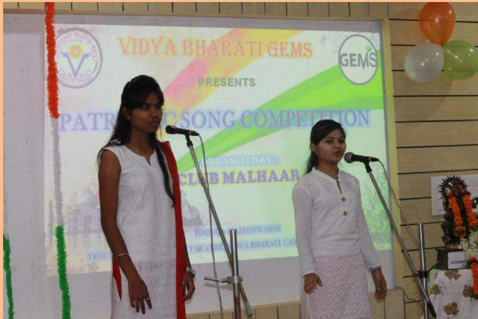
Girls singing duet during patriotic song competition