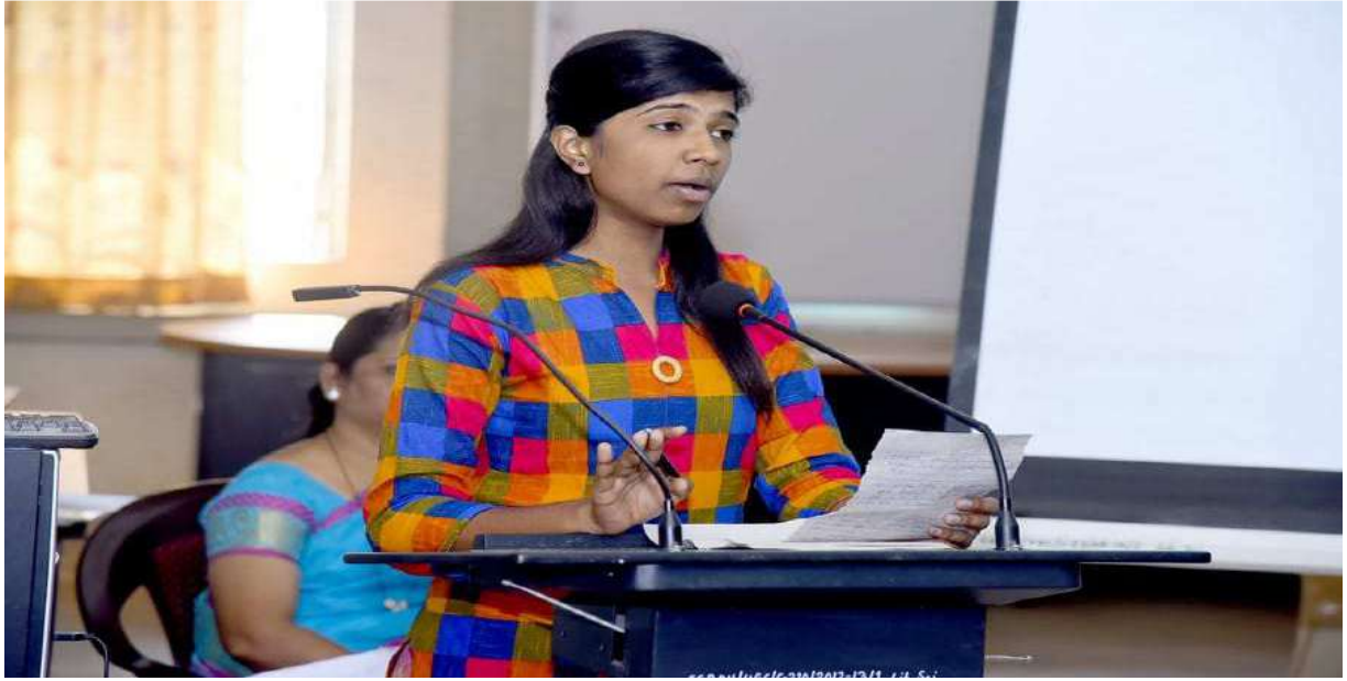
A Student speaking on the occasion of Hindi Divas for inculcating reading habits