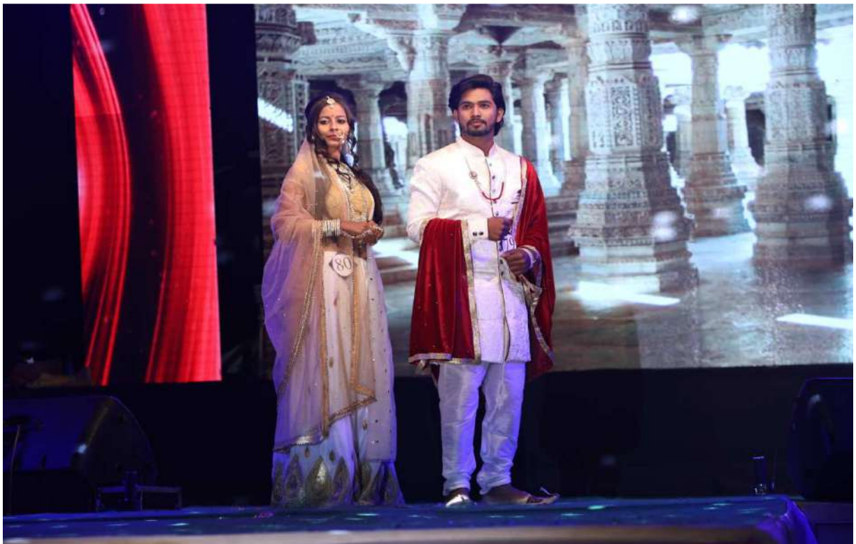
Students depicting various cultures through costumes