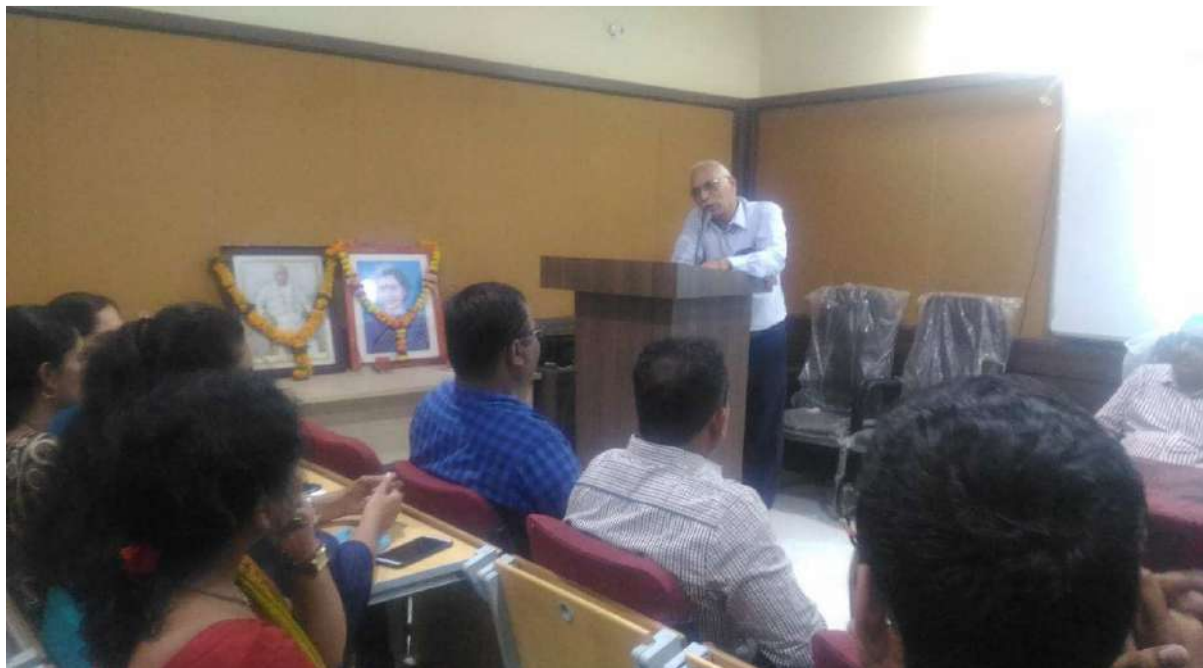
The Principal addressing on National Unity Day on Birth Anniversary of Sardar Vallabhbhai Patel