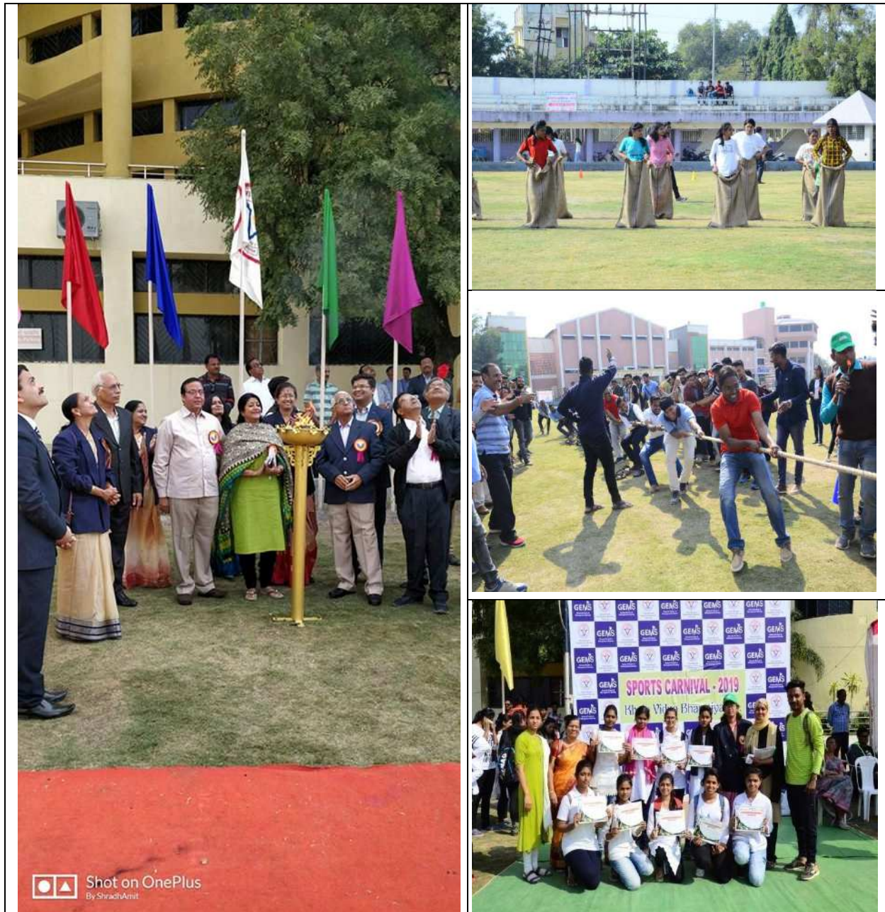
Sports Carnival, a joyous event specially made for non-sports persons of the Campus