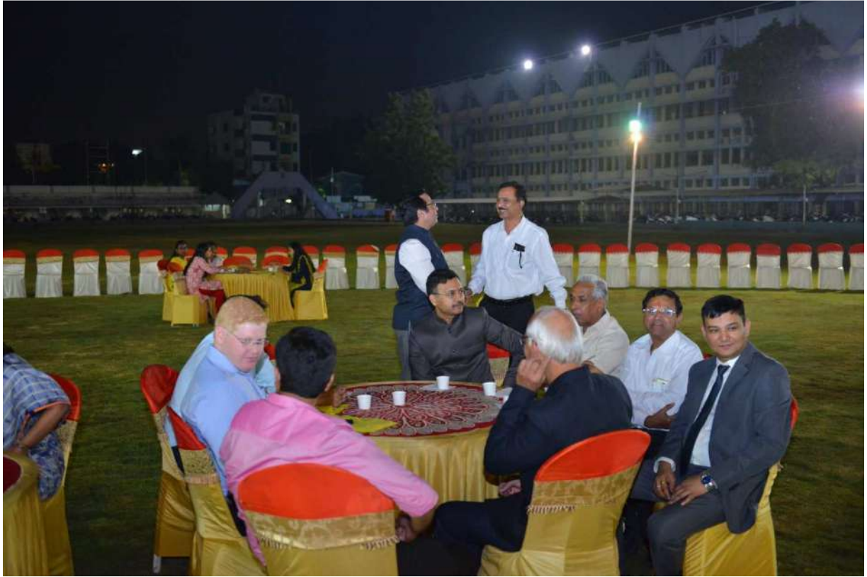
Past and Future in –hands together