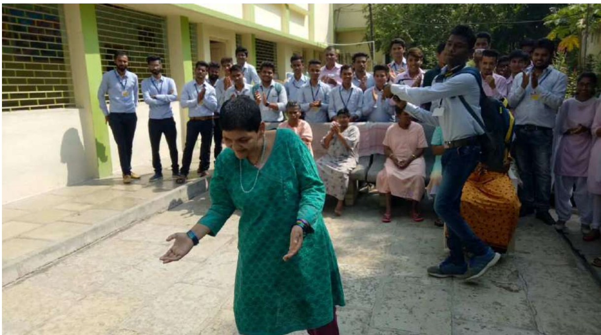
The residents of the old age home performing & sharing the moments of joy with members of GEMS