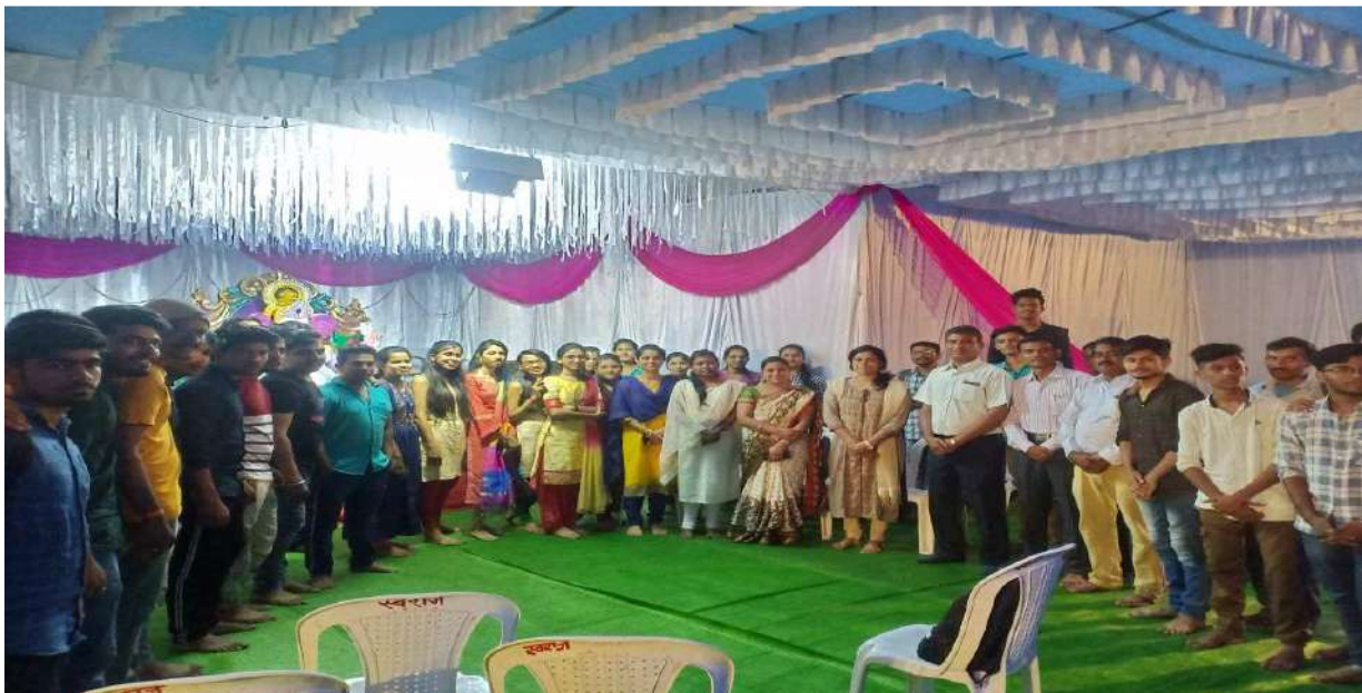
Students and the staff together during the prayer time to Lord Ganesha