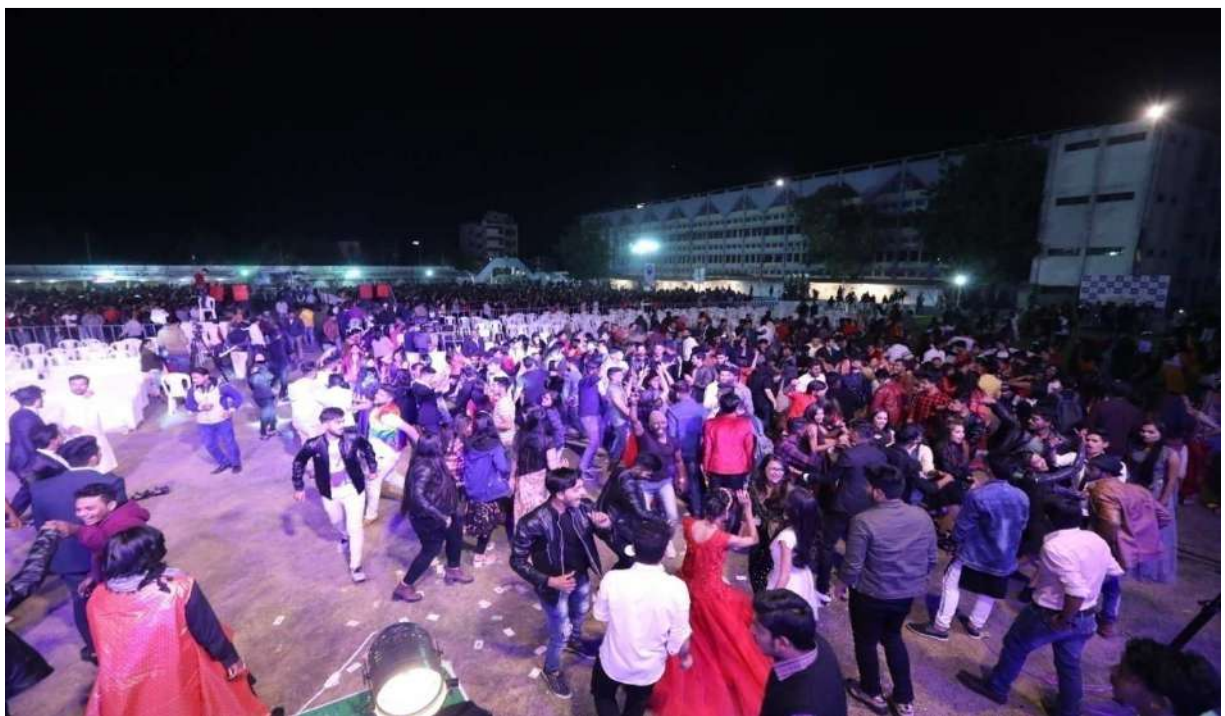
Cultural & Regional Inclusive Environment: An Overwhelming response of the students during the gathering