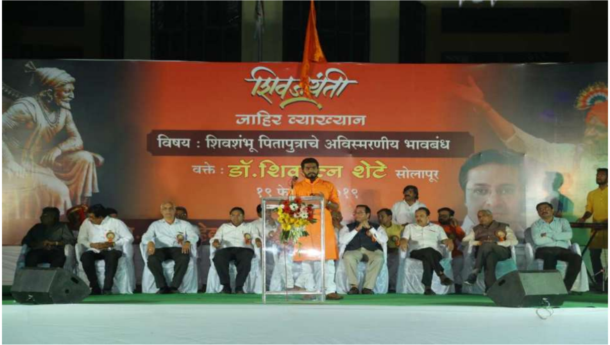
Dignitaries along with the Chairperson & Principal of the college on the occasion of Shivaji Jayanti celebration