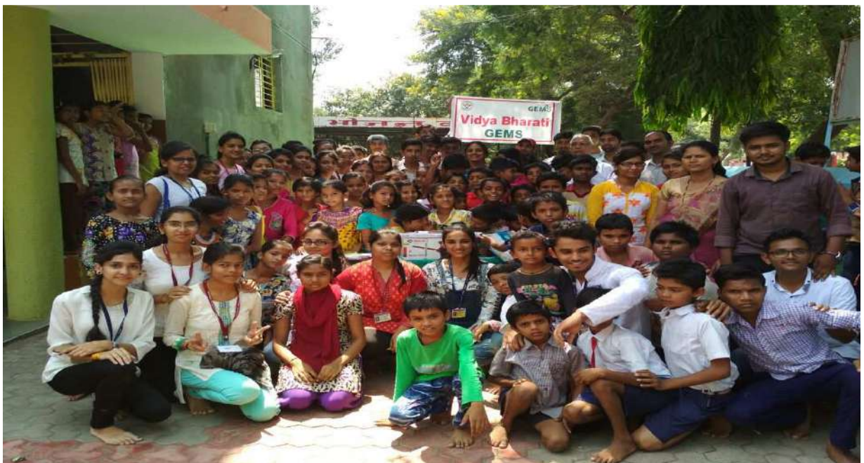
Students at an Orphanage, being run by NGO in Amravati