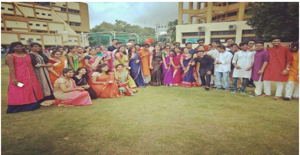
Staff and Students in traditional attires on the occasion of Teachers Day celebrated as Traditional Day