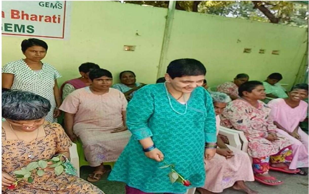
Touching Moments of delight, beneficiaries being welcomed at the Mentally Challenged Persons (Holy Cross Campus)