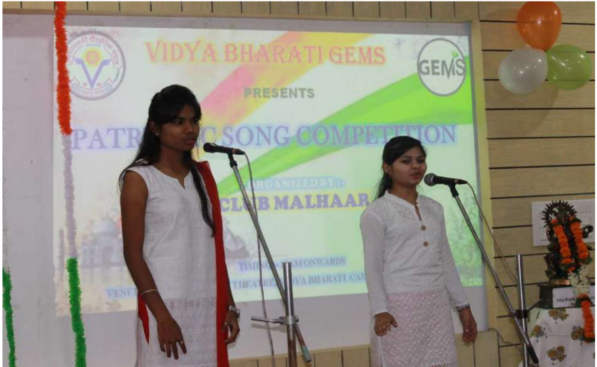
Students performing in Patriotic Song competition