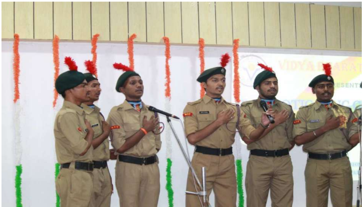
Students' group performance in Patriotic Song Competition