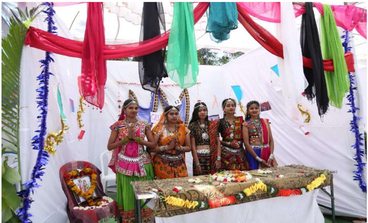
Students displaying their stall in traditional attire at Trade fair