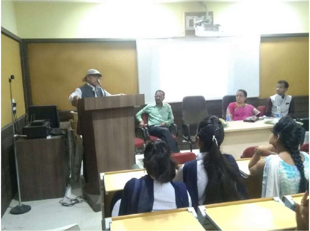
A Guest Lecture organized to mark Marathi Bhasha Day celebrations at E-Classroom of the college.