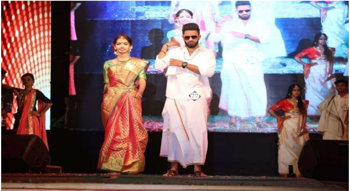
A South Indian Couple in their traditional attire