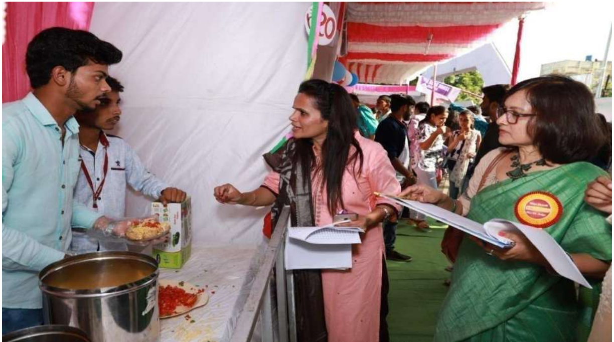
The skills of entrepreneurship of students being adjudged by the Judges at the 'Paanipuri stall' of Trade fair