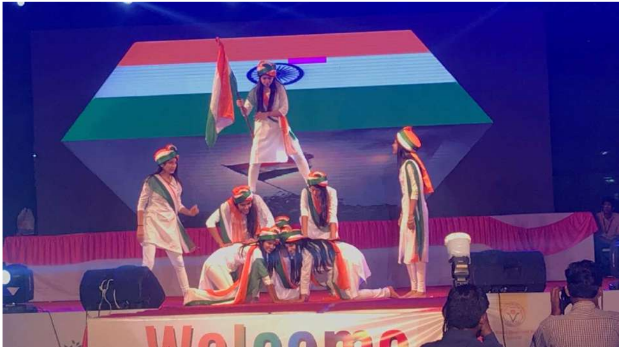
Students performing dance on National Integration: the theme of Annual Social Gathering -JOSH