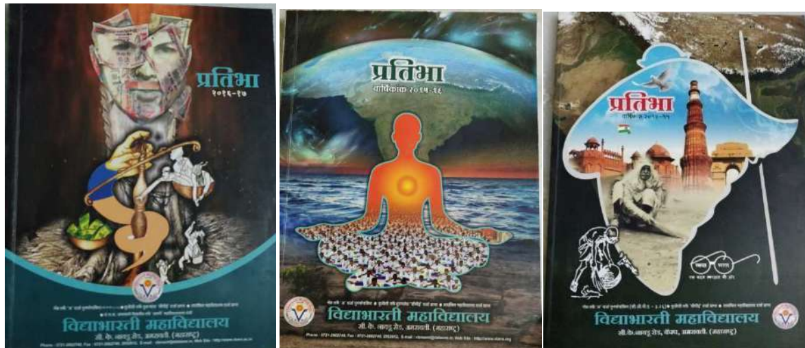
Snapshots of the cover pages of the College Magazine ‘Pratibha’ (Last 05 Years)