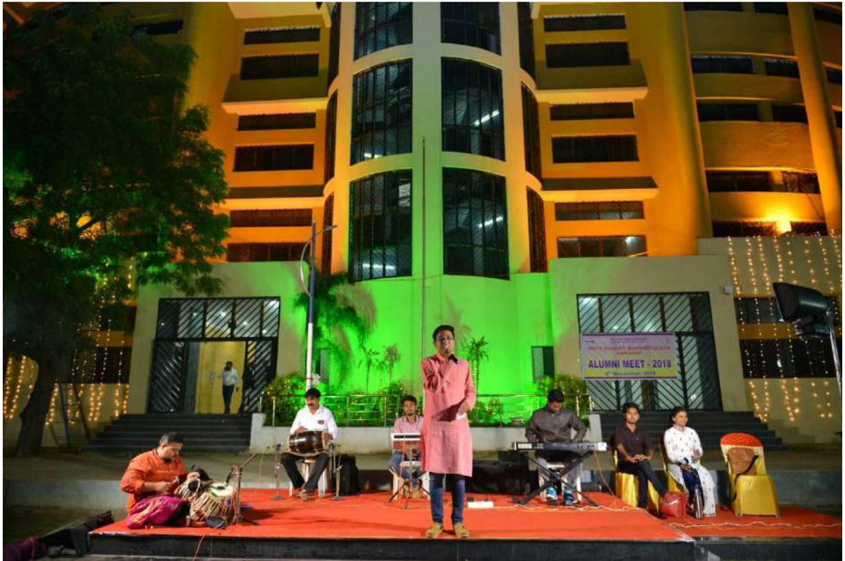
Organization of Grand Dinner along with music and fun