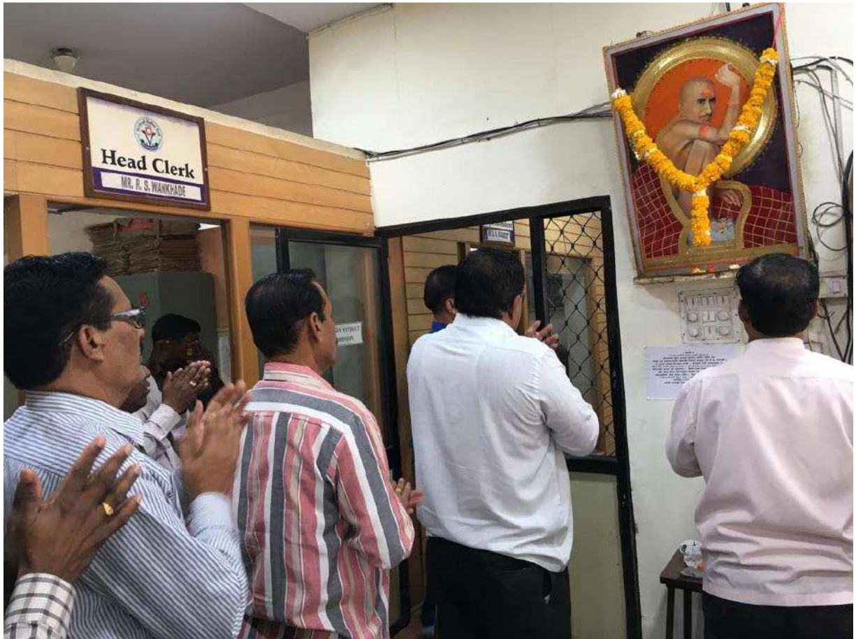
Weekly Gajanan Aarti being performed at college by the office staff