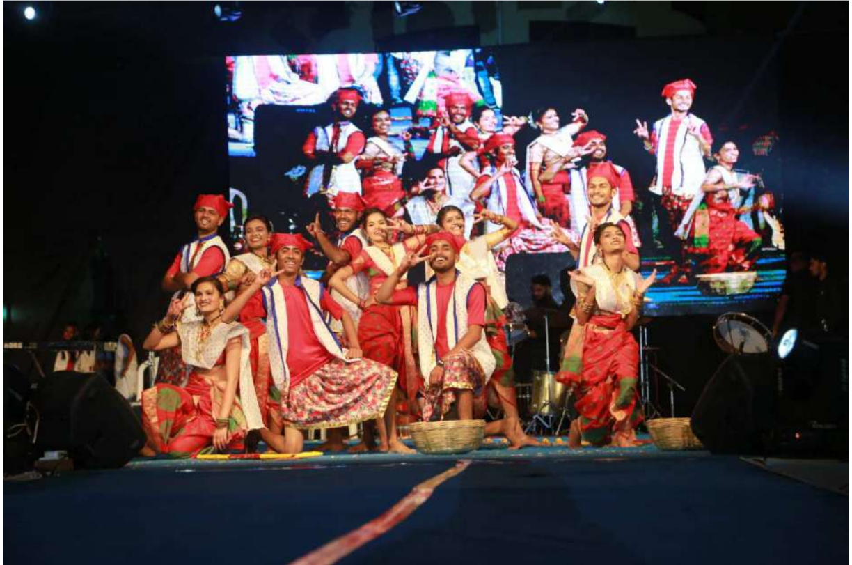
The group of dancers performing a lively and colourful Koli-dance(Folk Dance of Koli Community)