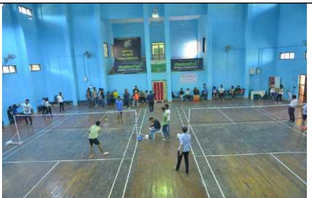
Students' Participation in various Games & Sports