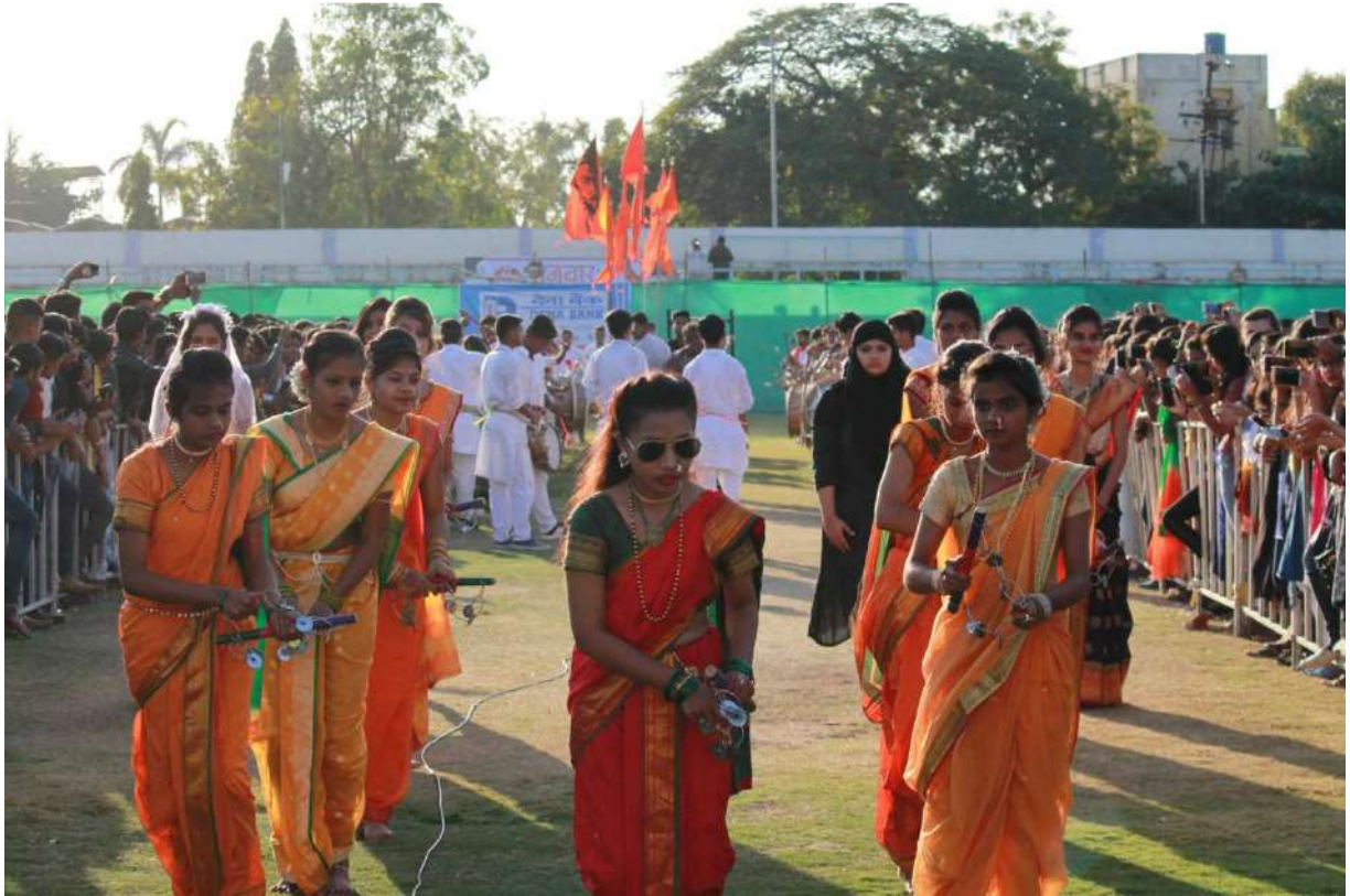
A welcome dance and procession in a typical Maharashtrian Manner: the Lazim Troop