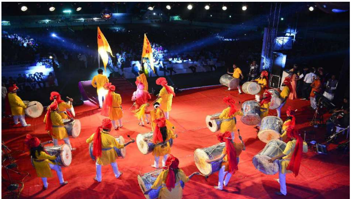
Students performing dance on National Integration