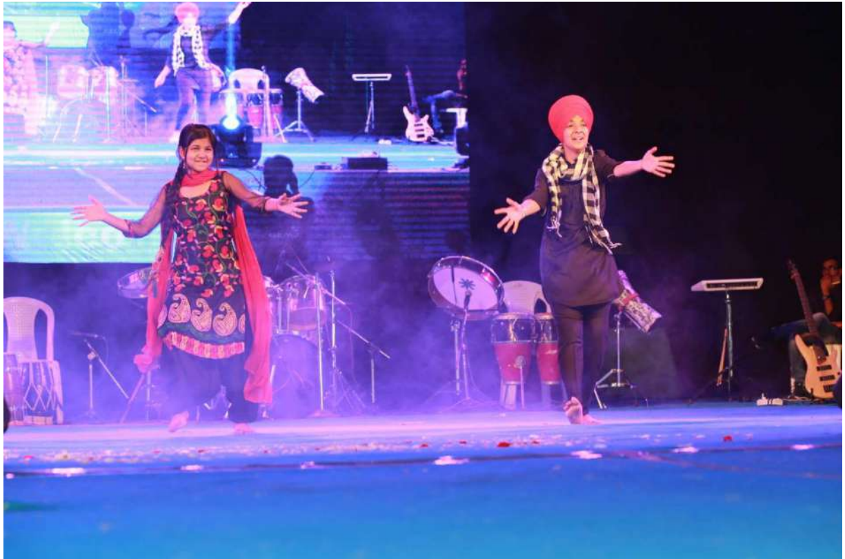
The dance depicting vibrant Panjabi Tradition