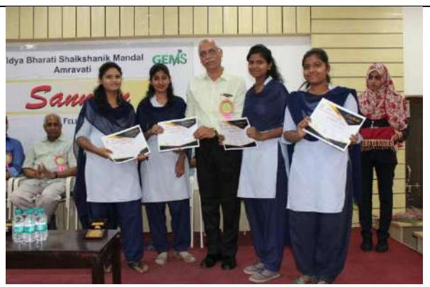
A moment of Pride: outstanding performers in various fields being honored