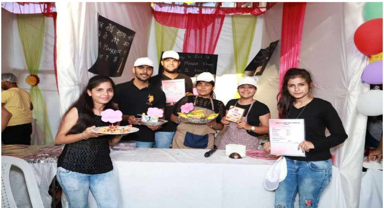
Students ready with their stall for Sell, displaying their dishes during Trade Fair