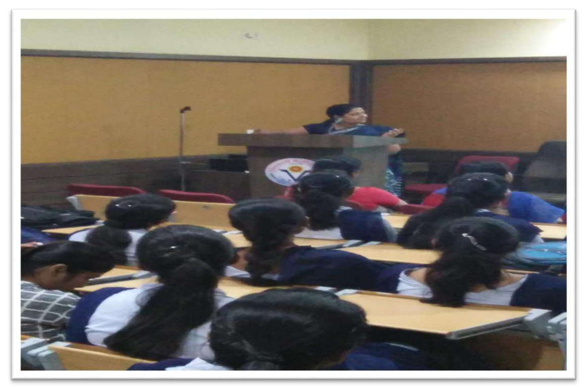
Guest Lecture on National Integration & Inter-Religious Harmony