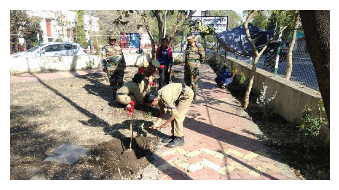
Tree Plantation by NCC Cadets