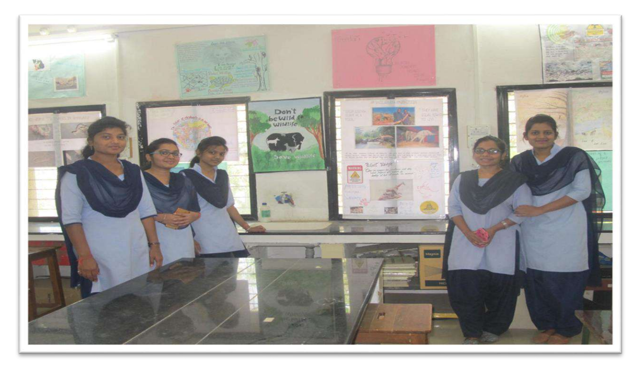
Poster Competition on Wild Life