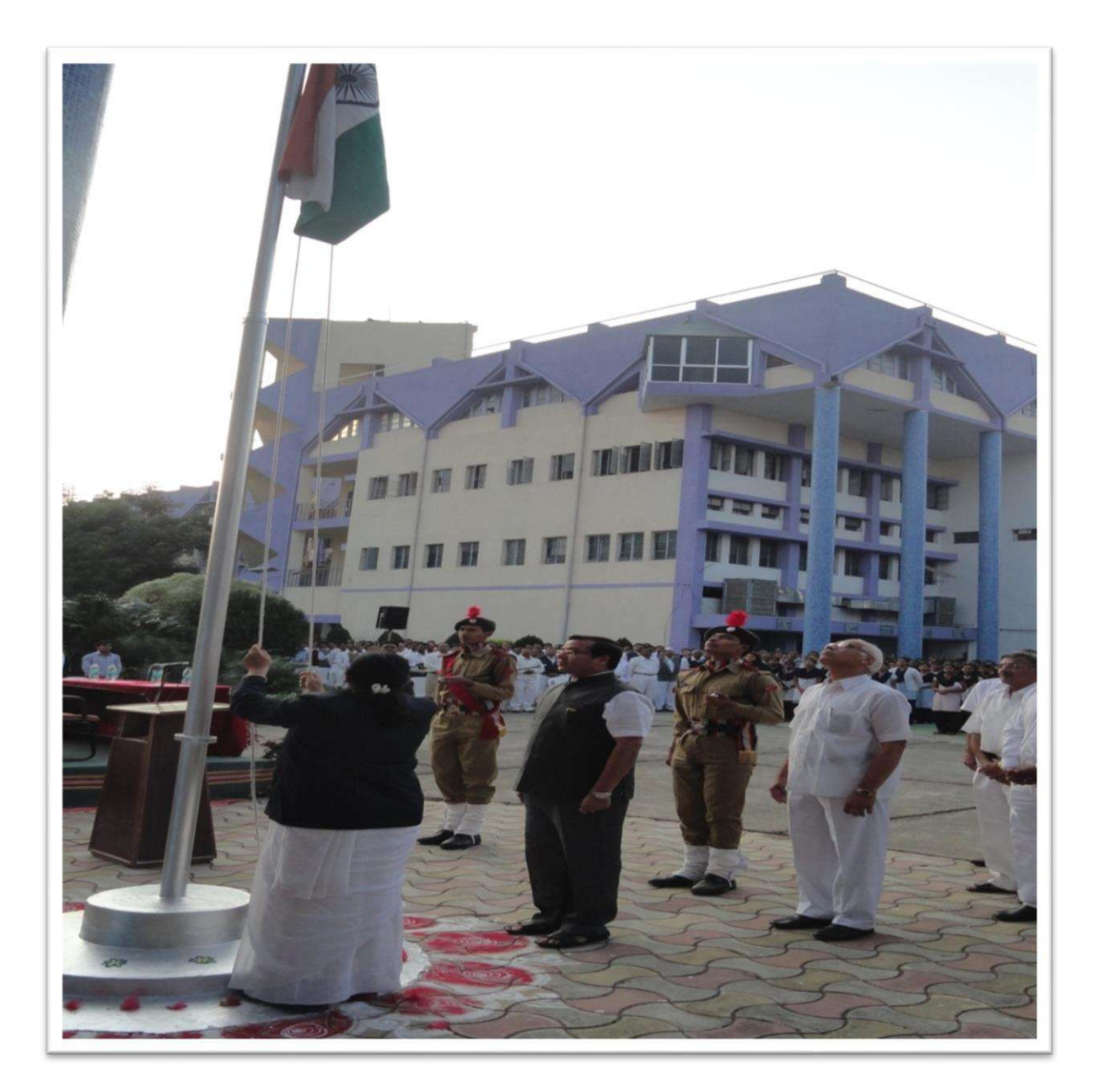
Pride of the Nation: Flag Hoisting Ceremony on Independence Day