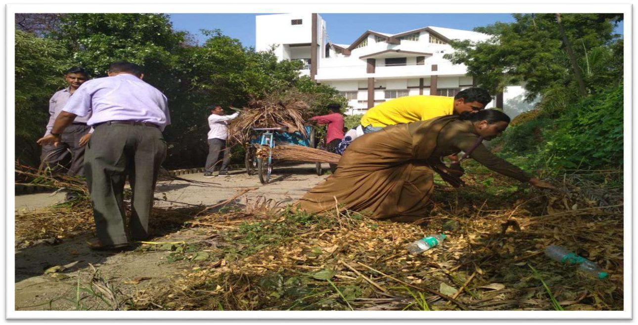
Managing the Waste on the Campus