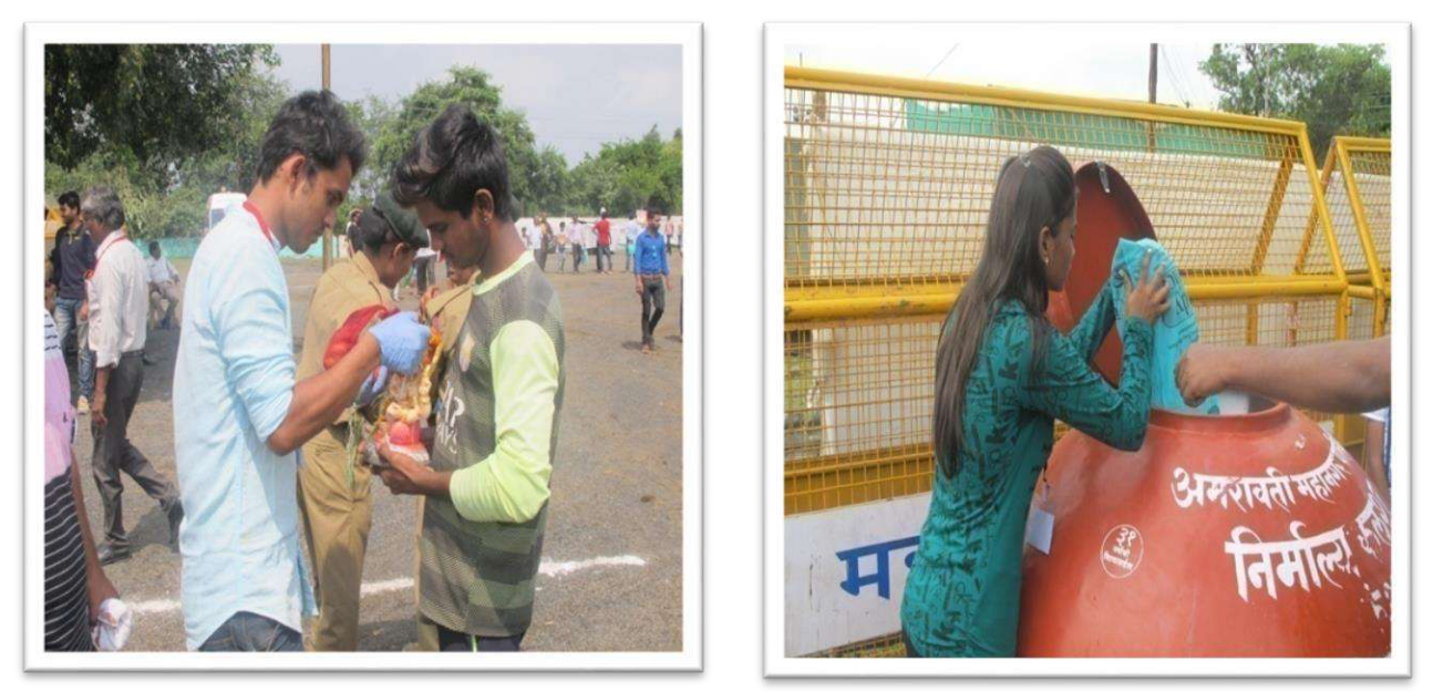
Ganpati Nirmalya Nirmulan Drive during Ganpati Visarjan at Chattri Talao, Amravati