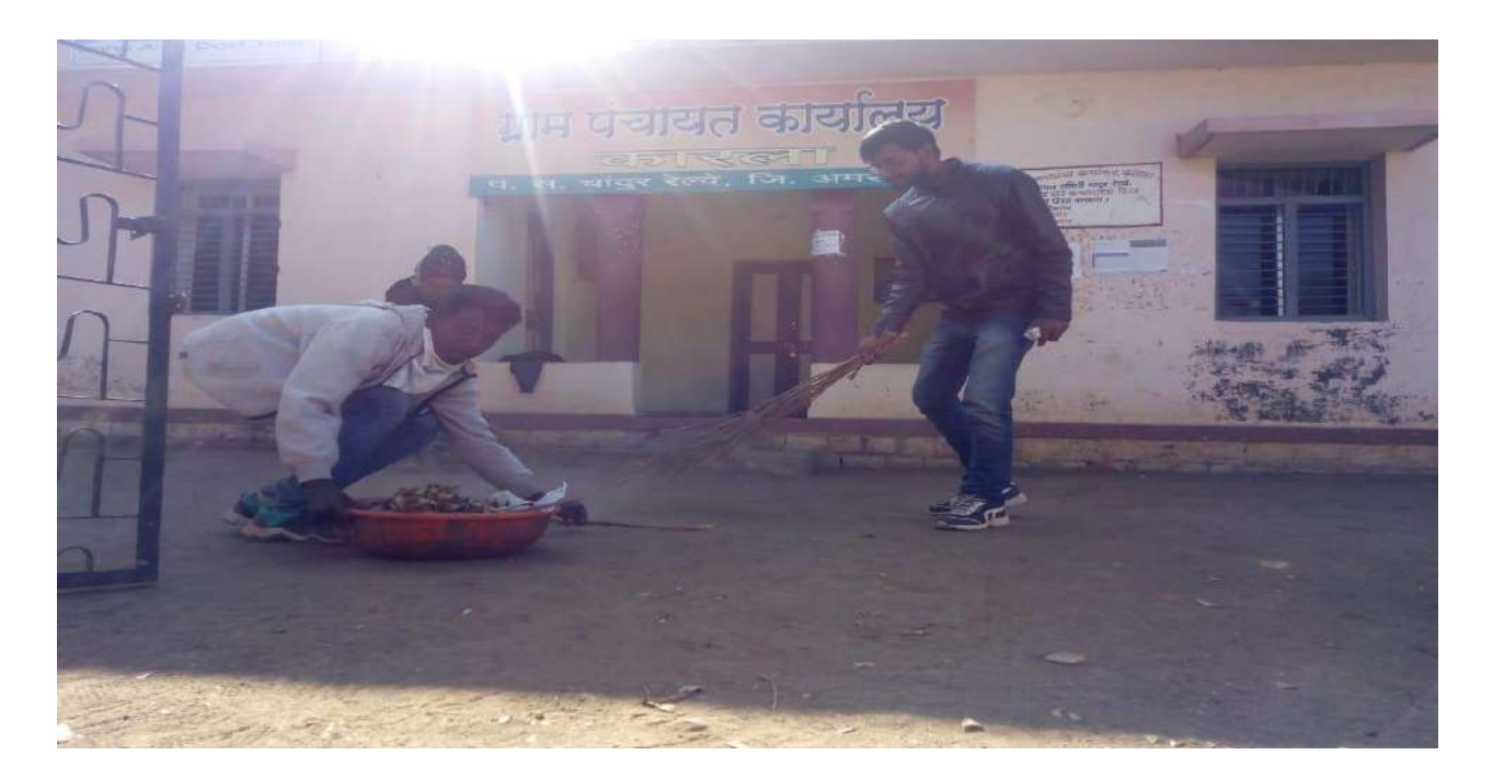
Cleanliness Drive by NSS Special Camp at Karla

Cleanliness Drive: Inculcating the value of Cleanliness through NSS & NCC