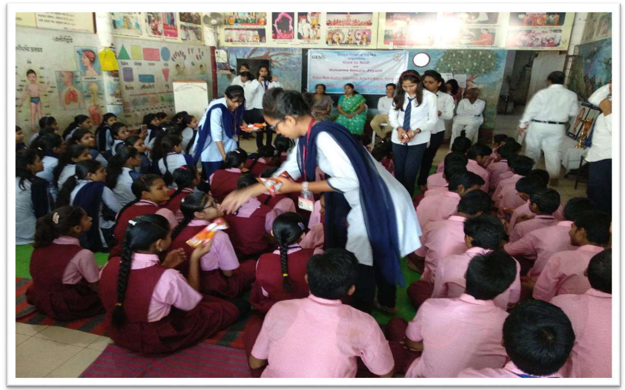
Distribution of Food Packets at Nutan Muk-badhir Vidyalaya, Ambika Nagar, Amravati