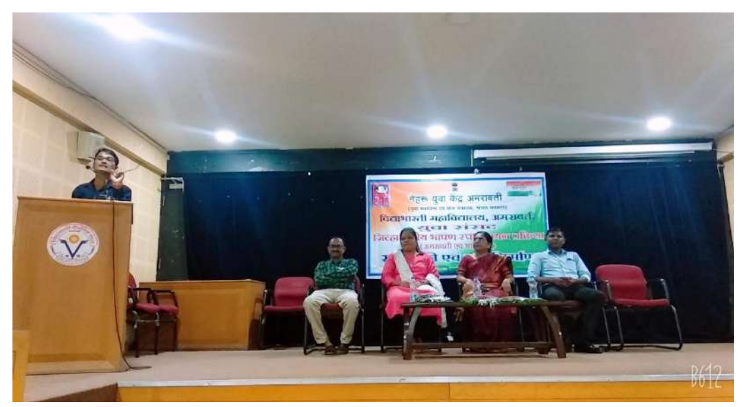
Inauguration of Declamation Contest organized by Nehru Yuva Kendra, Amravati