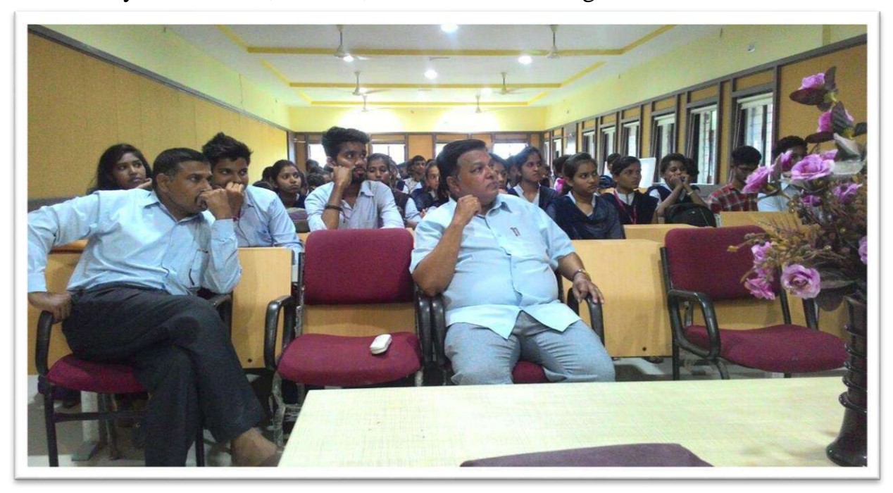
Staff and students attending the programme