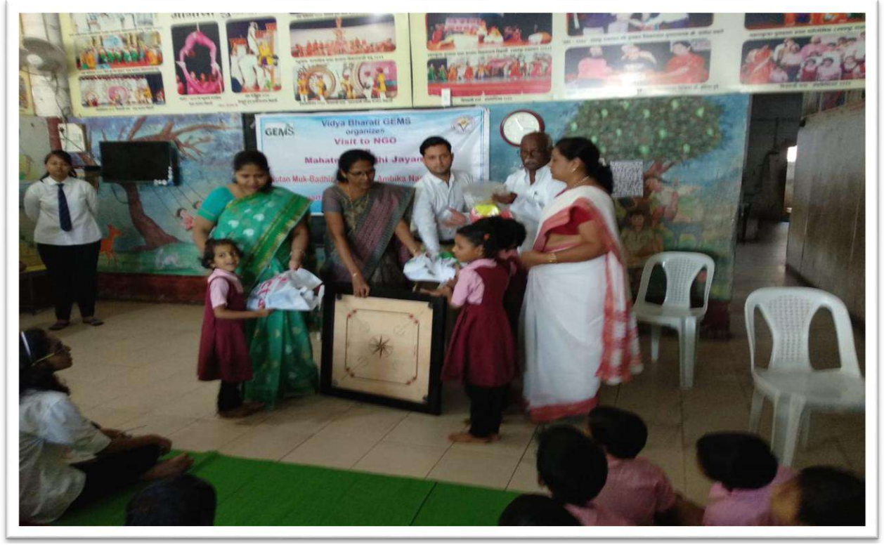
Distribution of Playing Kits to Divyangjan during the visit to the NGO