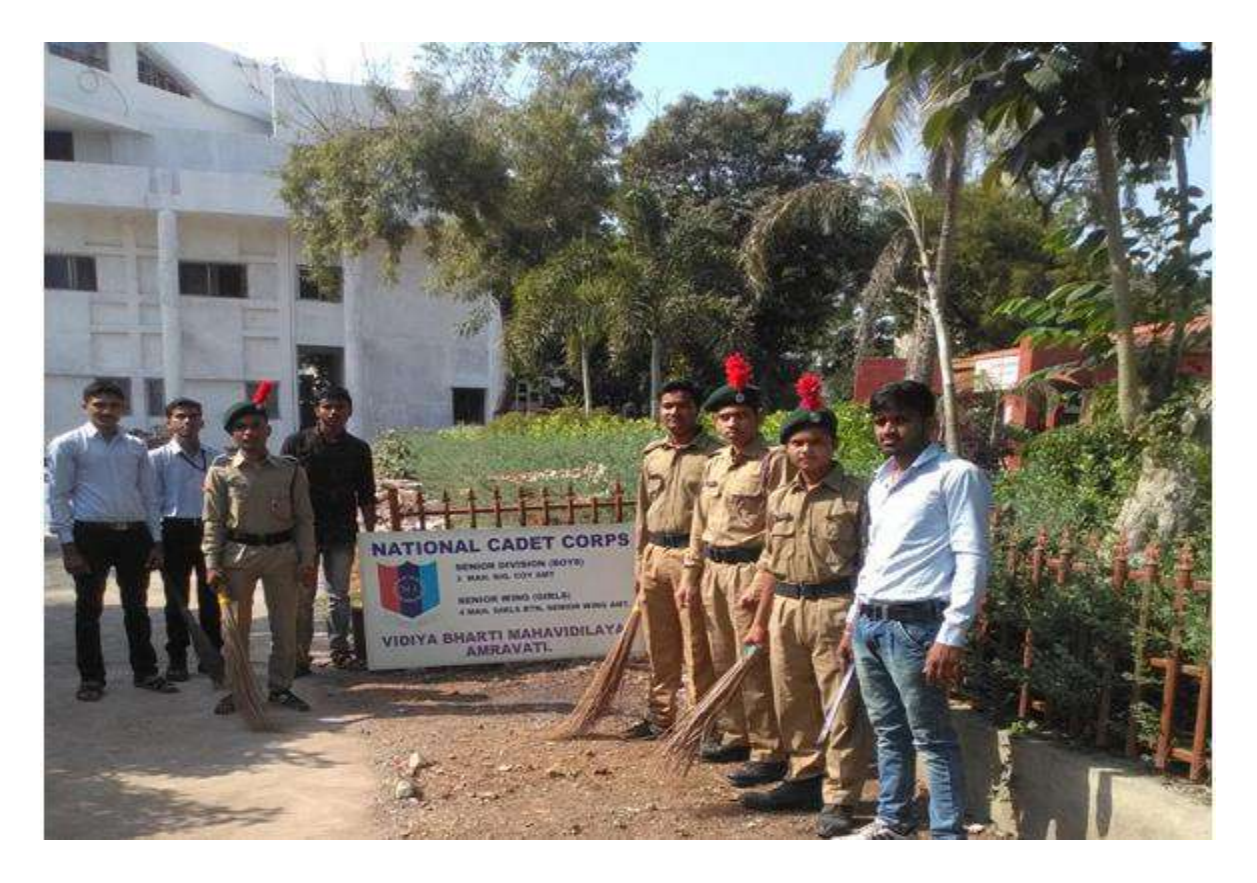
Participation in Swaccha Bharat Abhiyan