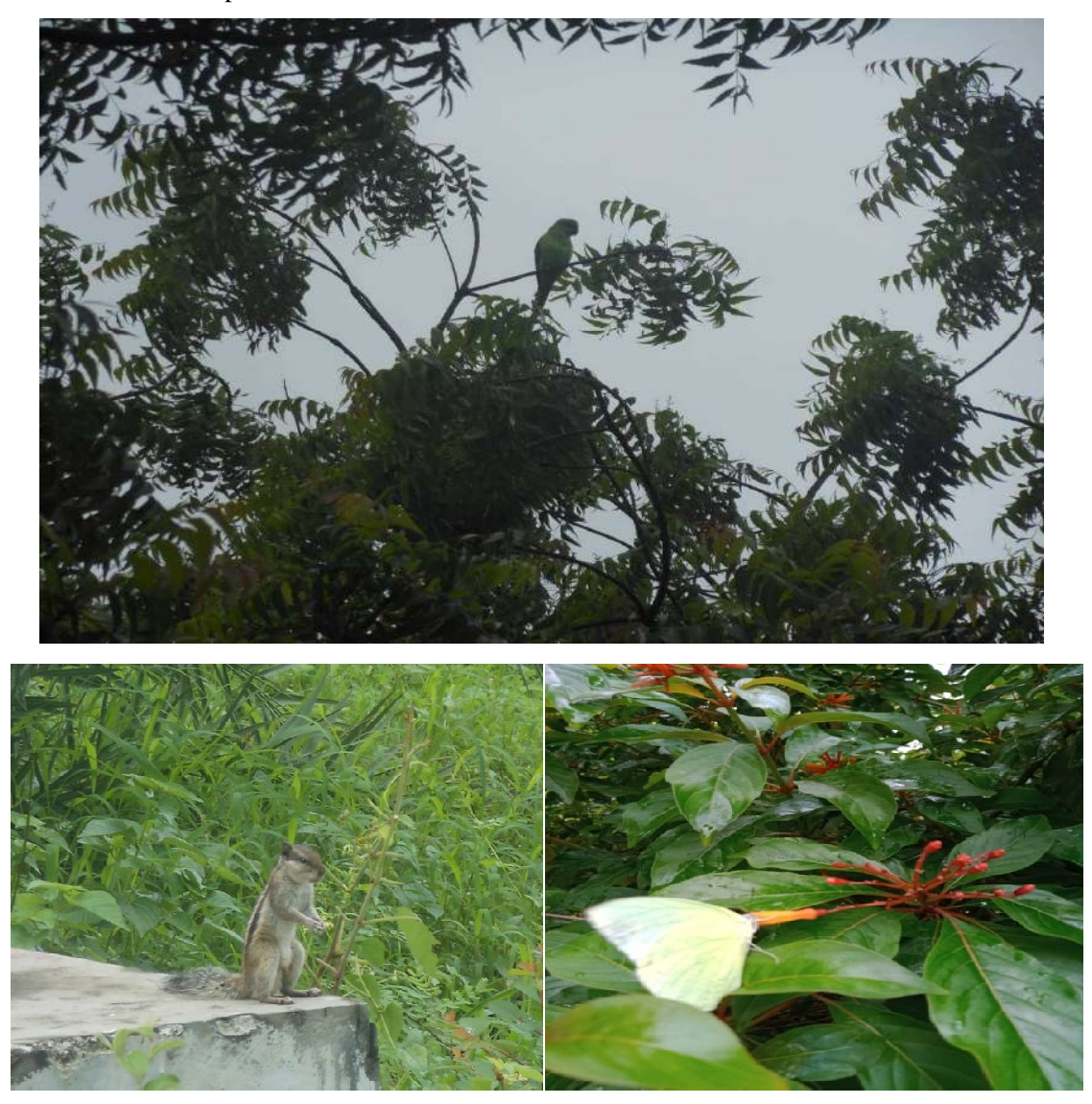
A Snapshot of the diversified habitats on the campus

The biodiversity survey of the campus is conducted to know more about the habitats on the campus and its features, species got surveyed to ingest the biodiversity. To study the environment and its sustainability in the college campus, the Enviro-club conducted the survey on diversity of animals and plants on dated 13/08/2019. The students of Enviro-club along with the teachers identified & classified the plants and animal species. The number of species was counted by the students and observed the food chains of the present in the campus. The total 85 students and 5 staff members took part in it.