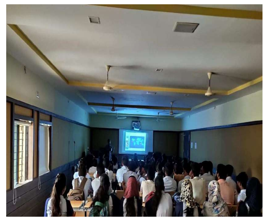
The movie "Save Aarey Campaign, Mumbai" is being screened to protect environment

The documentary screening on save Aarey Campaign was organised on dated 11/10/2019 to aware the students for environment protection by explaining the story of India's only urban forest-Aarey and why it's being cut and how people are protesting its deforestation. The total 85 students and 08 staff members were benefited.