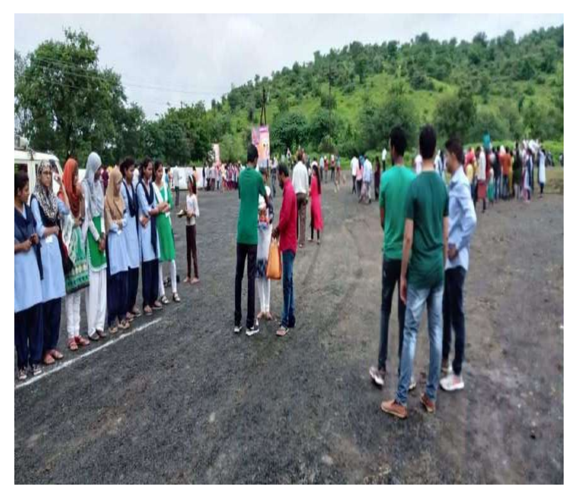
The volunteers of the Enviro Club are seen in groups during the effusion of the Ganesh Idols

To take the steps towards the Clean and Green Society, the Enviro-club organised the cleanliness drive during the Ganpati Visarjan Festival on dated 12/09/2019. In Amravati during this festival the worships materials along with Ganpati Idol were thrown into the Chatri Lake and disturb the aquatic ecosystem. The Enviro-club collected these materials in separate tank and disposes it properly. The total 71 students and 09 staff members were participated.