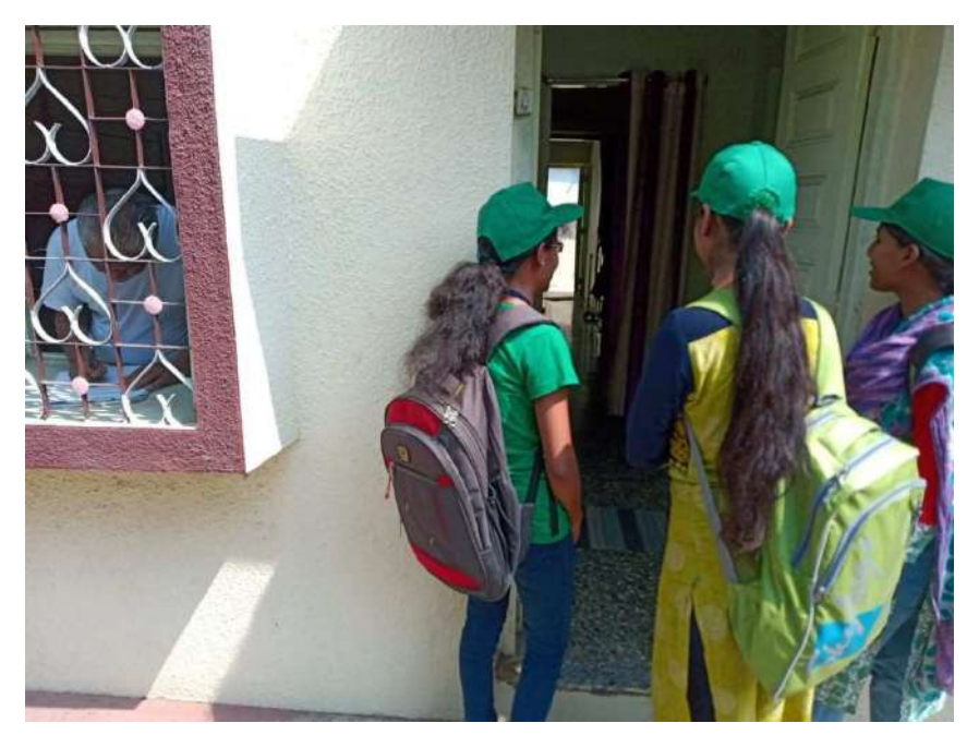
A team of volunteers at the door step of a colony dweller: conducting the survey

To create and evaluate a green building education and the awareness of the society towards the green practices applied in their households, the Enviro-club organized the house hold survey on "Green Literacy Programme" on dated 11/10/2019. This survey was conducted in different areas nearby the college campus like Suyog colony, Christ colony, Keshav colony and the State Bank colony. The total 70 students and 08 staff members were involved in the survey. The outcome of survey is that the people acquired knowledge regarding the burning ecological concerns and promised to adopt eco-friendly practices.