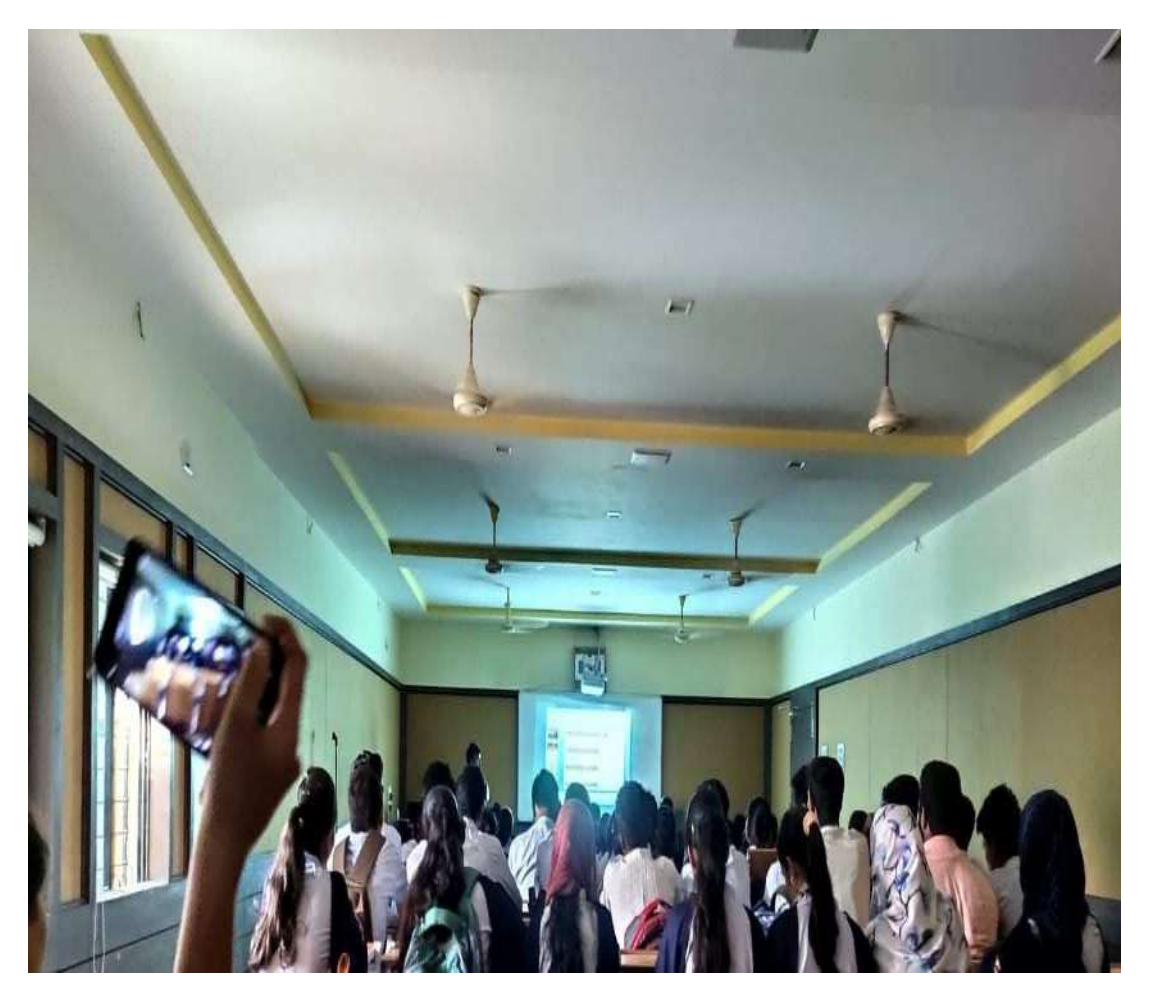
The documentary is being screened

The screening of the documentary on Devastating Palm Oil Industry was organized to make the students aware on environment and its crisis on dated 24/08/2019. A half hour documentary produced by the year's project starring the famous Hollywood star Harrison Ford was screened which emphasized on investigating about palm oil industry in its roots i.e. the palm oil manufacturing mills in Indonesia. Total 65 students and 04 staff members got participated and benefited.