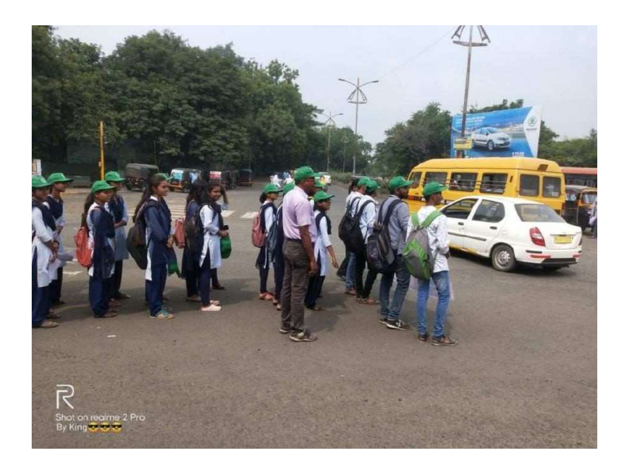
The Street Rally on "Celebration of Green Diwali" crossing the square

Diwali, the festival of lights and the firecrackers brings the concern of rise in pollution. Therefore, to tackle post-Diwali effects of the increased carbon in air and the low level of oxygen caused grave impact of pollution on the life. So to celebrate pollution-free Diwali festival, Enviro Club took initiative and organized Street Rally on "Celebration of Green Diwali" on dated 17/10/2019 to sensitize the public. The Enviro club took a long march from the college campus up to Adivasi Nagar. The Students also interacted with the locals of the said residential areas and handed out the pamphlets which contained scientific information about abuse of the fireworks. Total 85 students and 03 staff members participated the event.