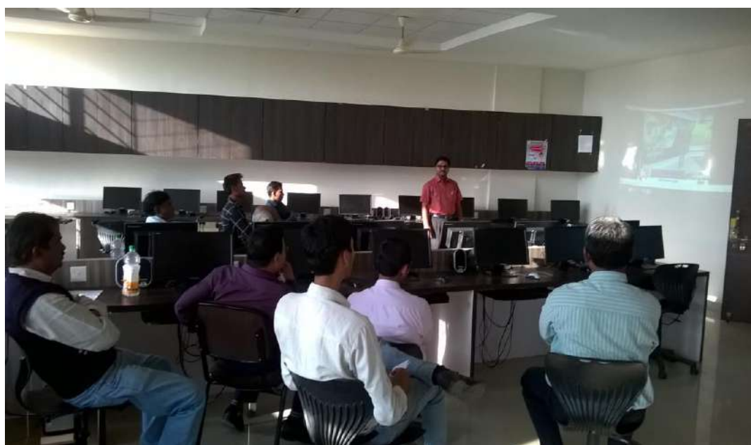
Workshop on “Cashless India”