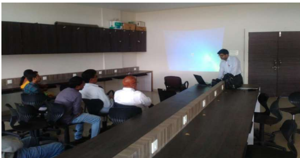
Workshop on “Cashless India”