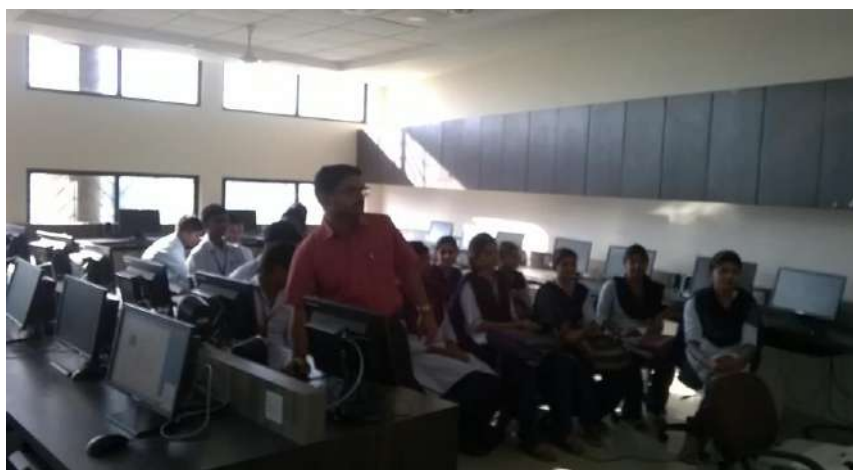
Workshop on “Internet: Scope, Use and Advantages”