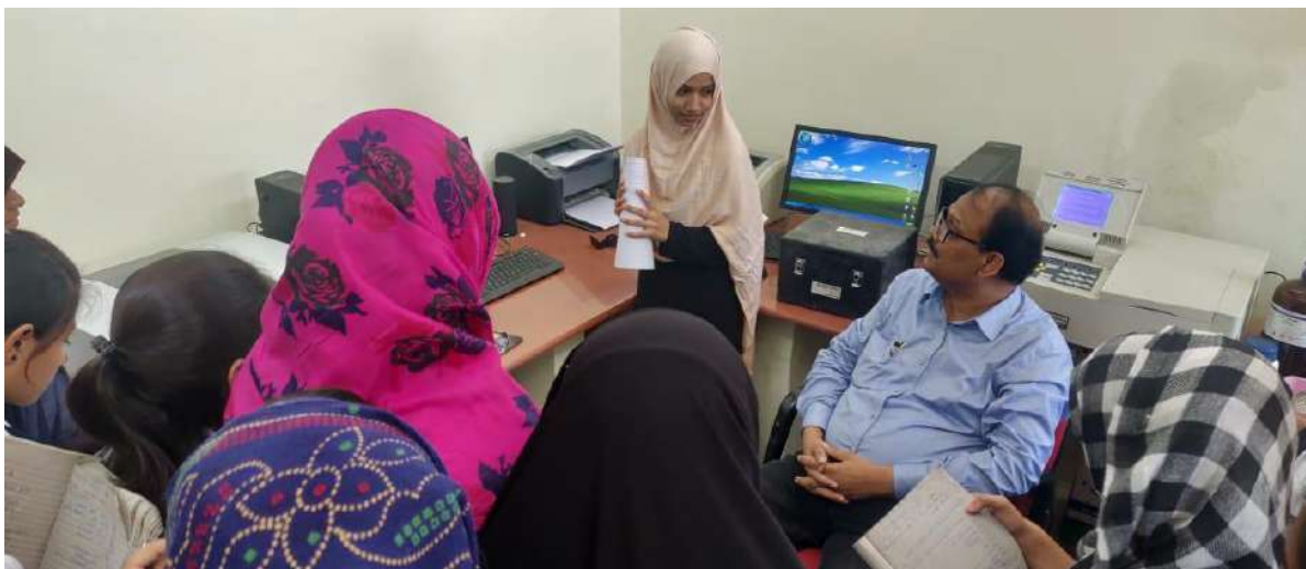
The students learning the functioning of FT-IR instrument