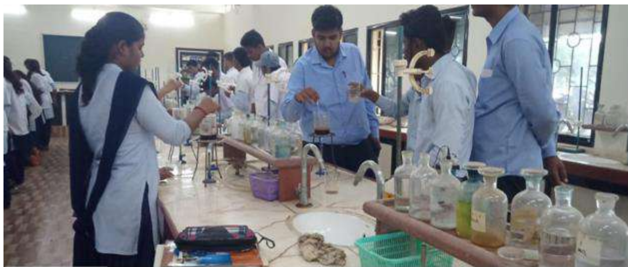
Teacher demonstrating the correct method to handle chemicals

A workshop on 'Safety and Chemical Handling' was held on 06 th September 2014. The students learned the safety measures, which should be followed while performing the practical in the chemistry laboratories.