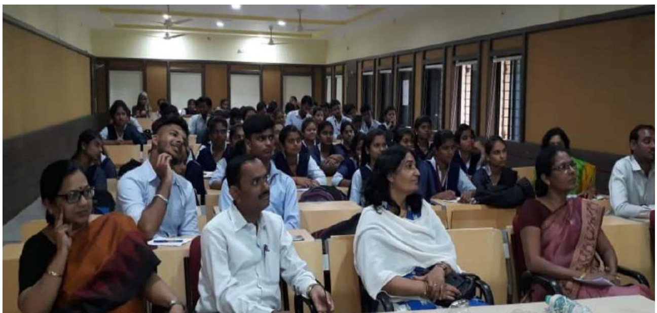
Students and faculty members present during the lecture