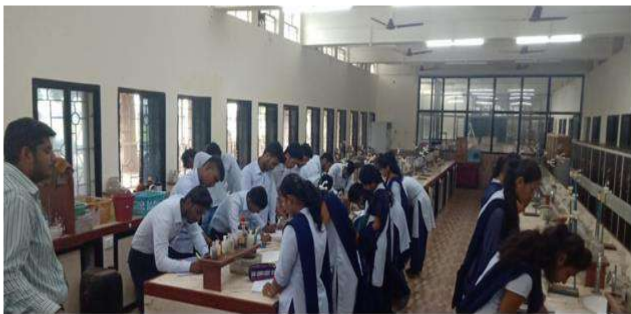
The Students learning the skills to handle the chemicals