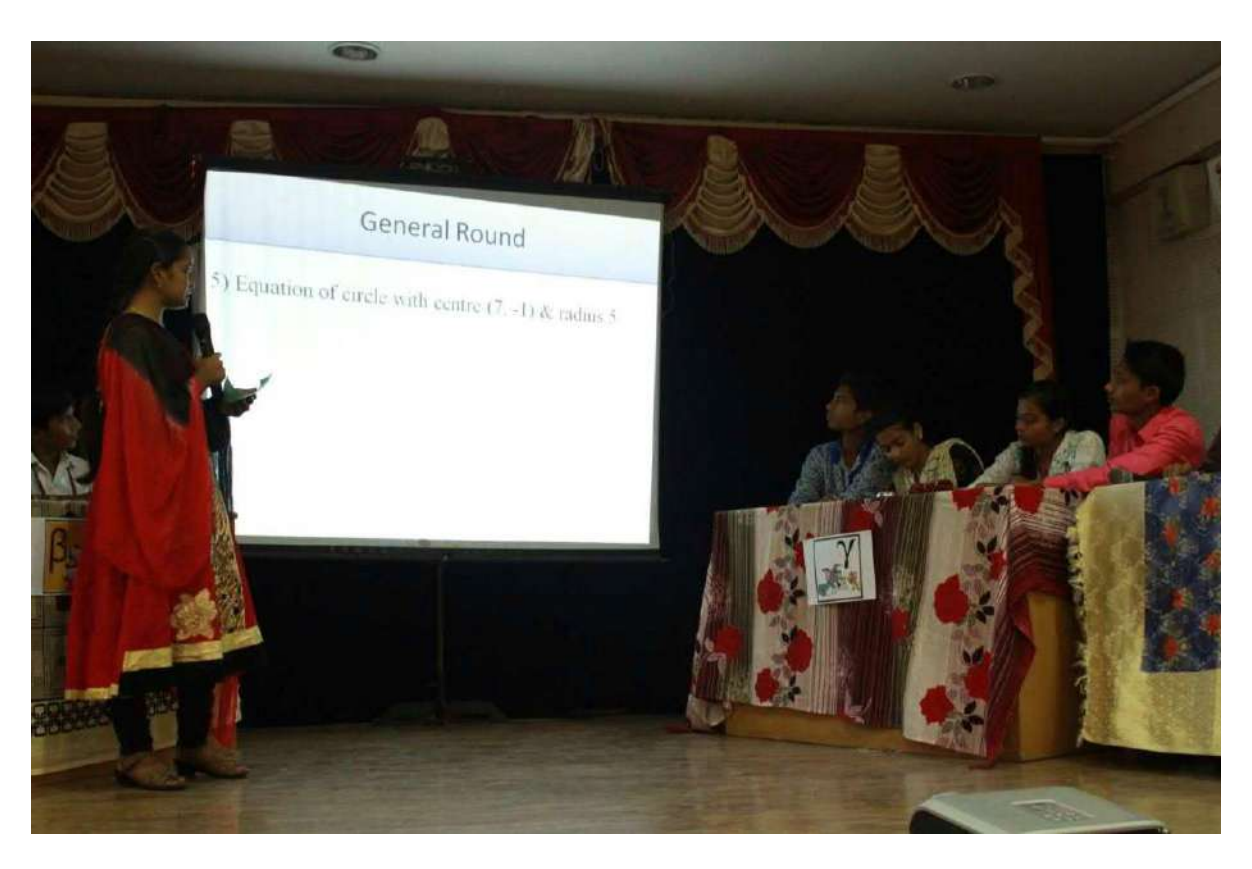
Students solving questions in quiz competition, AV Theatre of the Main Building