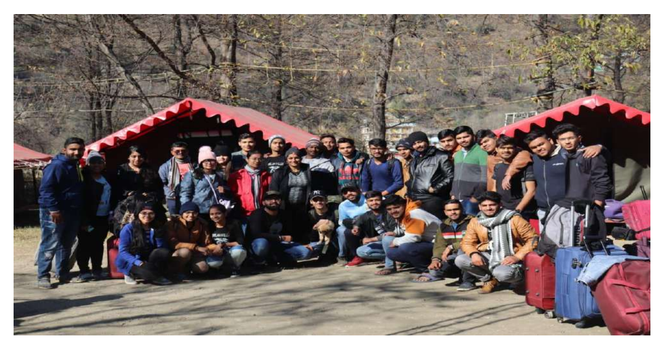
Subject tour: on way to Bangalore

Educational tour was organized on 28<sup>th</sup> Sept. 2016 to provide exposure, to the practical world.