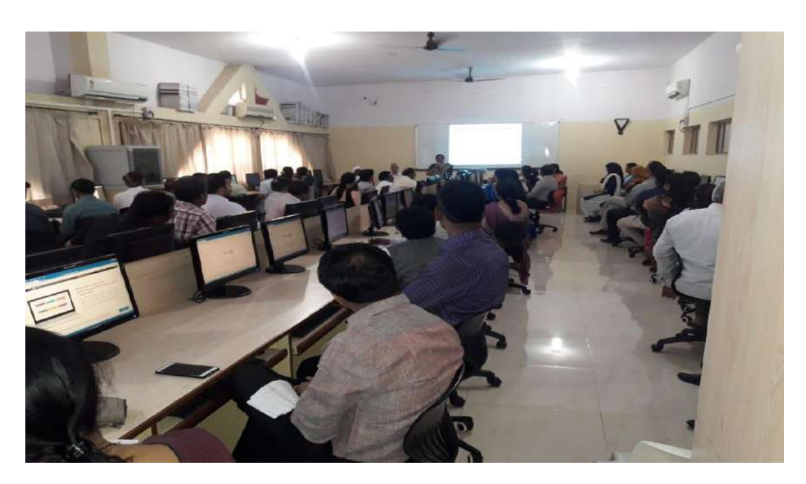
Google Classroom is in session