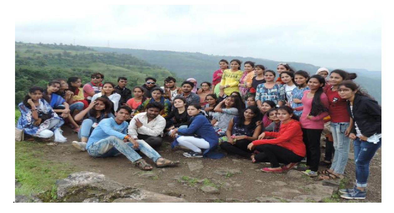
Study Tour at Melghat to enhance knowledge and learning experience of the students

Students from Department of Botany visited Melghat, a nearby place with rich flora and fauna, on 1<sup>st</sup> Sept. 2018. The tour was organized to provide students with experiential learning. It enabled the learners to collect rare botanical species to study the behavioral pattern of the plants.