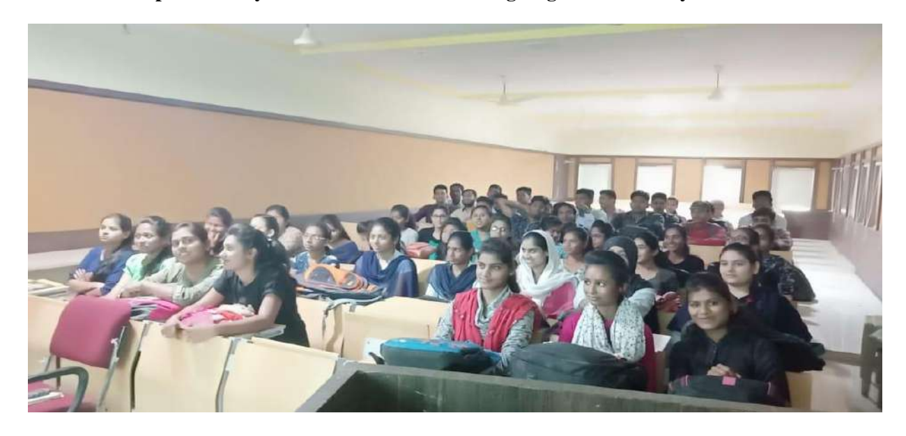
The students acquiring the skills to solve Organic Chemistry Problems