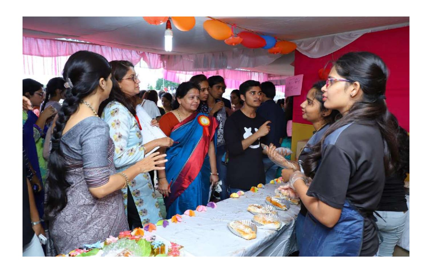
A team of judges adjudging the stall of the students in the Trade fair

The advanced learners of the college are encouraged to participate to learn entrepreneurial skills during the Trade Fair.