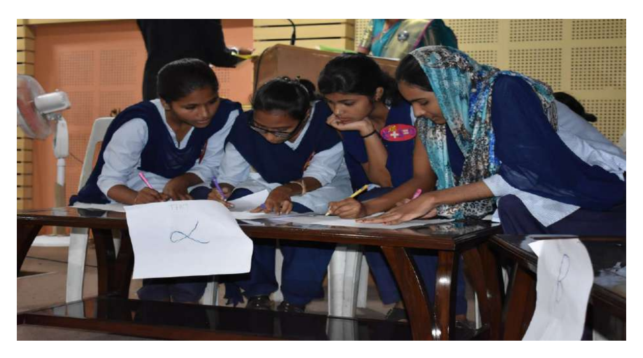
Students discussing and solving the problems in Quiz Competition