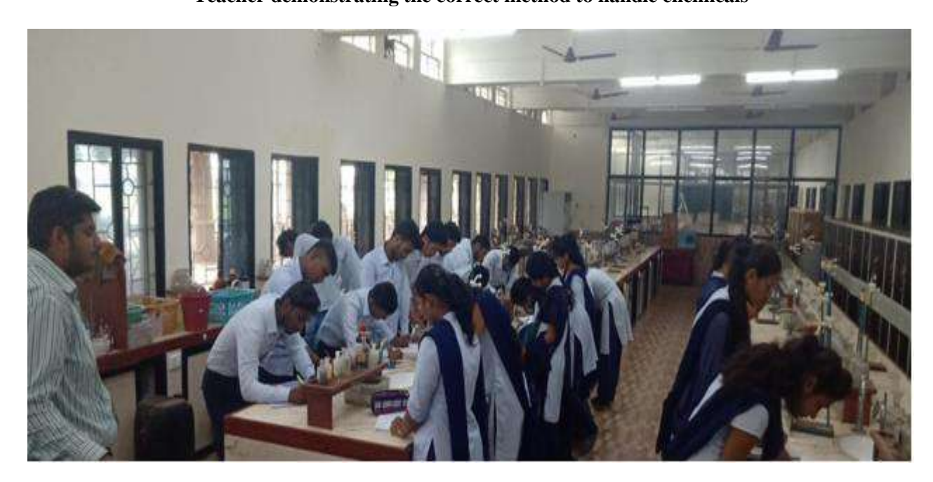
The Students learning the skills to handle the chemicals