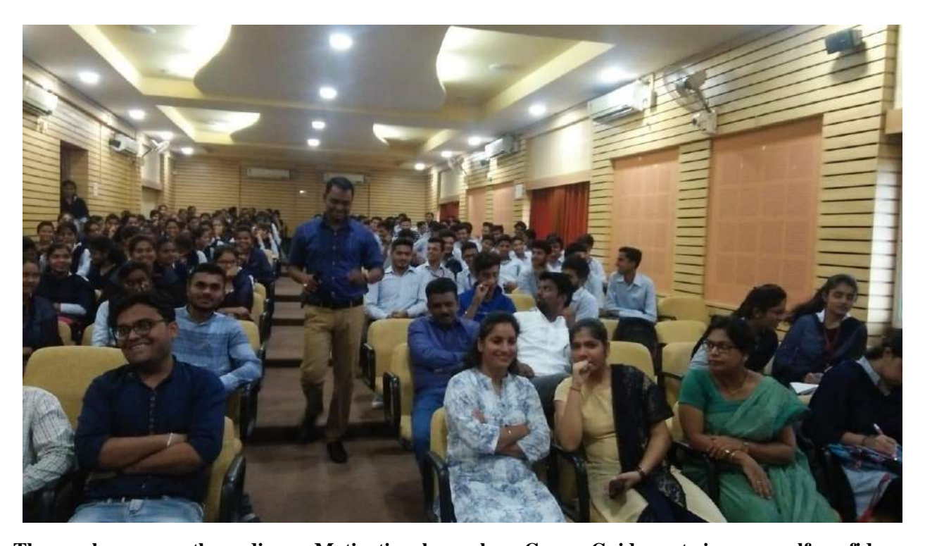
The speaker among the audience: Motivational speech on Career Guidance to increase self-confidence among the students