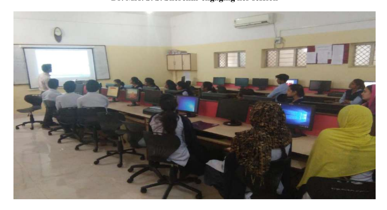
Students & faculty members acquiring the skills to use Google Classroom