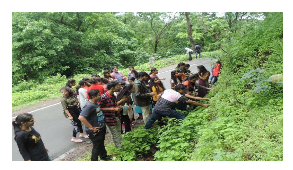
Students collecting herbs during their visit to Melghat