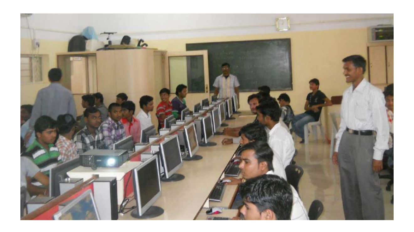
Student performing the given task on Current Technology to raise their skill level

To fill the gap between the latest technologies and curriculum the college organized a workshop on Current Technology on 03<sup>rd</sup> August 2016. The students were provided hands on training to acquire technical skills.