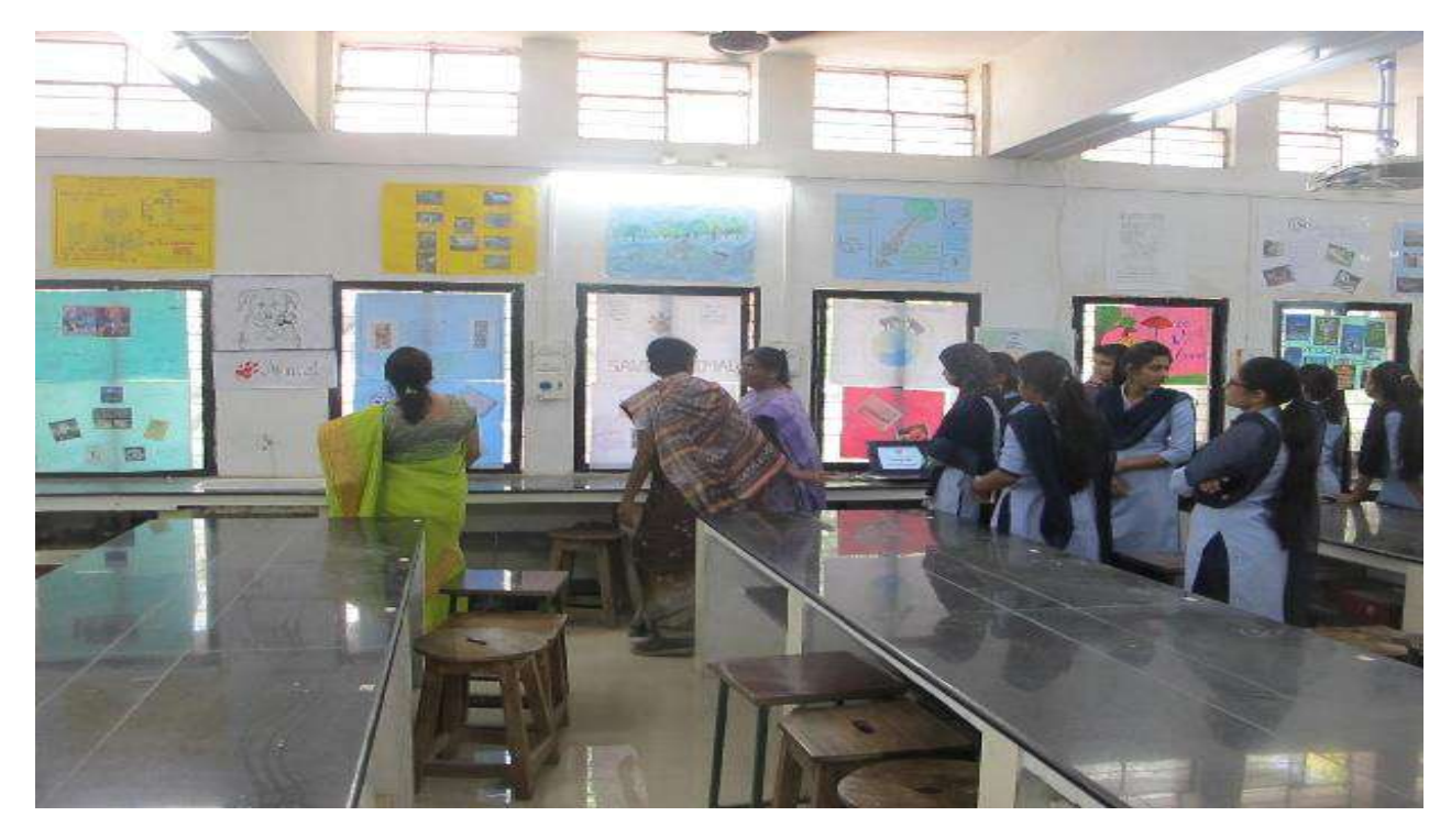
The faculty is observing the posters displayed by the students

The event organized on 18<sup>th</sup> Feb, 2017 to provide platform to develop presentation skills and enrich the knowledge of learners.