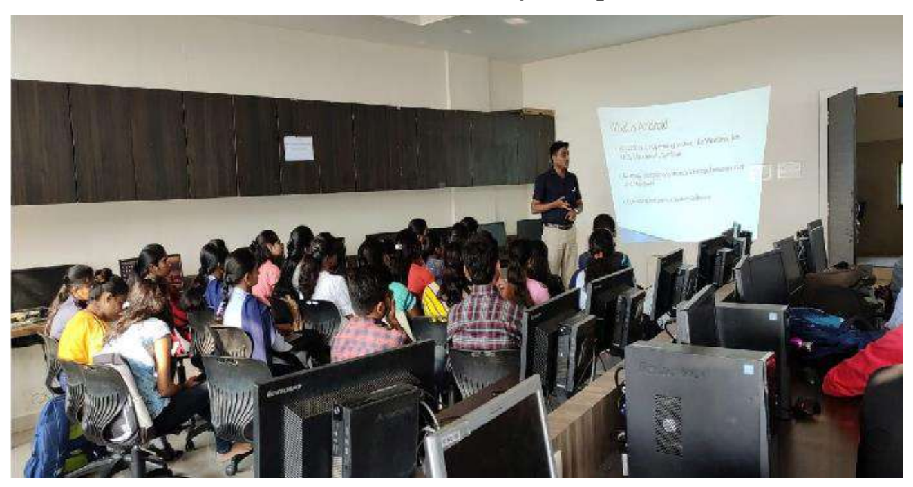
A group of advanced learners clearing their doubts in an interactive session