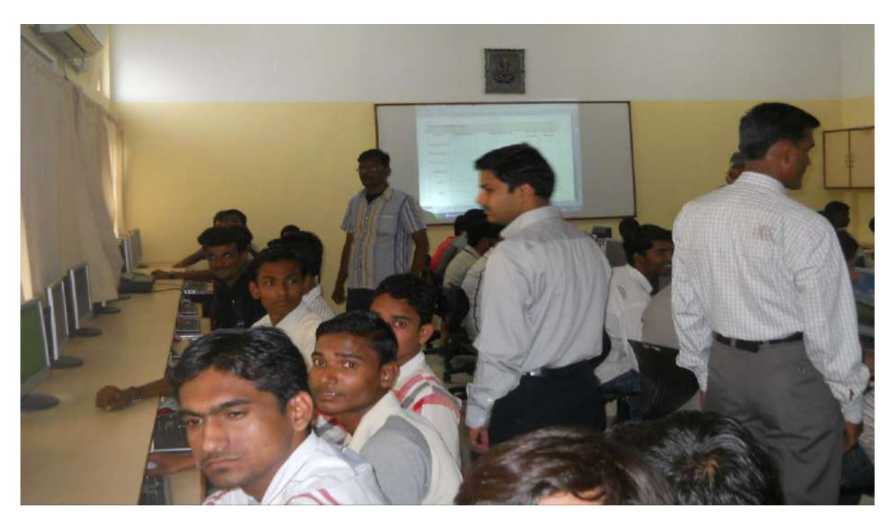
The students acquiring technical skills