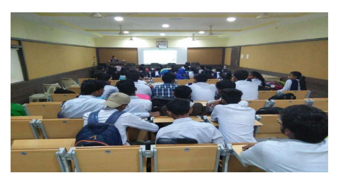
The students present during the talk