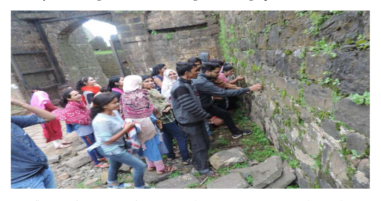
Students of Department of Botany collecting rock based Moss, a botanical specie