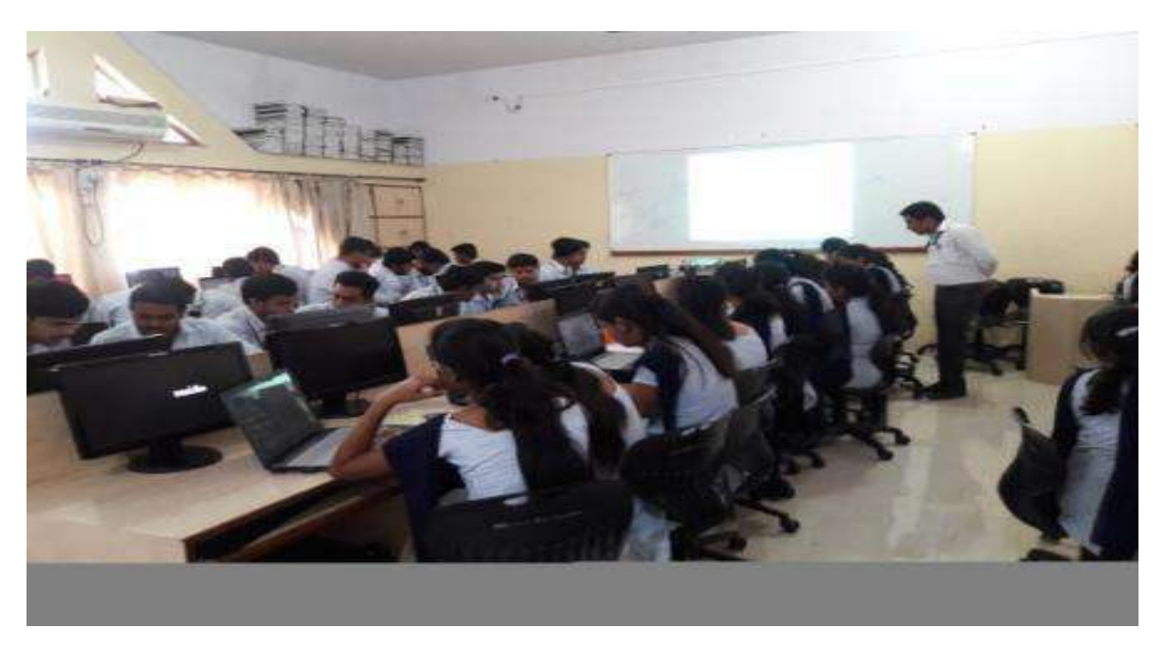
Students performing the given task of Technical Event to improve their technical skills