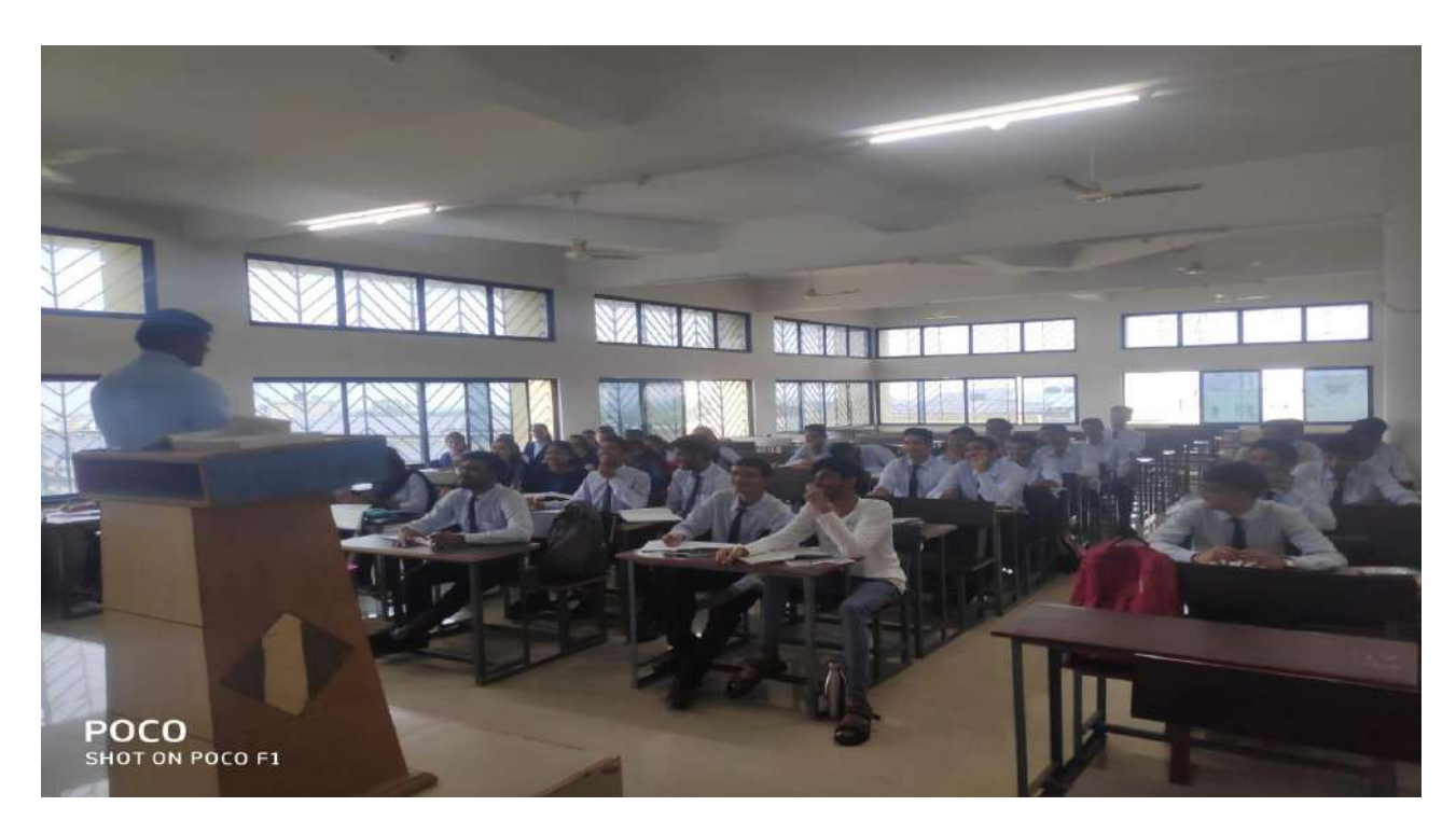
The students of the Management Studies getting tips to understand complexities of administration