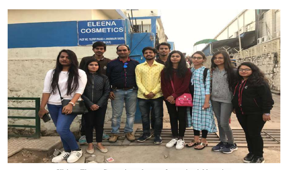
Visit to Eleena Cosmetics: a lesson of experiential learning

The department of Cosmetic technology organized a visit to 'Eleena Cosmetics', Solan, Himachal Pradesh in September, 2015.