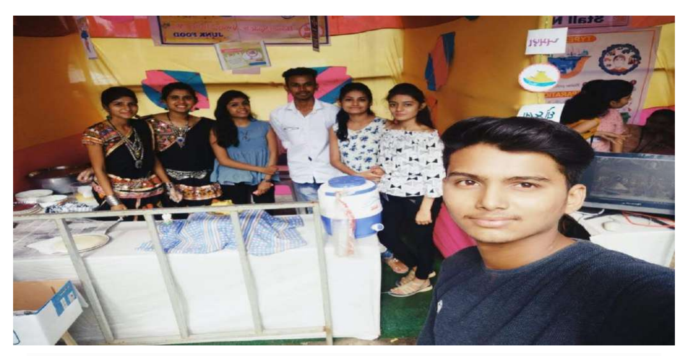
Students participating during Trade Fair to have better understanding of skills required for running business