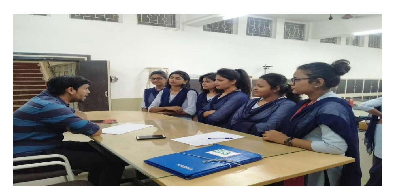
A group of student clearing their doubts on the topics taught