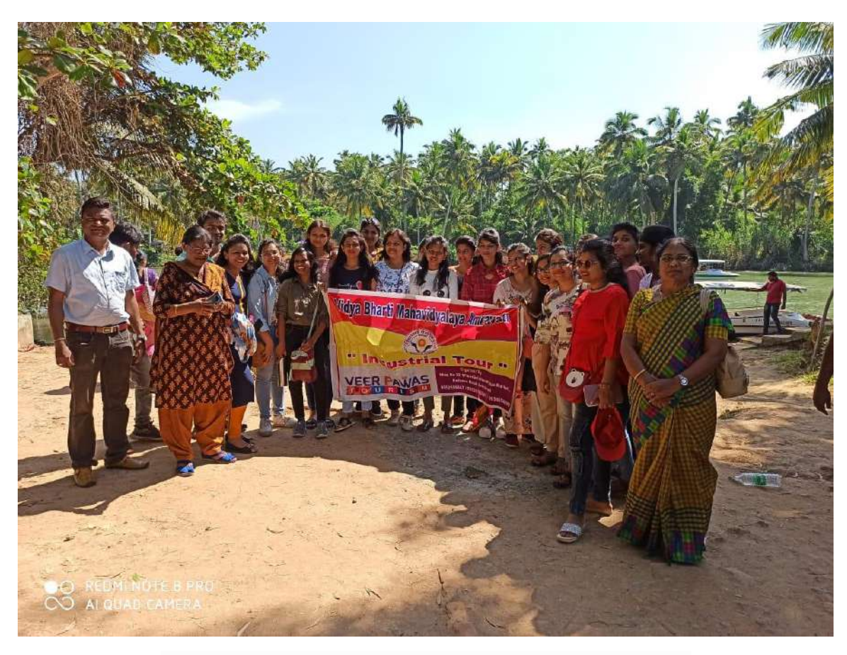
Study tour to Chennai organized by Department of Zoology