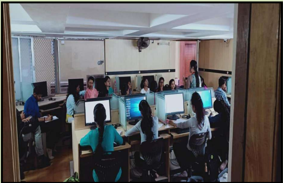
Students attending Language Lab sessions