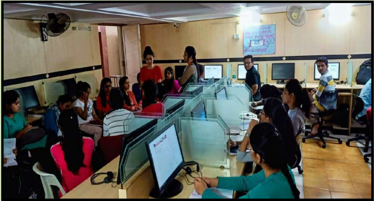
Language lab is in session