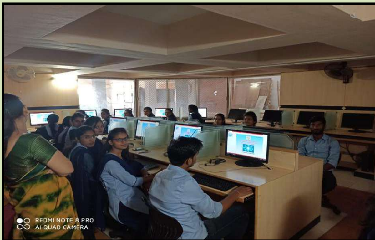
Language lab is in session