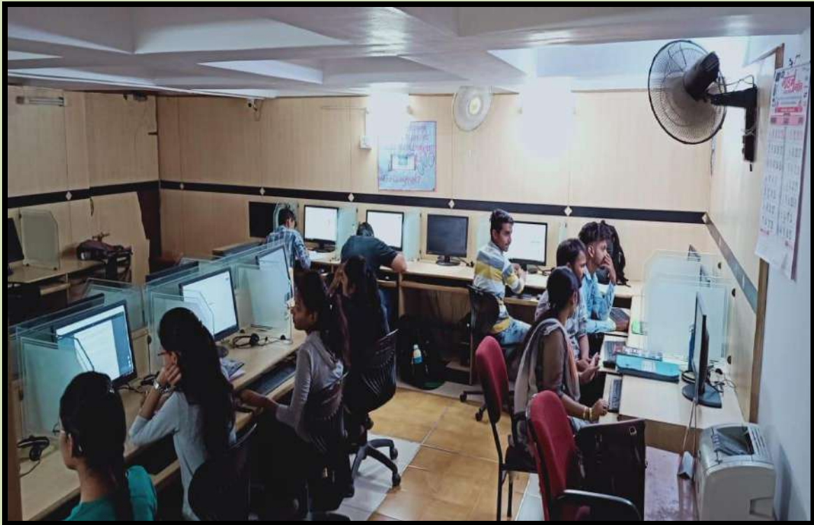
Students attending Language Lab sessions